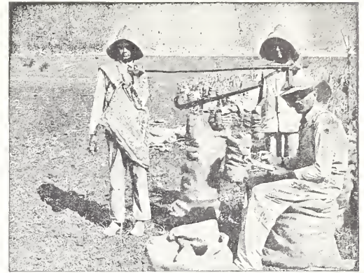
Measuring the Value of the Pedigree— Weighing up the yields from the "Mother Ears" in a corn breeding block on the Ferguson Seed Farms. This is one method of adding quantity to quality in breeding-up seed corn.

Surcropper , an early, quick maturing, drouth resisting, sure-crop white corn, having the drouth resisting qualities of June Corn and the earliness of northern corn. Is now a standard corn for six Southwestern States. Generally considered best for thin lands, for late spring or summer planting, and a better summer corn than June Corn.