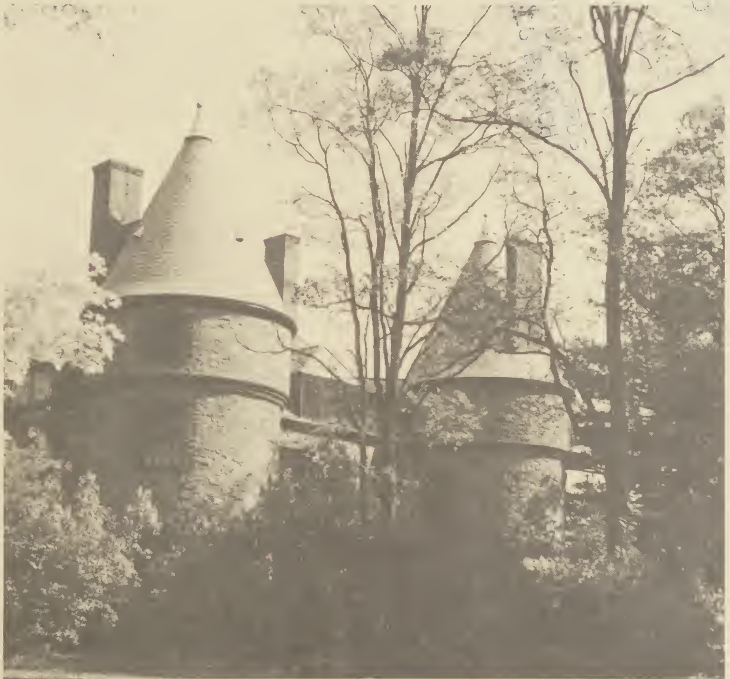
Grey Towers - Home of Gifford Pinchot