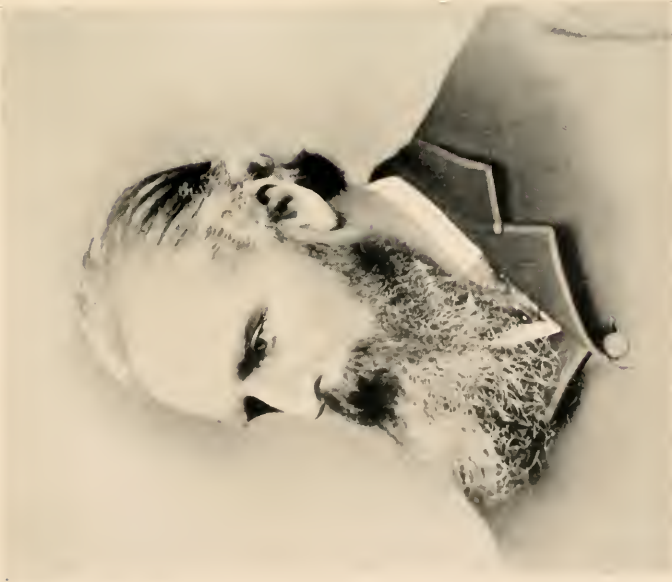
CANON H. B. TRISTRAM, F.R.S.