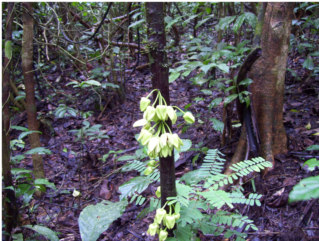
Figure 1 Uvariopsis dicaprio . Cauliflorous inflorescences on trunk.