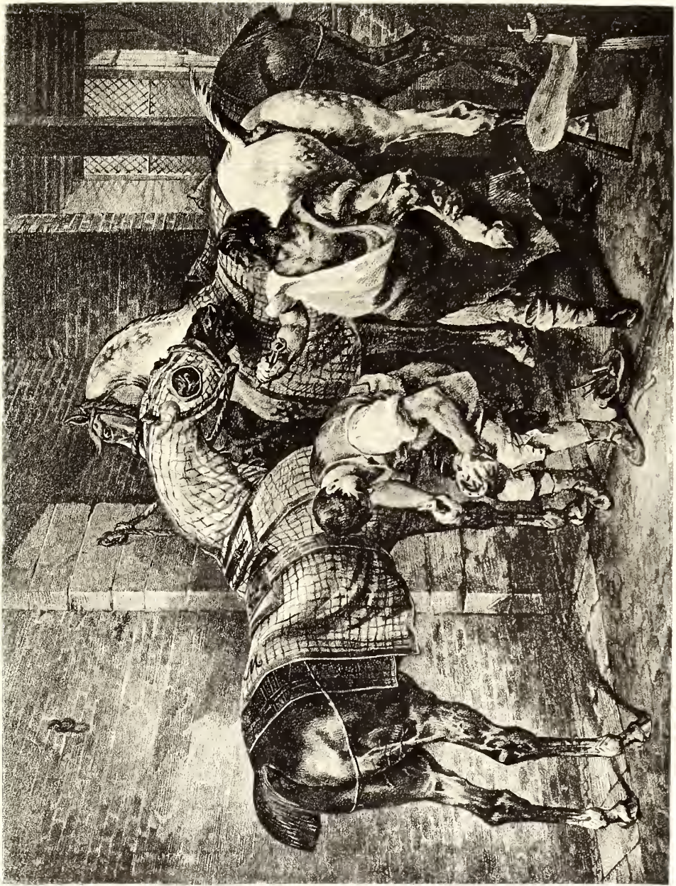
The English Turners