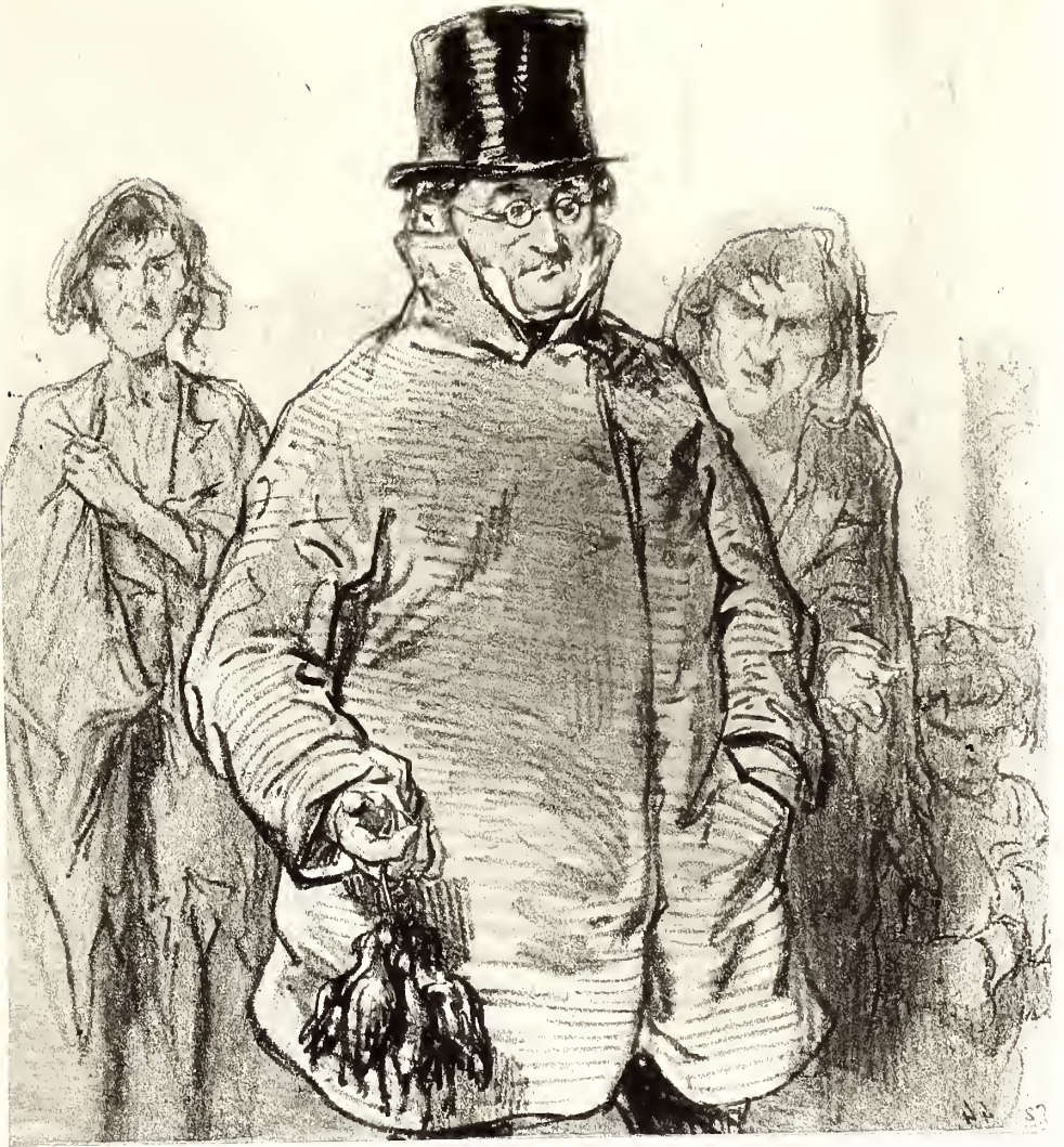
Le retour du marche