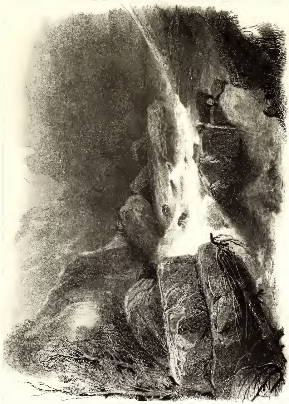
Cours de l'Ar à la Mendeck