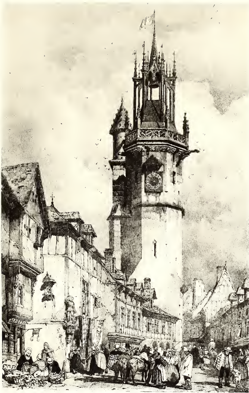
Cour du Gros Horloge Evreux