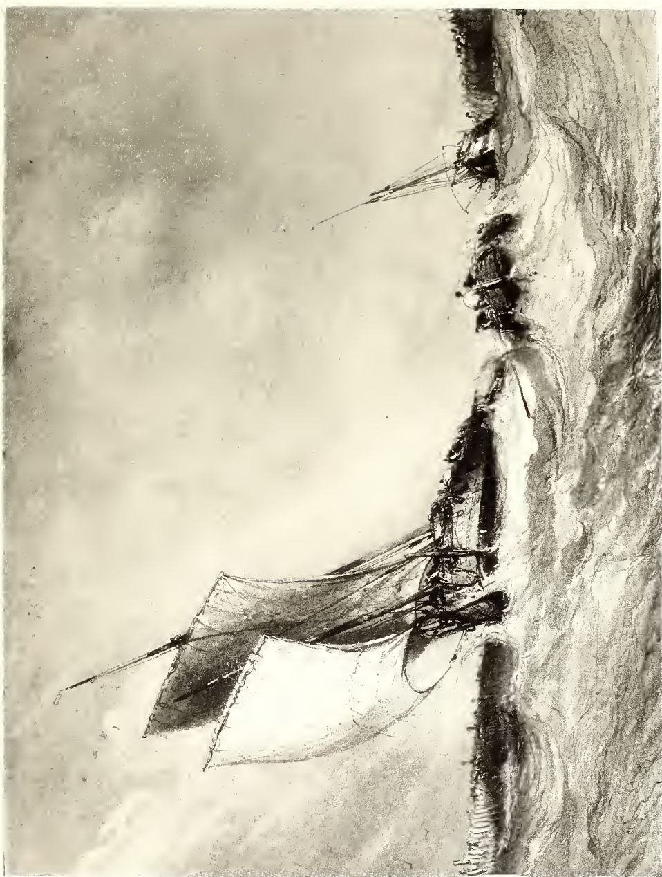
Pêcheurs au port