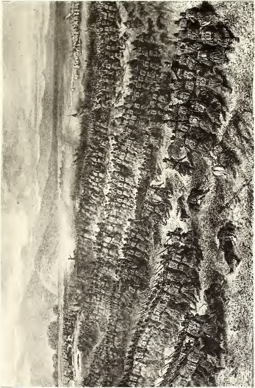
Battle of Tewkesbury