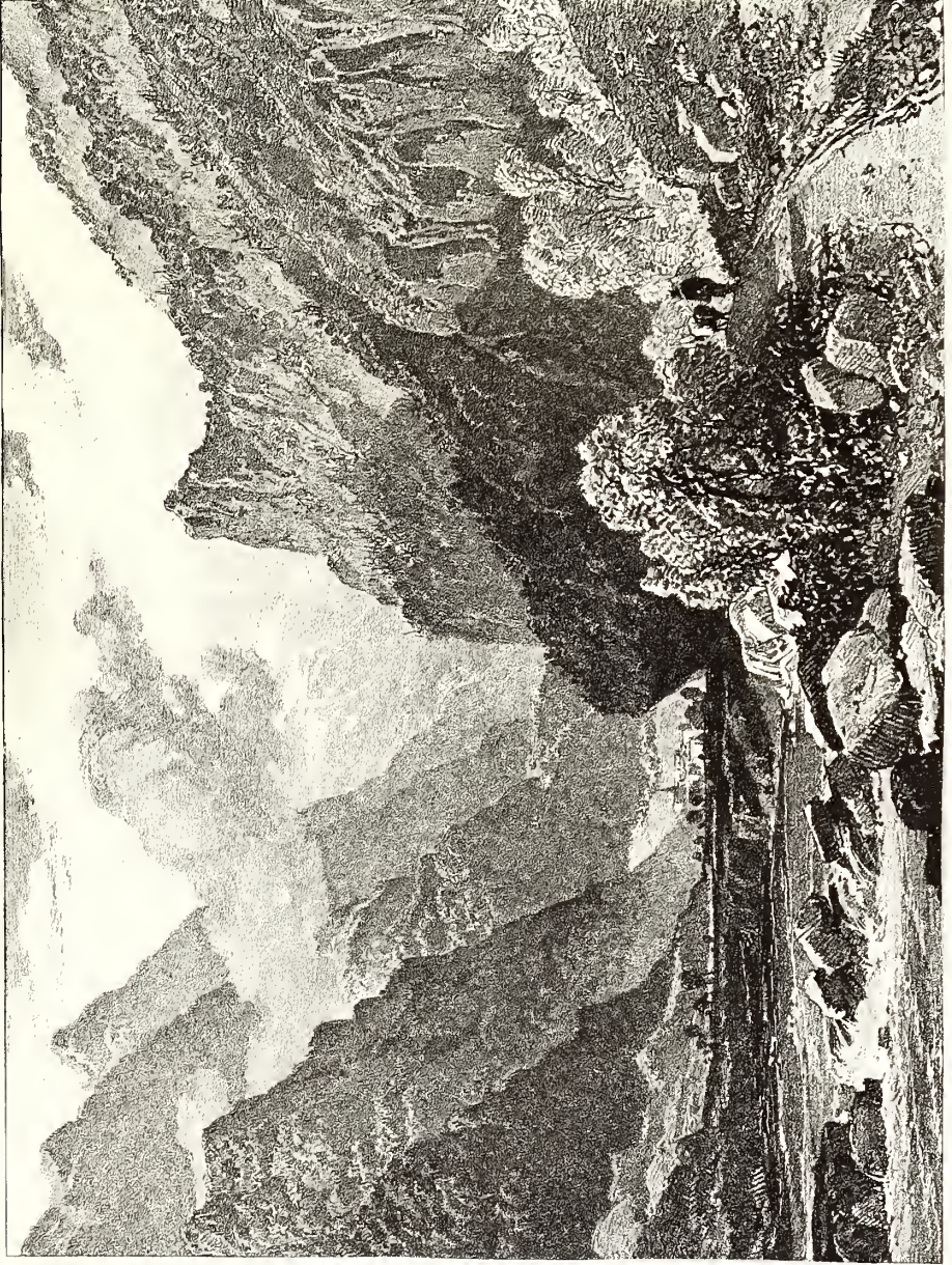
View of Mount Vesuvius