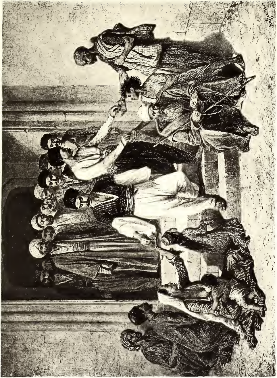
Cebens verband di las Mesque