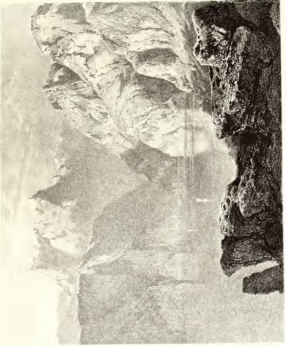
Vue des Quatre Cantons