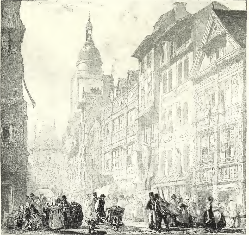
Rue des Gros Horloges Rouen