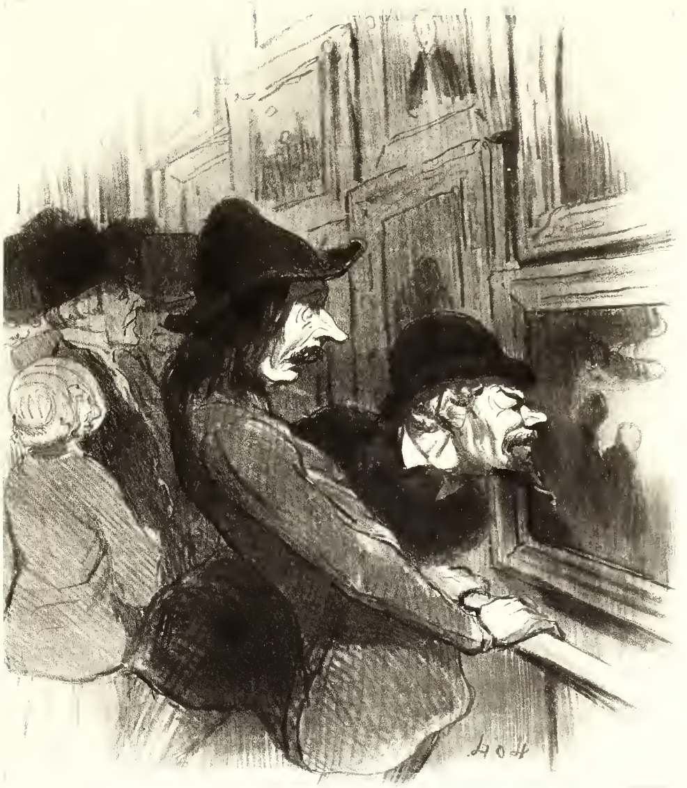
Le public du salon