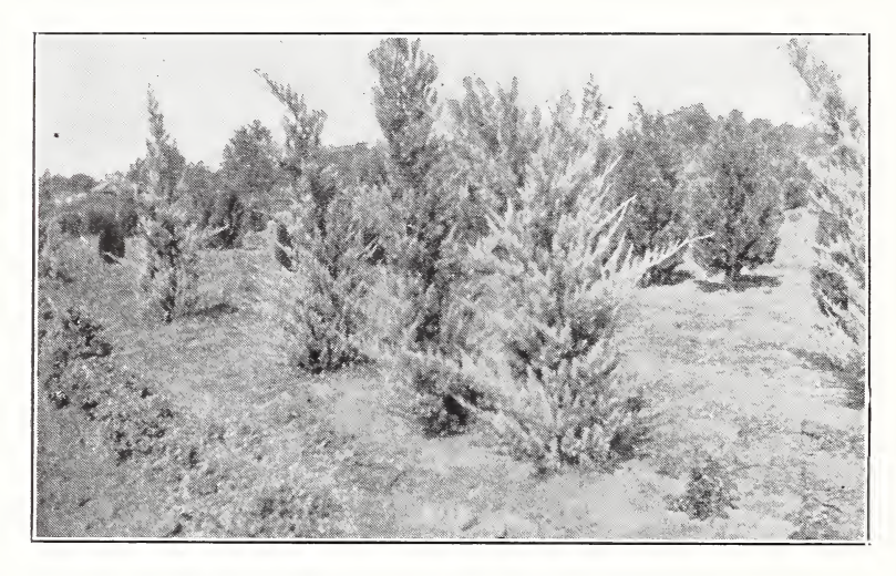
Juniperus Virginiana Glauca Are Sheared and Fine