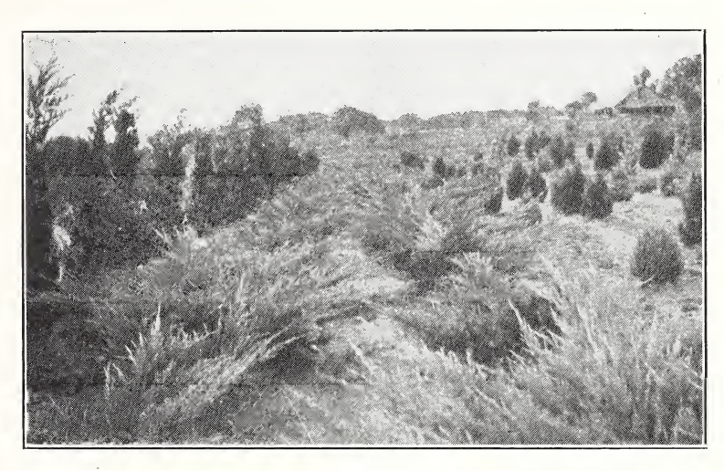
Some of the Juniperus Pfitzeriana We Are Offering This Year