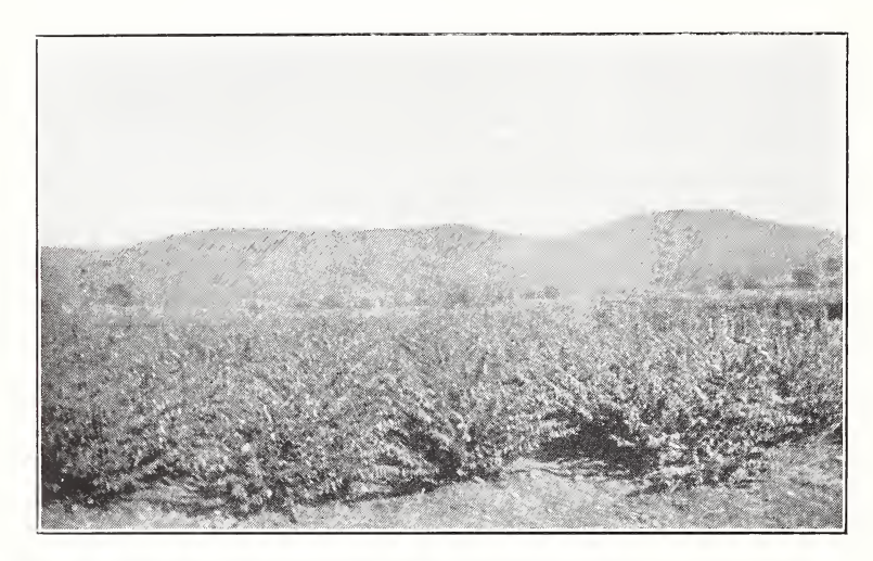
True Regelianum Privet, from Cuttings