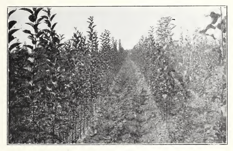
One-Year Budded Apple