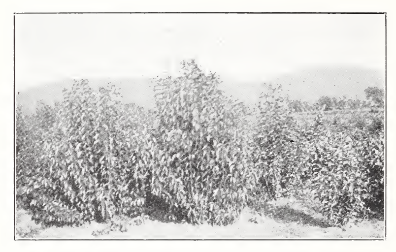
Ligustrum Japonicum-the Large-Leaf Type