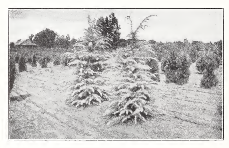
Cedrus Deodara, Showing Sheared Specimens