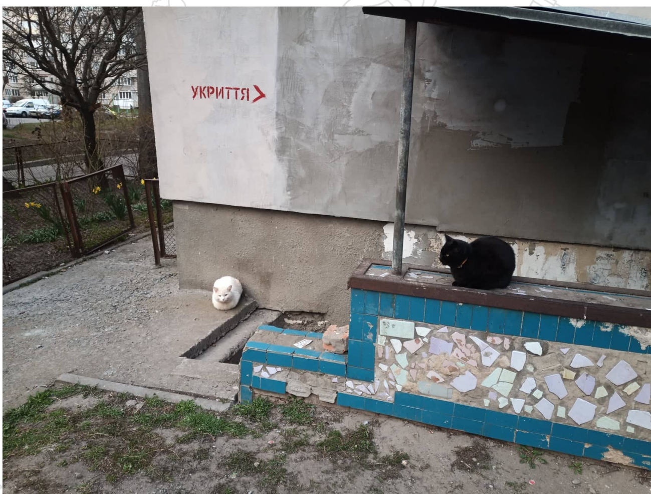
"Укриття", meaning "shelter", has become one of the words of the year, along with HIMARS :)