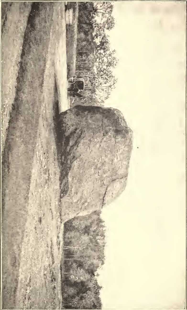
GRAVE OF JOHN ROYLE O'REILLY, WITH BOULDER, HOLYHOOD CEMETERY, BROOKLINE, MASS.