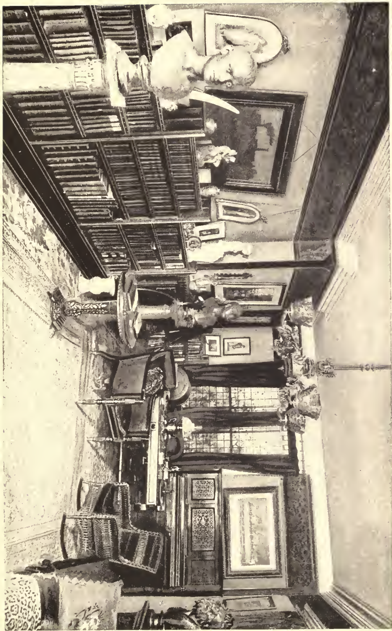
LIBRARY OF JOHN BOYLE O'NEILLY, AT HIS HOME, CHARLESTOWN, MASS.