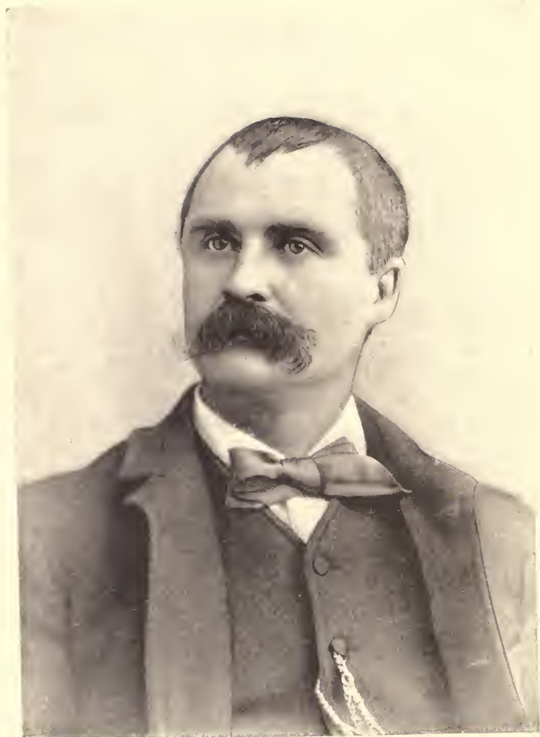
John Boyle O'Reilly.