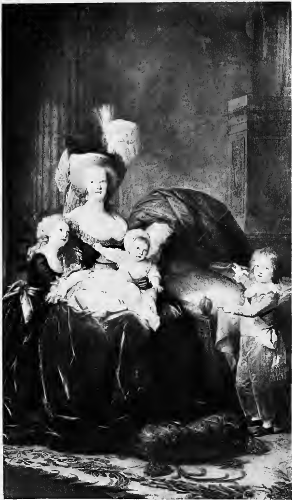
D. Appleton & Company