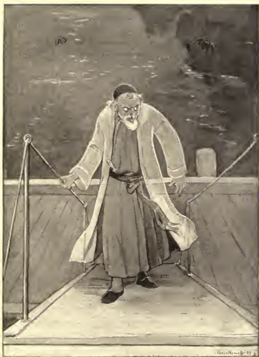
“ IN THE DEAD OF NIGHT SHYLOCK HAD STOLEN UP THE GANG-PLANK ”