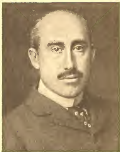
JOHN KENDRICK BANGS