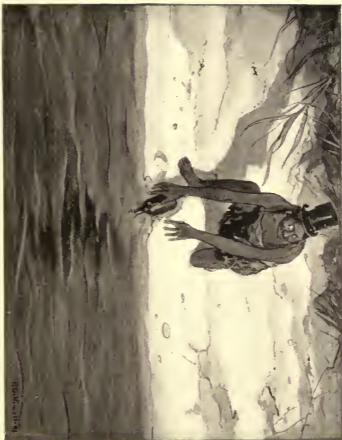
A BLACK PERSON BY THE NAME OF FRIDAY FINDS A BOTTLE