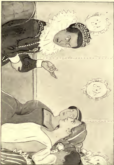
QUEEN ELIZABETH DESIRES AN AXE AND ONE HOUR OF HER OLDEN POWER