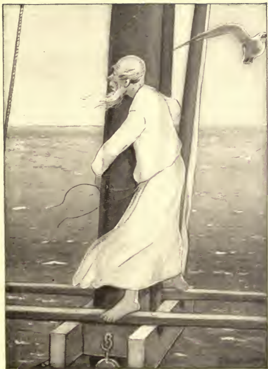
SHEM IN THE LOOKOUT