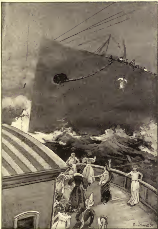
“ A GREAT HELPLESS HULK TEN FEET TO THE REAR ”