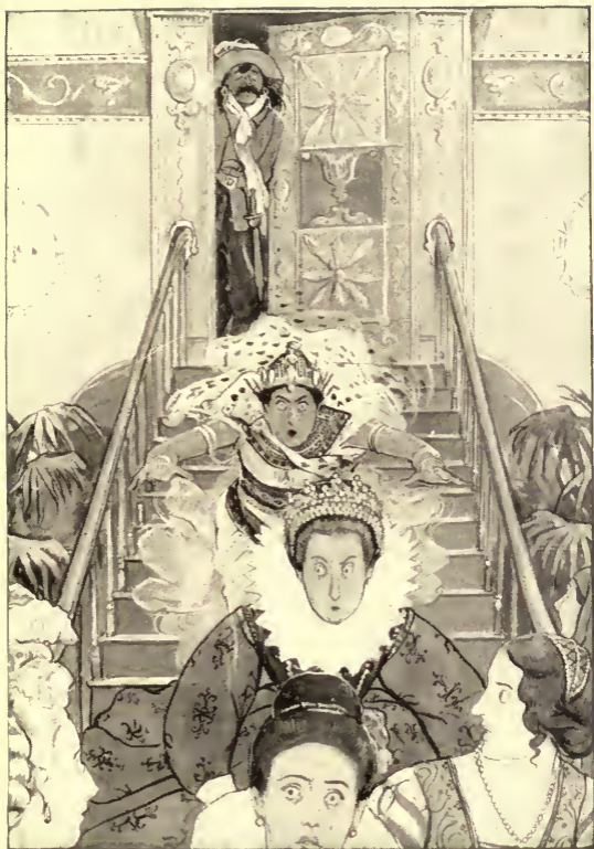
“THE HARD FEATURES OF KIDD WERE THRUST THROUGH”