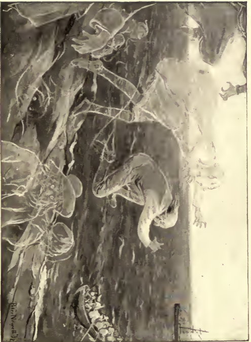
“THE PIRATES MADE A MAD DASH DOWN THE ROUGH, ROCKY HILL-SIDE”