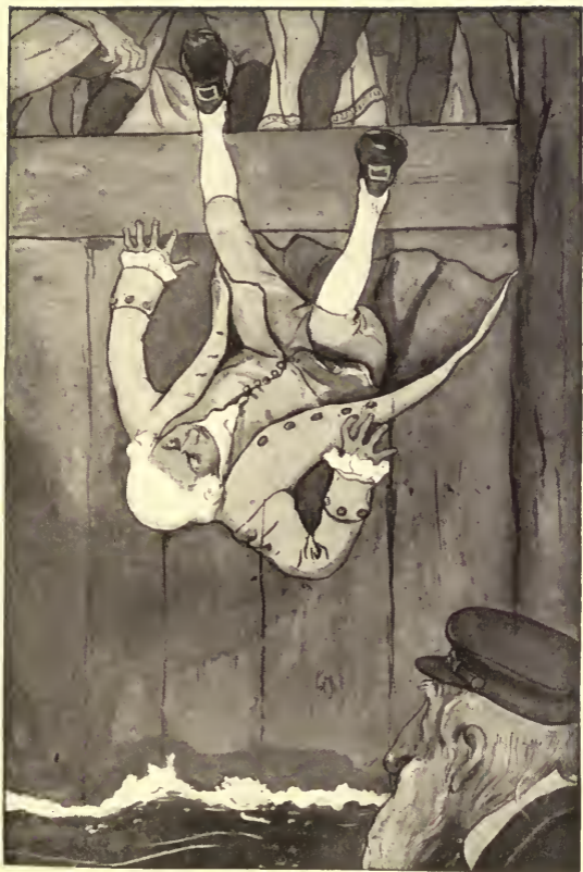
"POOR OLD BOSWELL WAS PUSHED OVERBOARD"