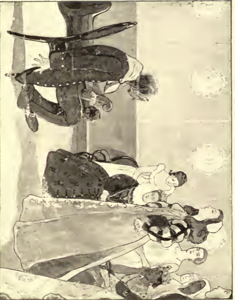
CAPTAIN KIDD CONSENTS TO BE CROSS EXAMINED BY PORTIA