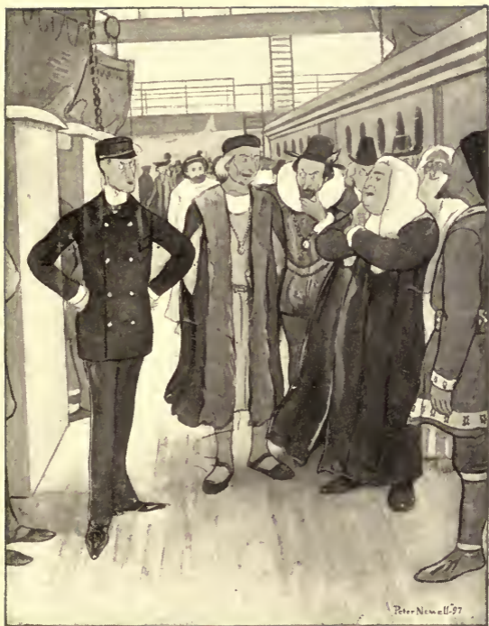
JUDGE BLACKSTONE REFUSES TO CLIMB TO THE MIZZENTOP