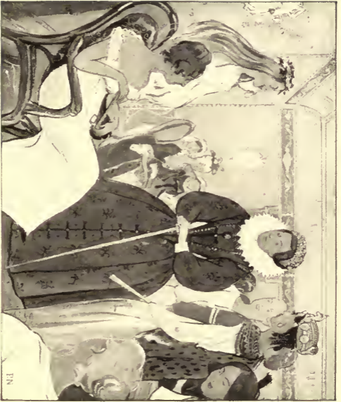
MADAME RÉCAMIER HAS A PLAN