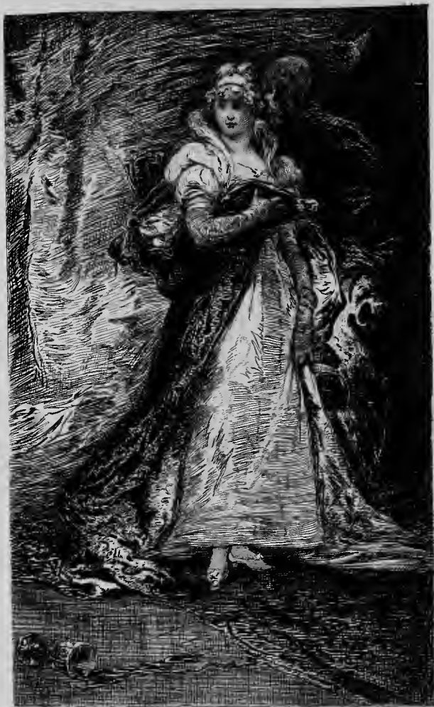
Lady Eleanor's Mantle.