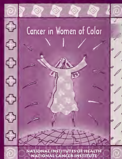
Cancer in Women of Color Monograph

This monograph—a collaboration between the National Institutes of Health's (NIH) National Cancer Institute (NCI) and the Office of Research on Women's Health (ORWH)—serves as a comprehensive source of data on cancer in nine populations of women of color: African Americans, Mexican Americans, Puerto Ricans, Cuban Americans, Asian Americans, Native Hawaiians, American Samoans, American Indians and Alaska Natives.