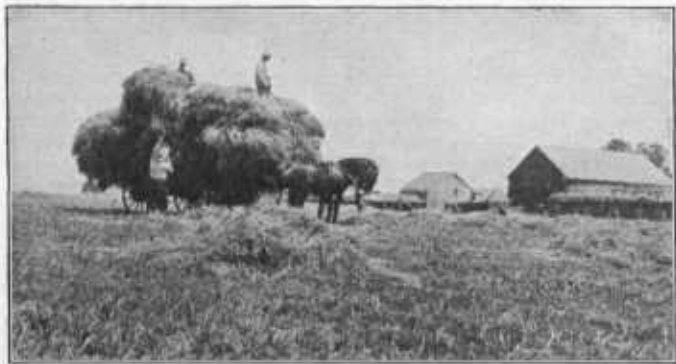
FIG. 3.—Hauling crimson-clover hay to the barn. This hay had been cut five days previously.

part of the shock is then inverted and the old top again placed in position on the old base of the shock, which has become the top. This permits a sufficiently rapid drying out of the shock without shattering the leaves.