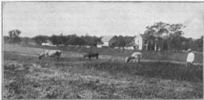
FIG. 5.—Cows pasturing on crimson clover. The clover in the immediate foreground has been cut and fed green to other stock.

or advised as to the proper stage to cut it for hay. Much less trouble is experienced by those who are accustomed to feeding it, since they do not feed it in large quantities but in mixture with other hay and are careful to cut it before it has passed the stage of full bloom. If the hay is sprinkled with water 12 hours before feeding, the danger of hair-ball formation is said to be considerably reduced. The danger is also greatly reduced if other hay or roughage be fed with the crimson clover. Occasionally, however, horses which have been fed judiciously as long as 10 or 12 years have become stricken with this complaint. Figure 4 shows two hair balls taken from different horses. Ordinarily, horses and mules only are affected with these hair balls.