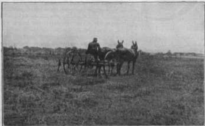
FIG. 1.—Tedding crimson-clover hay shortly after being cut. In the background the hay is being bunched or shocked with pitchforks.

After lying in the windrow for a day of good drying weather, the hay can be placed in small shocks, where it will cure nicely in three or four days unless rain should intervene. It ordinarily requires about a week from the time the hay is cut until it can be safely placed in