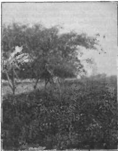
FIG. 7.—Crimson clover as a cover and green-manure crop. The clover on the left has been turned under to serve as green manure.

It is generally considered that a bushel of crimson-clover seed sown on 4 acres of ground will increase the succeeding yield of corn about the same amount as would a ton of complete fertilizer applied at the rate of 500 pounds per acre on 4 acres of similar land. The relative increase of such a crop as corn is greater on poor land than on fields already capable of producing good crops. If the land in question is so poor as to bring only 10 to 15 bushels of corn per acre, a good stand of crimson clover turned under will ordinarily double the yield. To obtain a satisfactory stand of the clover on such poor land, however, manure or commercial fertilizers, and often lime, must be applied. A part of the increased yield of the subsequent corn crop must be credited to the residual effect of the fertilizer used in connection with the crimson clover. On land that will make 30 bushels of corn per acre a yield of 45 bushels may ordinarily be expected following crimson clover. On land richer than this an increase of more than 10 bushels per acre is uncommon. A specific instance may be mentioned in the case of J. B. Watkins & Bro., of