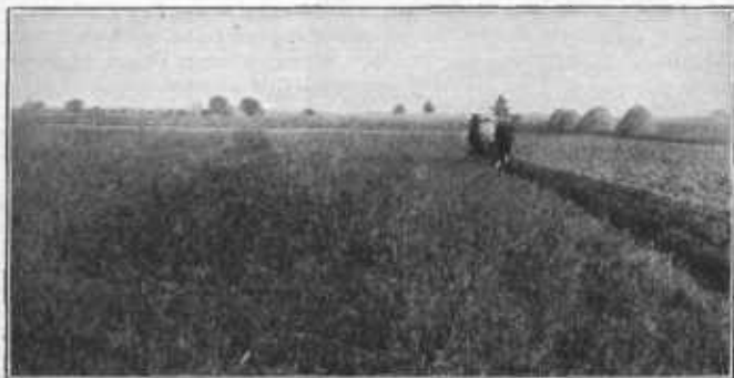
FIG. 6.—Plowing under crimson clover and grain stubble. The haystacks are to be seen in the background. The dark strip in the center was occupied the previous fall by corn shocks.

Milch cows have been observed to make more milk when pastured on crimson clover than when pastured on red clover or alsike clover. Crimson clover may also be pastured with horses and pigs. The only drawback to its utilization as pasture is the fact that its season is comparatively short, not extending beyond two months in the spring. Pigs, sheep, calves, and chickens may, however, obtain considerable pasturage during the fall and open winter months. Cattle are somewhat subject to bloating if pastured on crimson