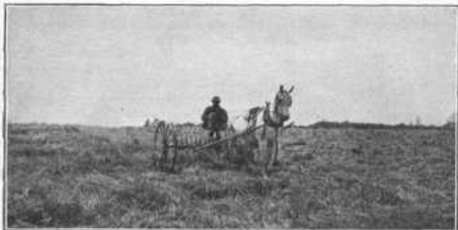
FIG. 2.—Raking crimson-clover hay. After being tedded once or twice the hay is raked into windrows and later placed in large bunches or shocks.

the barn. For the best results in curing, both the ground and the air should be warm and dry. The hay should not be hauled to the barn until it is dry enough to rattle when handled with a fork. (See fig. 3.)