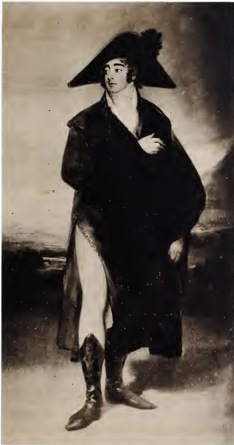
CONDE DE FERNÁN NÚÑEZ