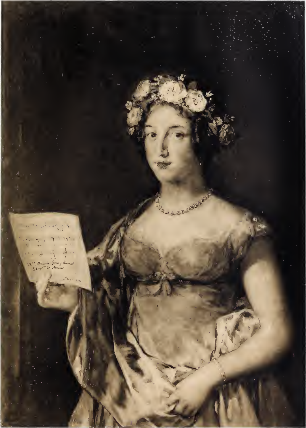
DUQUESA DE ABRANTES