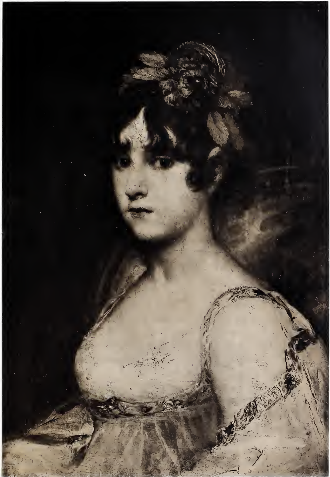
CONDESA DE HARO