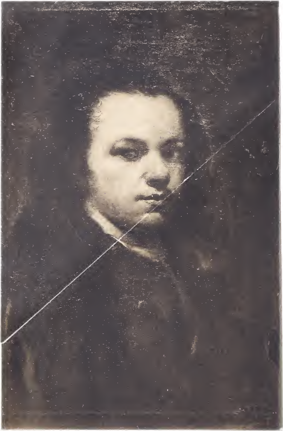
GOYA AS A YOUNG MAN. SELF-PORTRAIT