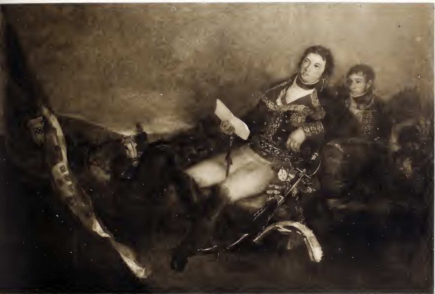
DON MANUEL GODOY