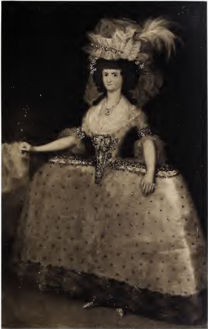
QUEEN MARIA LUISA