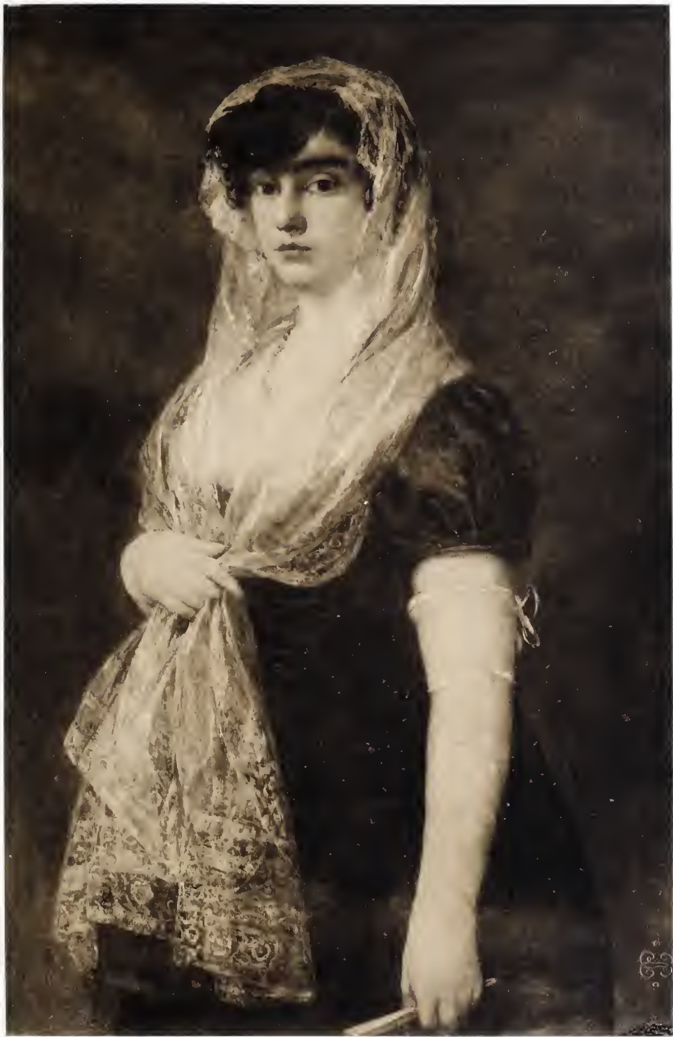
THE BOOKSELLER OF CALLE DE CARRETAS