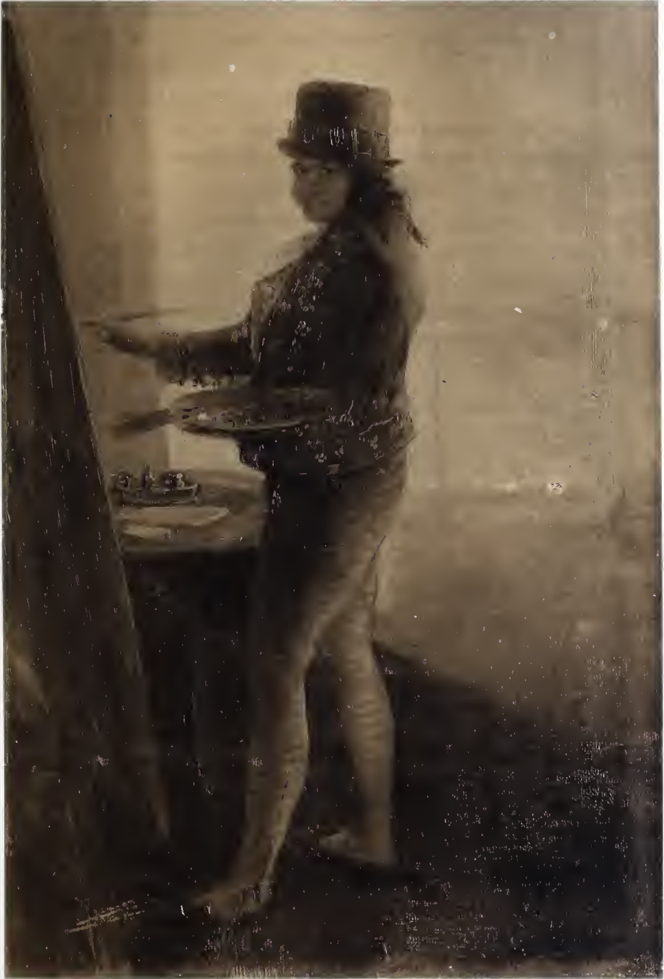
SELF-PORTRAIT OF GOYA