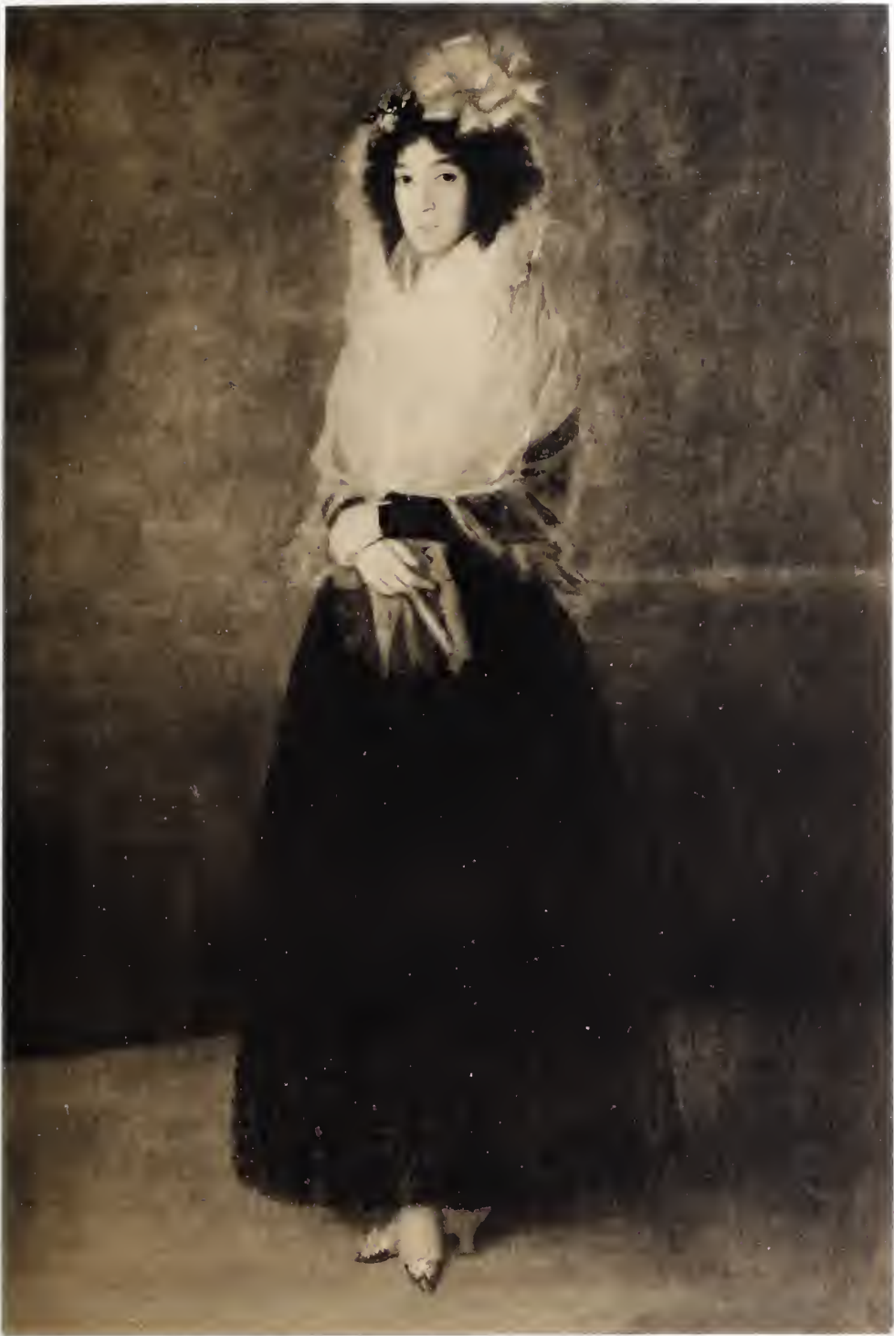
MARQUESA DE LA SOLANA