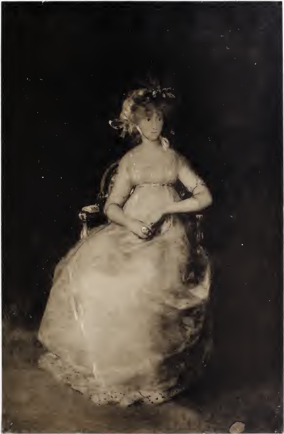
CONDESA DE CHINCHÓN