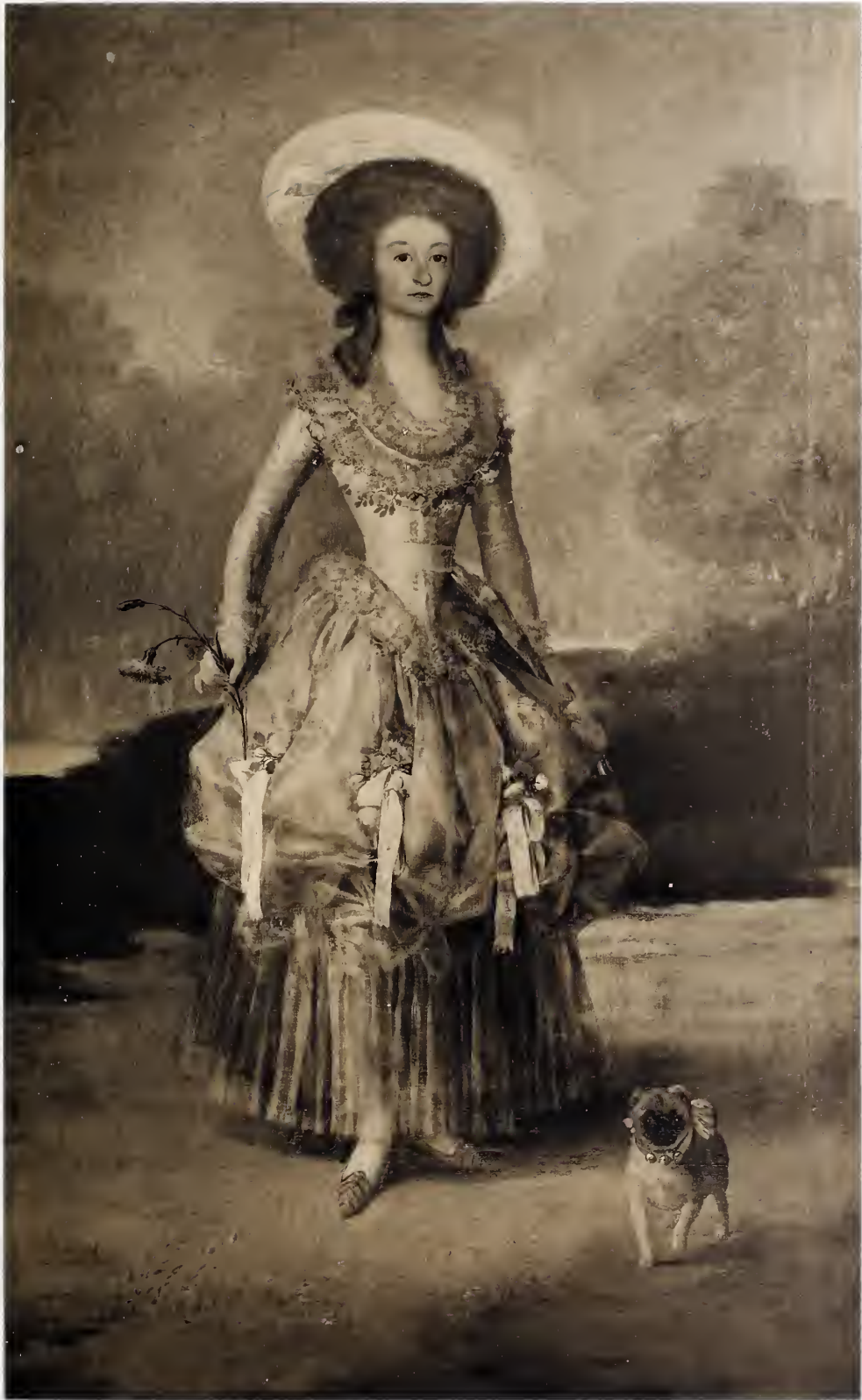
MARQUESA DE PONTEJOS