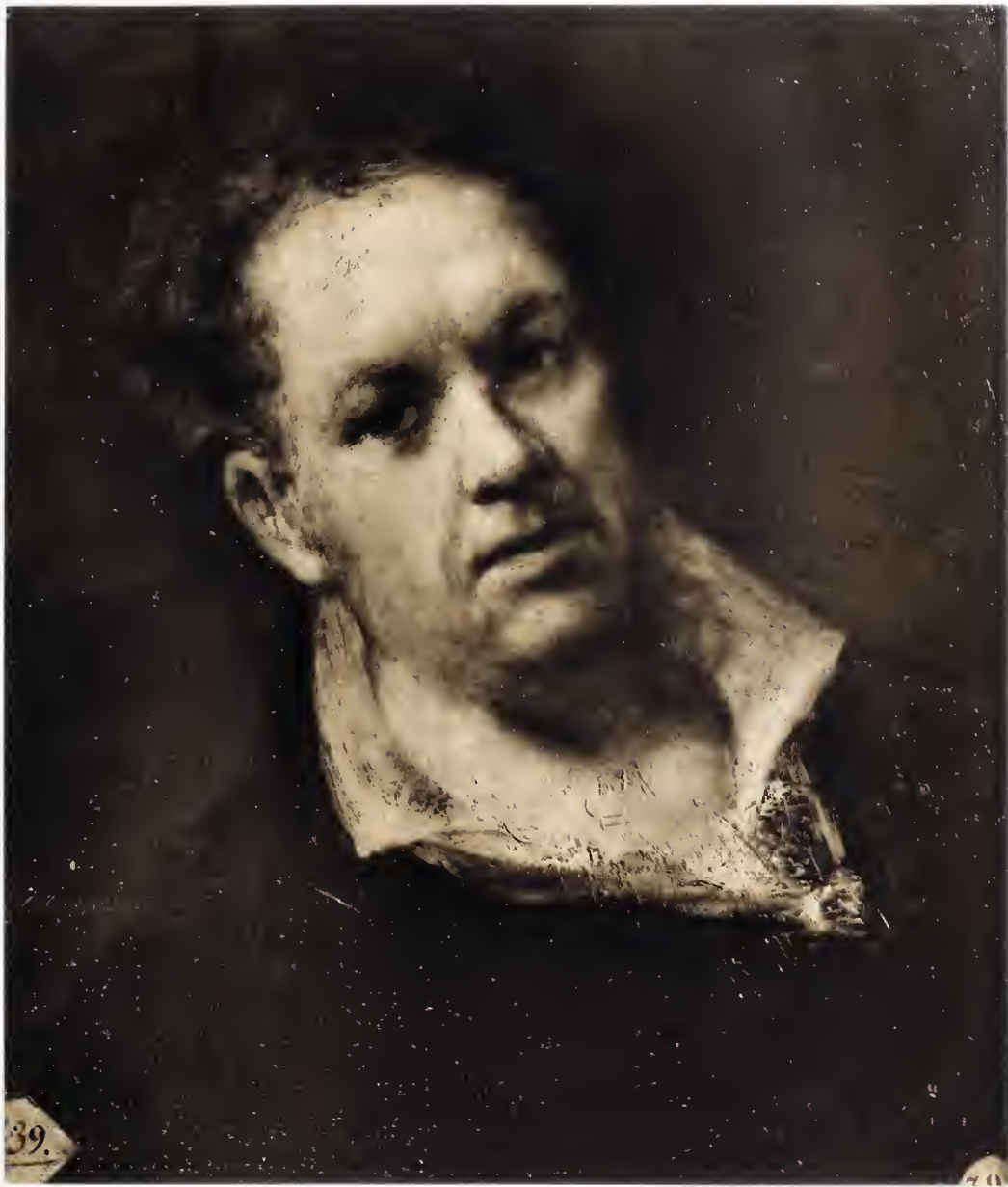
GOYA IN 1815. SELF-PORTRAIT