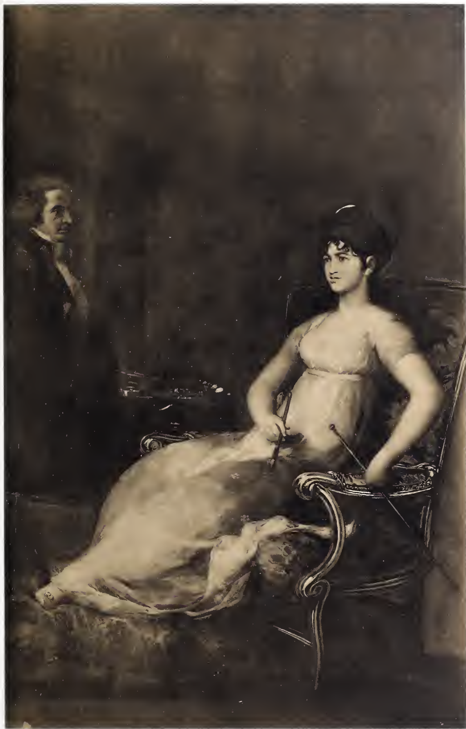
D A MARIA TOMASA PALAFOX Y PORTOCARRERO, MARQUESA DE VILAFRANCA