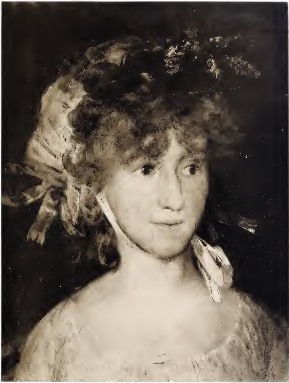
CONDESA DE CHINCHÓN (DETAIL)