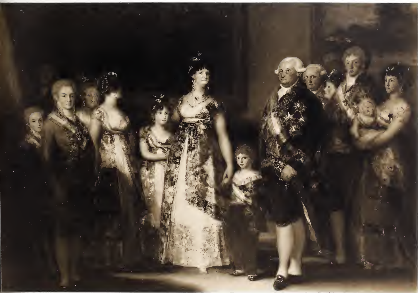
THE FAMILY OF CHARLES IV