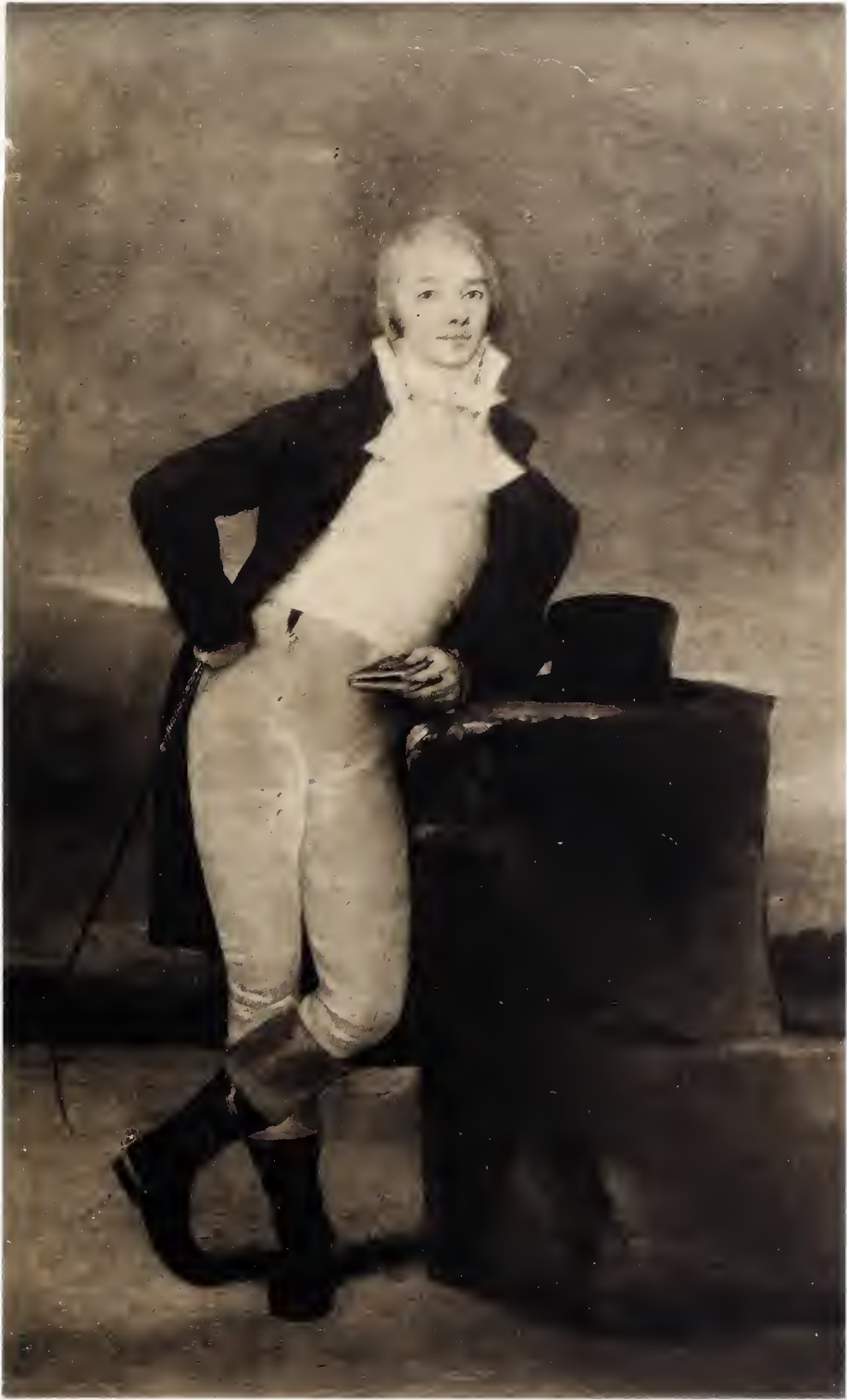
MARQUÉS DE SAN ADRIÁN