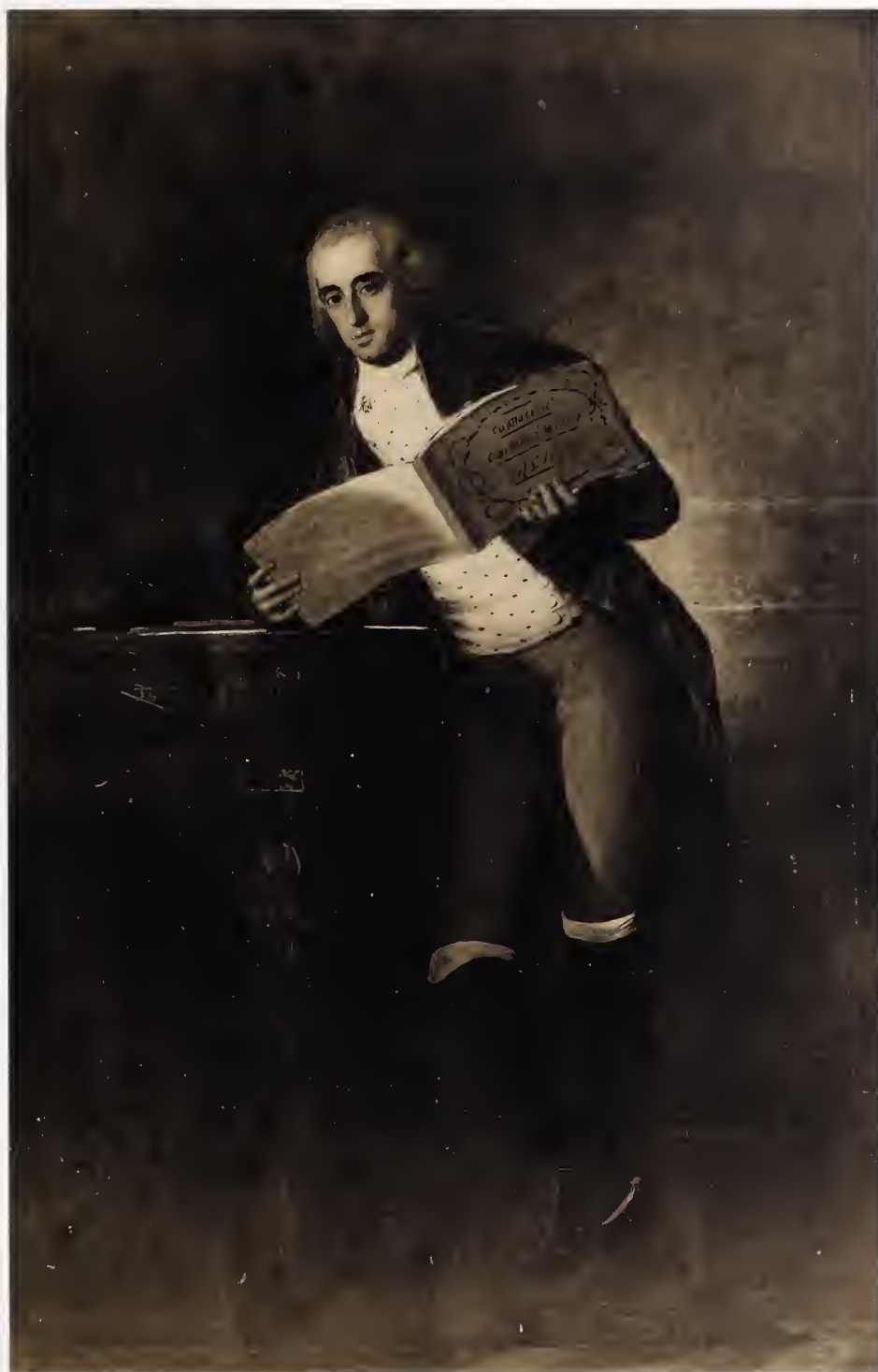
D. JOSÉ ALVAREZ DE TOLEDO, DUQUE DE ALBA