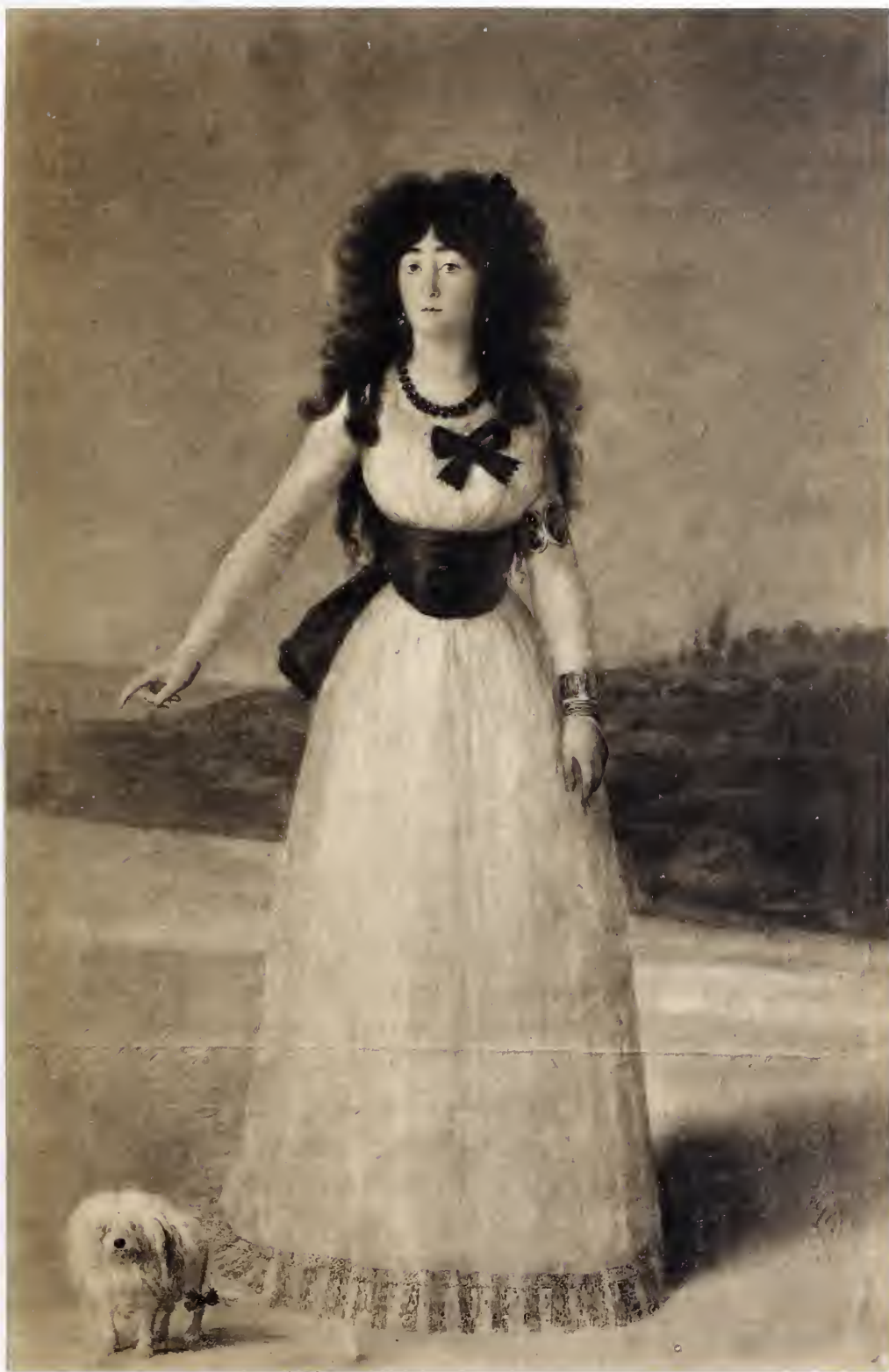
DUQUESA DE ALBA