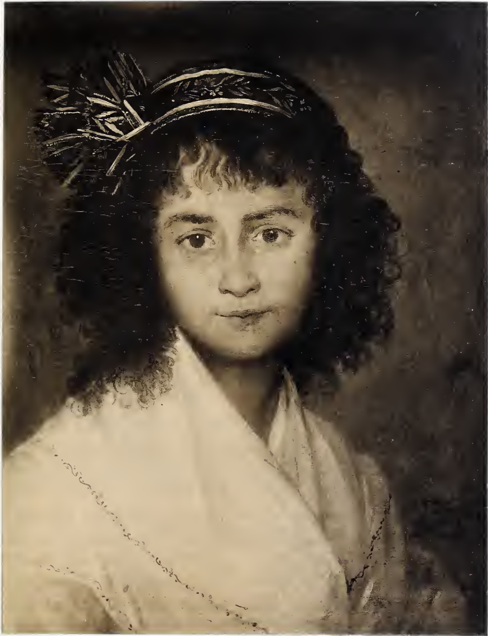
PORTRAIT OF A YOUNG GIRL