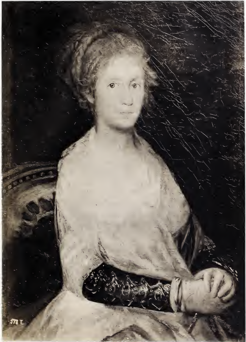
D A JOSEFA BAYEU, WIFE OF GOYA