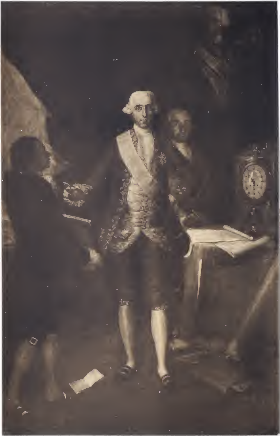
CONDE DE FLORIDABLANCA