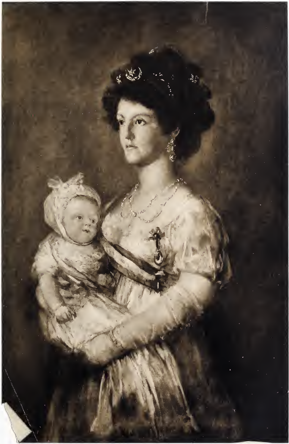
THE INFANTA MARIA LUISA