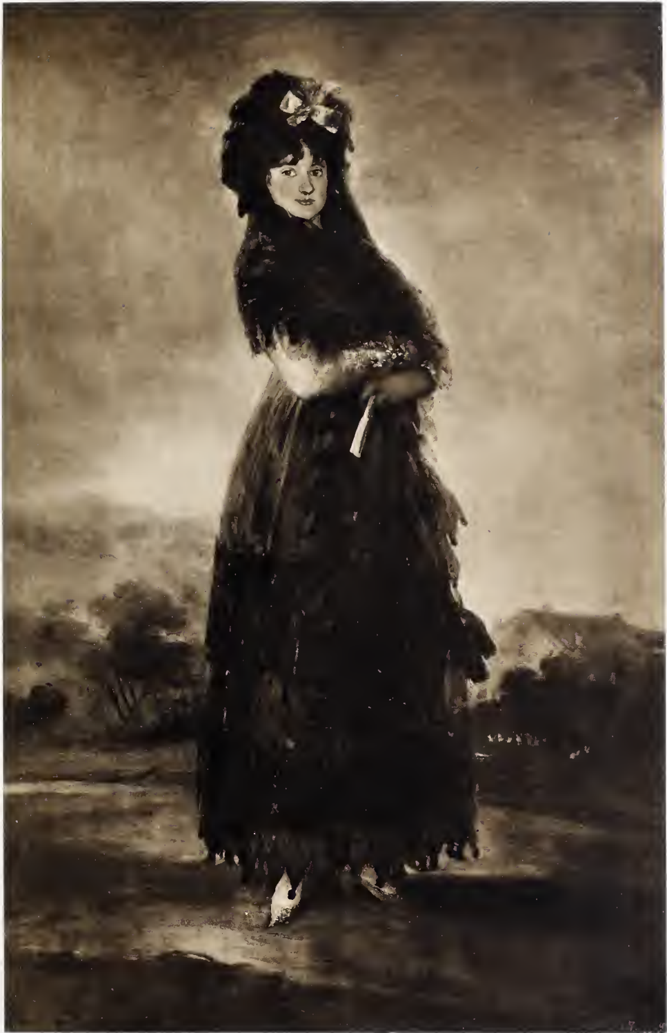
MARQUESA DE LAS MERCEDES