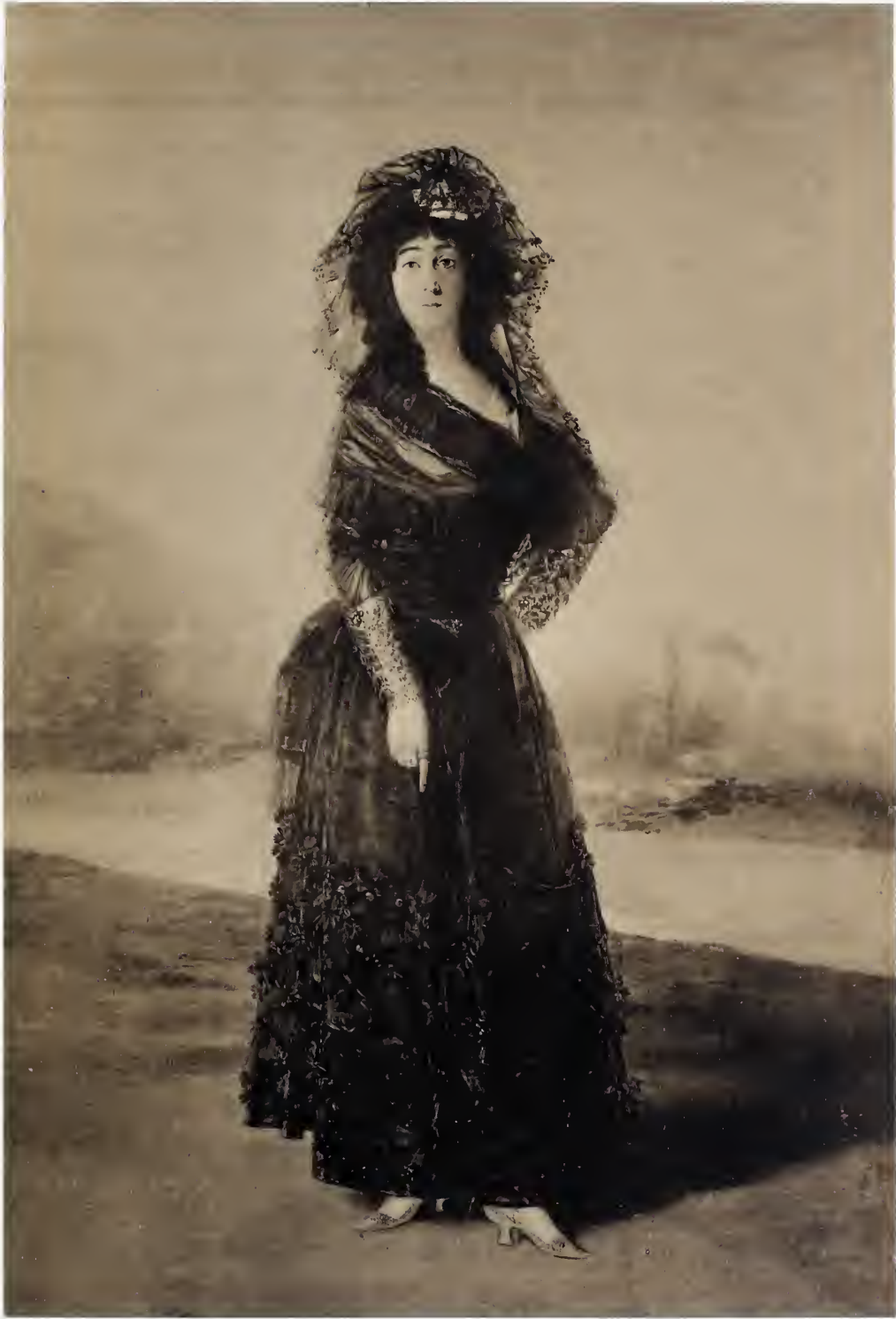
DUQUESA DE ALBA