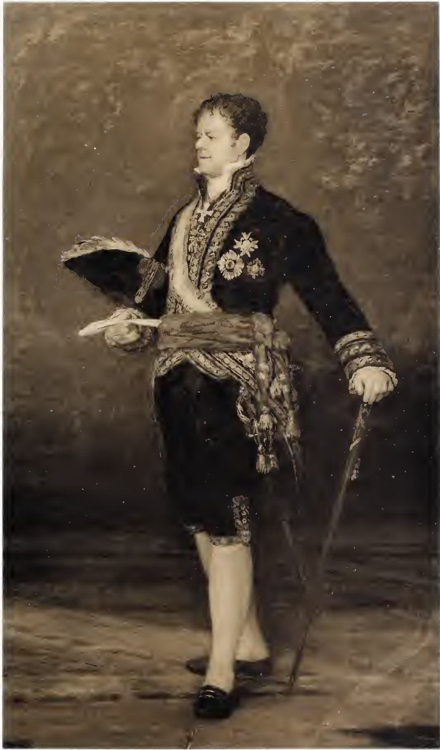
DUQUE DE SAN CARLOS