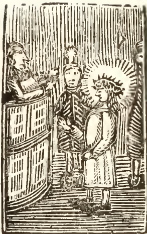
Christ brought before Pilate.

The inscriptions are placed beneath the cuts exactly as they stand in the original sheet.