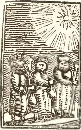
3 Wise Men.