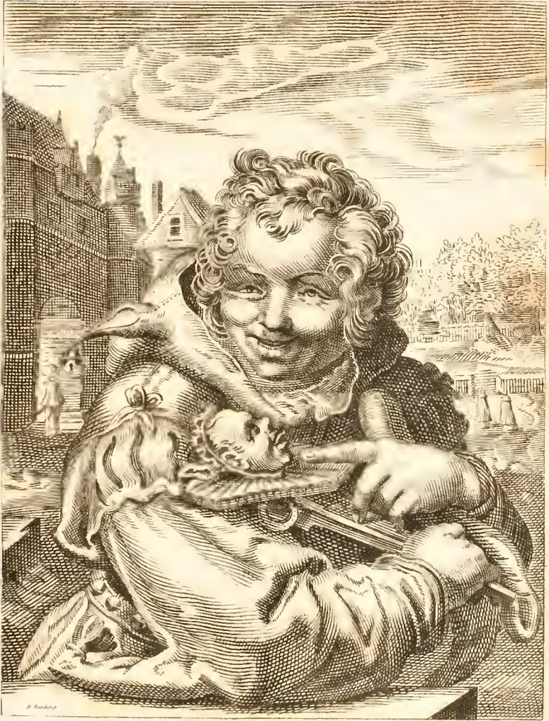
From a Print by Goussier after H. Kneller.

When Friars Monks and Priests of former days Apocrypha and Scripture turn'd to Plays The Festivals of Fools and Aises kept Obey'd Boy Bishops and to crosses crept They made the numming Church the People's rod And held the grinning Bauble for a God