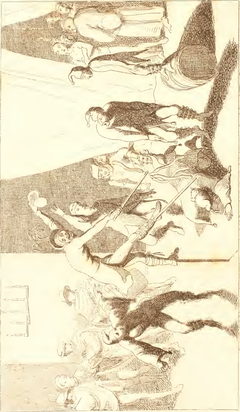
Facsimile Engraved by George Cruikshank from an original Oil Picture 15 inches high by 25 inches wide in the possession of William Home.