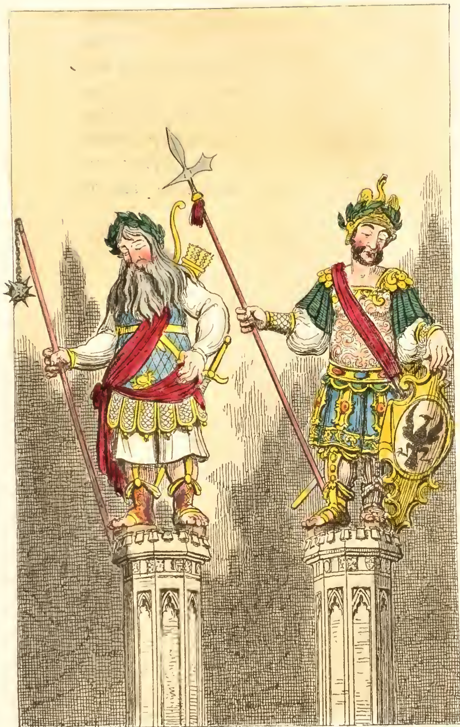
THE GIANTS IN GULDBHALL