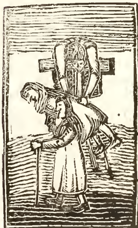
Taken down from the Cross.

at the table; in the middle sat the Dean, and those of the king's chapel, who immediately after the king's first course 'sang a caroll.'—( Leland. Collect. vol. iv. p. 237.)—Granger innocently observes that 'they that fill the highest and the lowest classes of human life, seem in many respects to be more nearly allied than even themselves imagine. A skilful anatomist would find little or no difference in dissecting the body of a king, and that of the meanest of his subjects; and a judicious philosopher would discover a surprising conformity in discussing the nature and qualities of their minds.'— Biog. Hist. Engl. ed. 1804, vol. iv. p. 356.