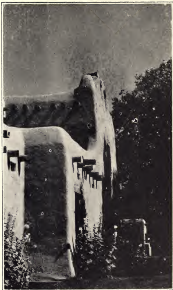
EAST ENTRANCE TO ART MUSEUM 10