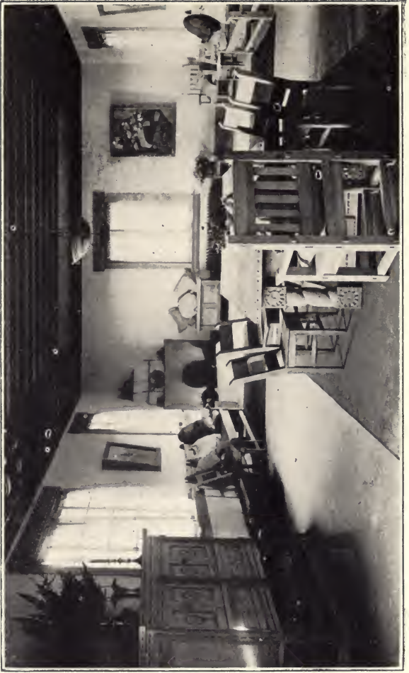
RECEPTION ROOM OF WOMAN'S MUSEUM BOARD