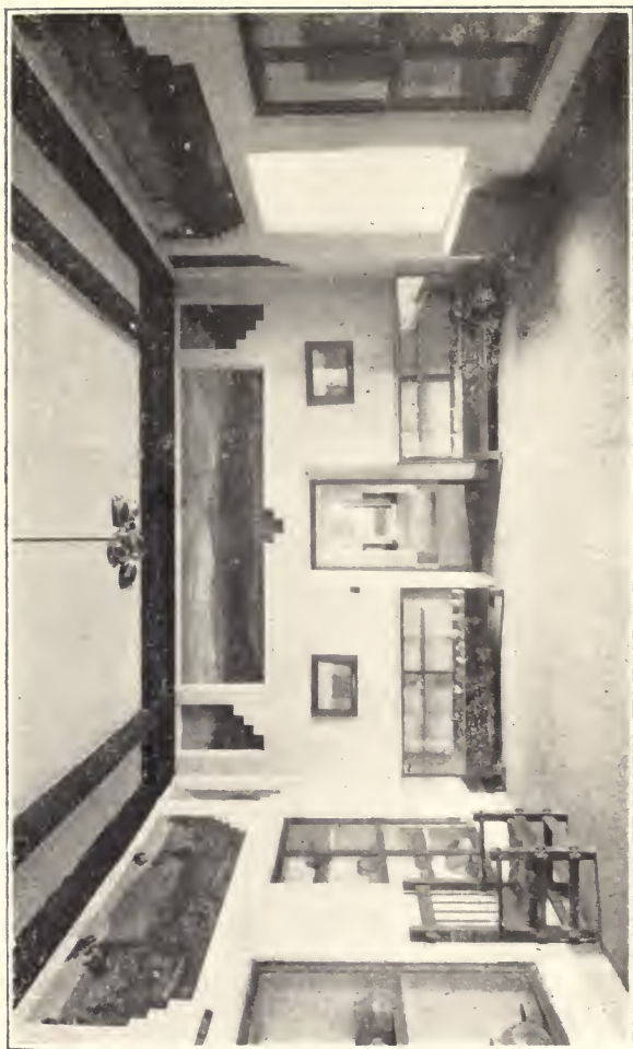
PUYE ROOM, PALACE OF THE GOVERNORS