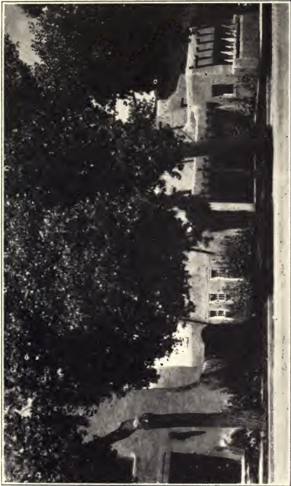
THE DIRECTOR'S RESIDENCE, SCHOOL OF AMERICAN RESEARCH