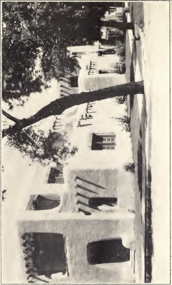
EAST FAÇADE OF ART MUSEUM