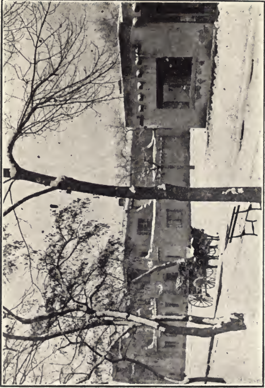
ART MUSEUM ON A WINTER'S DAY