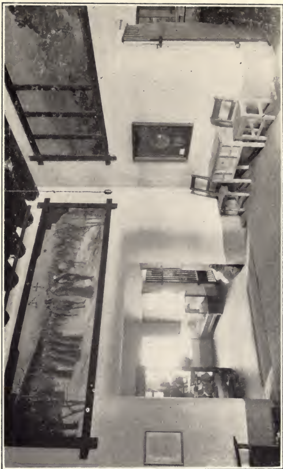
MAIN ENTRANCE HALL, PALACE OF THE GOVERNORS