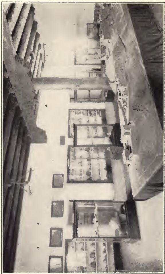
MODEL OF PECOS AND ARCHAEOLOGICAL EXHIBITS