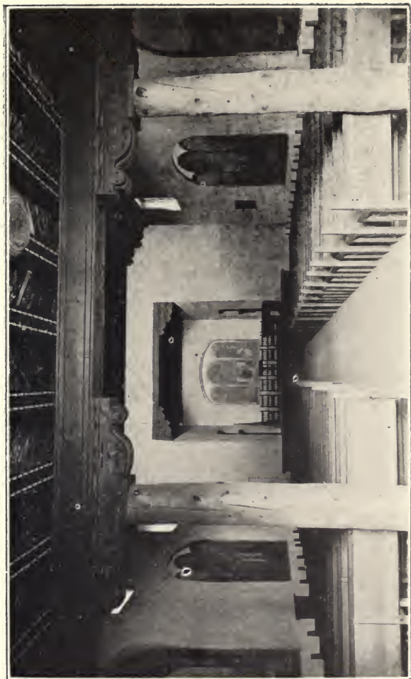
ST. FRANCIS AUDITORIUM, ART MUSEUM