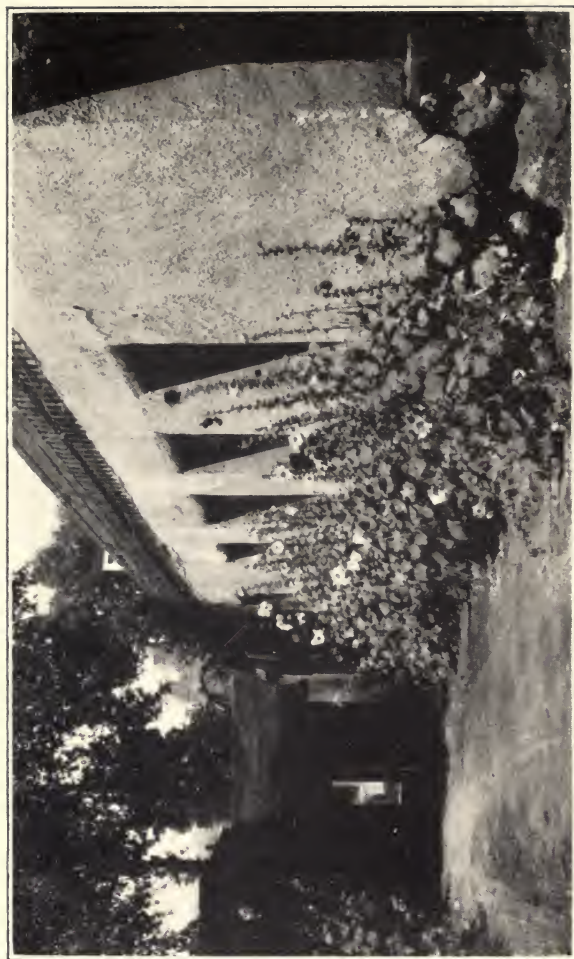
IN THE PATIO OF THE PALACE