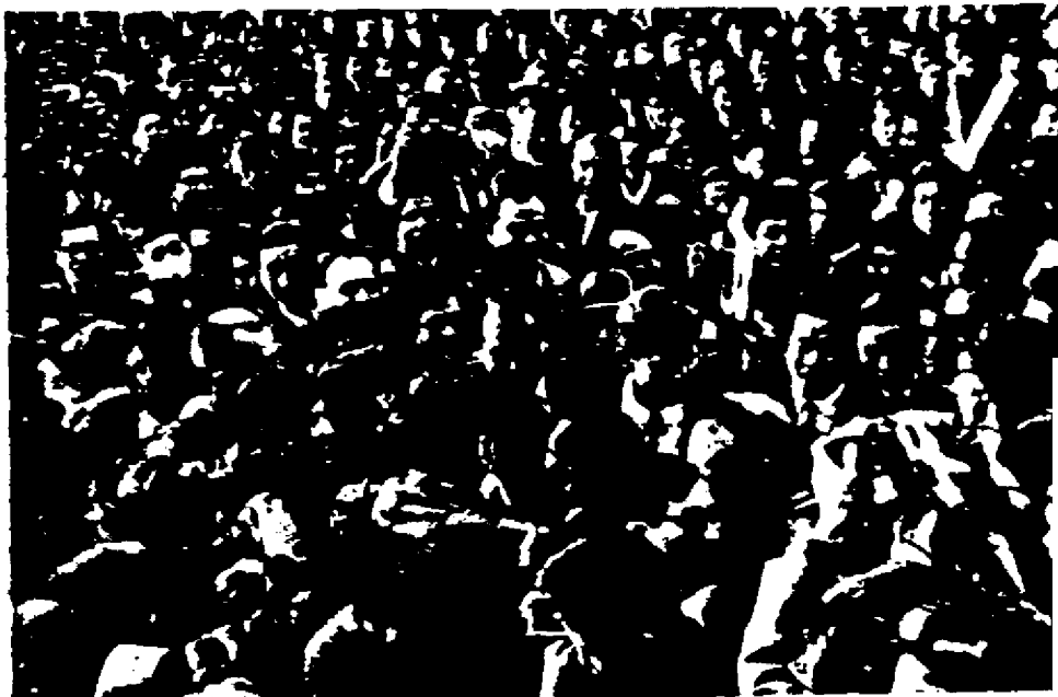
ATTORNEY GENERAL KENNEDY WITH WASEDA UNIVERSITY STUDENTS Looking, listening and learning to overcome lack of experience.

Such a Promotion. From sunup to midnight, from Prime Minister's residence to backstreet sake house, Bob Kennedy shook hands, sang songs, asked questions, argued issues, made speeches—and explained the aims of the U.S. under his brother's Administration. The Japanese, accustomed to patriarchs in public life, marveled at his youth. Said a Japanese Supreme Court justice after meeting Bobby: "He must have worked and studied hard to achieve such a pace in promotion." At the Diet, Lower House Speaker Ichiro Kiyose, 77, and Upper House President Tsuruhei Matsuno, 78, watched Kennedy and sighed wistfully. "The days are here," said Matsuno, "for the younger generation to take over." Bobby gracefully deferred to age: "We gain by