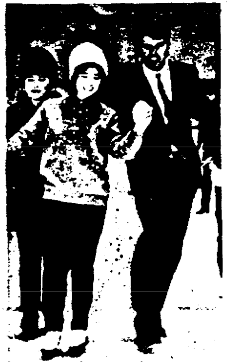
SKATING IN TOKYO "Do you like Japanese women?"

From Osaka, the party drove to an ancient Buddhist temple at Nara, where priests offered Kennedy incense sticks, indicated a nearby bronze kettle where the sticks are traditionally burned by visitors. Kennedy motioned to accompanying Ambassador Edwin O. Reischauer. "What are the implications if I do this?" Replied