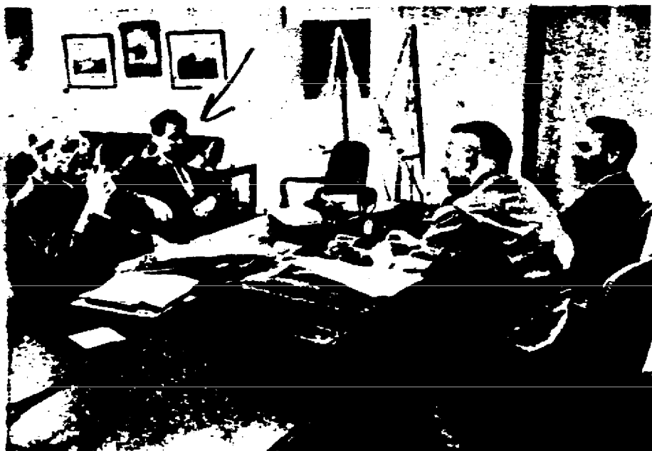
DISCUSSING THE CIA WITH BURKE, TAYLOR & DULLES Between brothers, a mysterious osmosis.