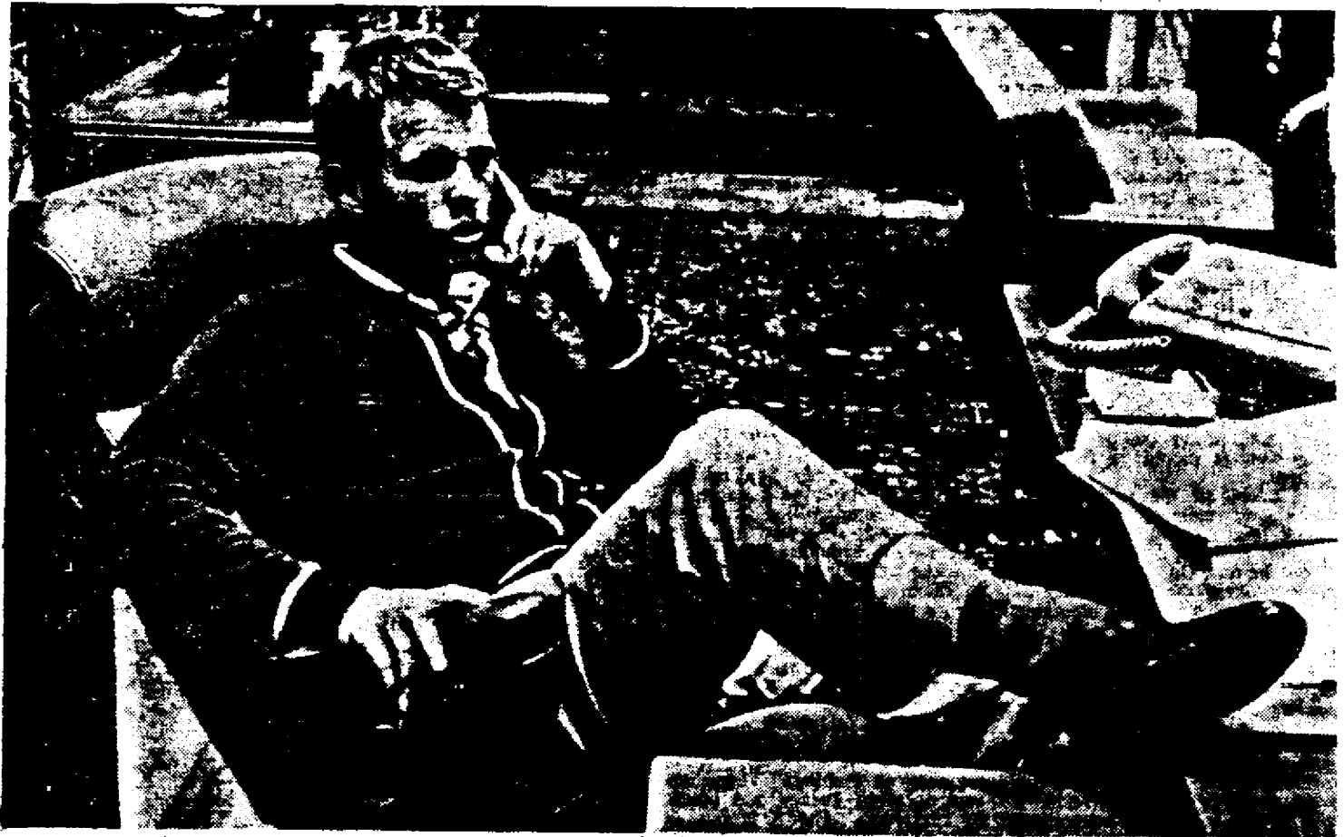
The American Attorney-General giving a Press conference in his vast and dignified office.