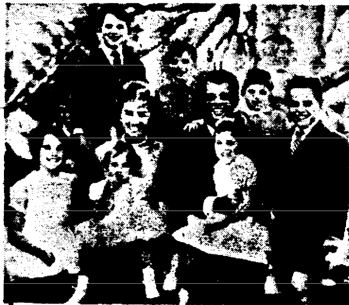
Robert and Ethel Kennedy with their seven children.

The President has sought his advice more at times of crisis than in the formulation of policy. He uses him as a living report card to get judgment on other people, and he is the one man who can make the lofty