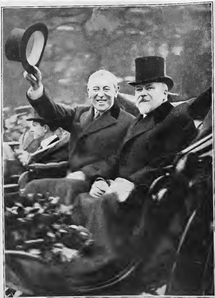
THE ENTRY INTO PARIS President Wilson and President Poincaré