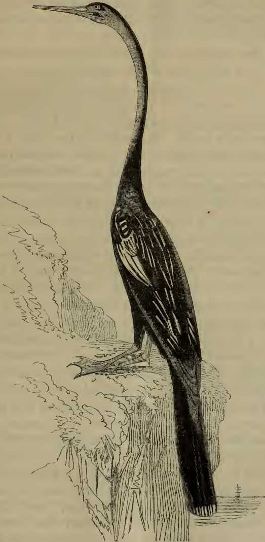
Black-bellied Darter, ( Plotus Anhinga ).