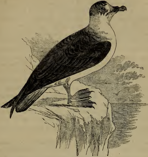
The Capped Petrel ( Procellaria hæsitata ), one-sixteenth of the natural size.

few dark feathers on the flanks. The back and shoulders are covered