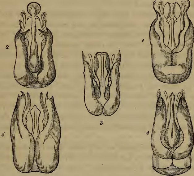
1. Sexual organs of the male of Vespa Germanica . 2. Ditto of V. vulgaris . 3. Ditto of V. rufa . 4. Ditto of V. sylvestris (holsatica, Fab.) 5. Ditto of V. Norwegica .

worker also varies in being destitute of the lateral rufous spot on the second abdominal segment, this occurs only in one in thirty or forty individuals. The sex that varies most is the male, which is frequently without the rufous spots, and the black bands vary much in width, the segments frequently having an extremely narrow black apical margin.