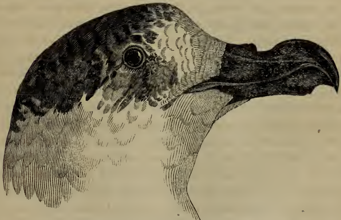
Head of the Capped Petrel, (natural size).

with brownish gray and blackish brown feathers, the former appearing to have been but lately assumed, but many of the latter are "sedgy"