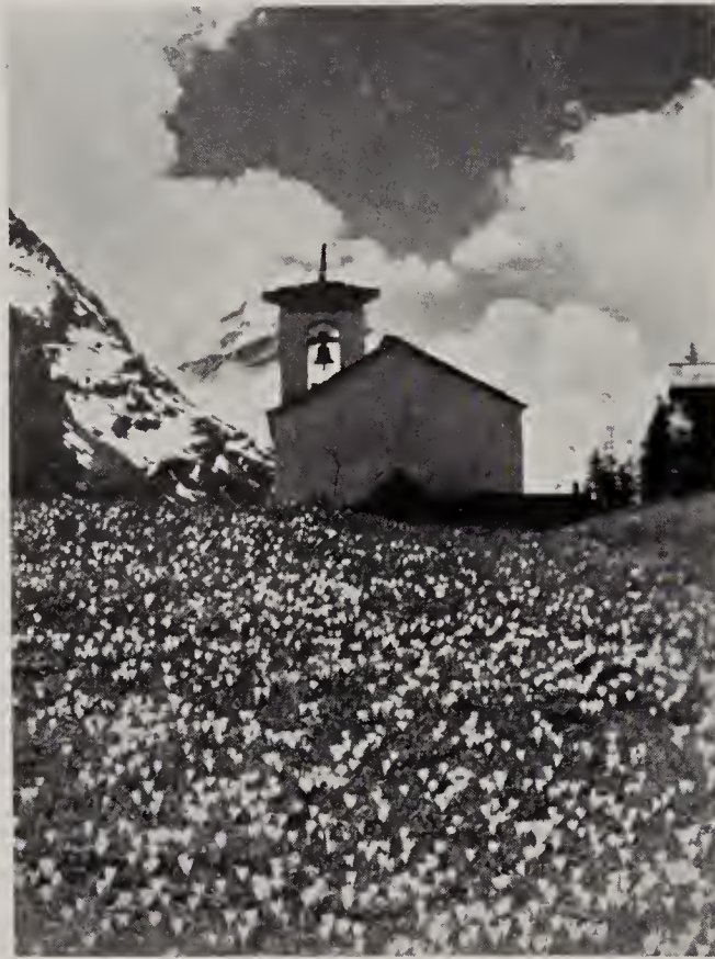
CROCUSES IN THEIR NATIVE HABITAT IN THE SWISS ALPS

PULCHELLUS. Lavender-blue with white anthers and orange-spotted throat; a lovely species found grow-