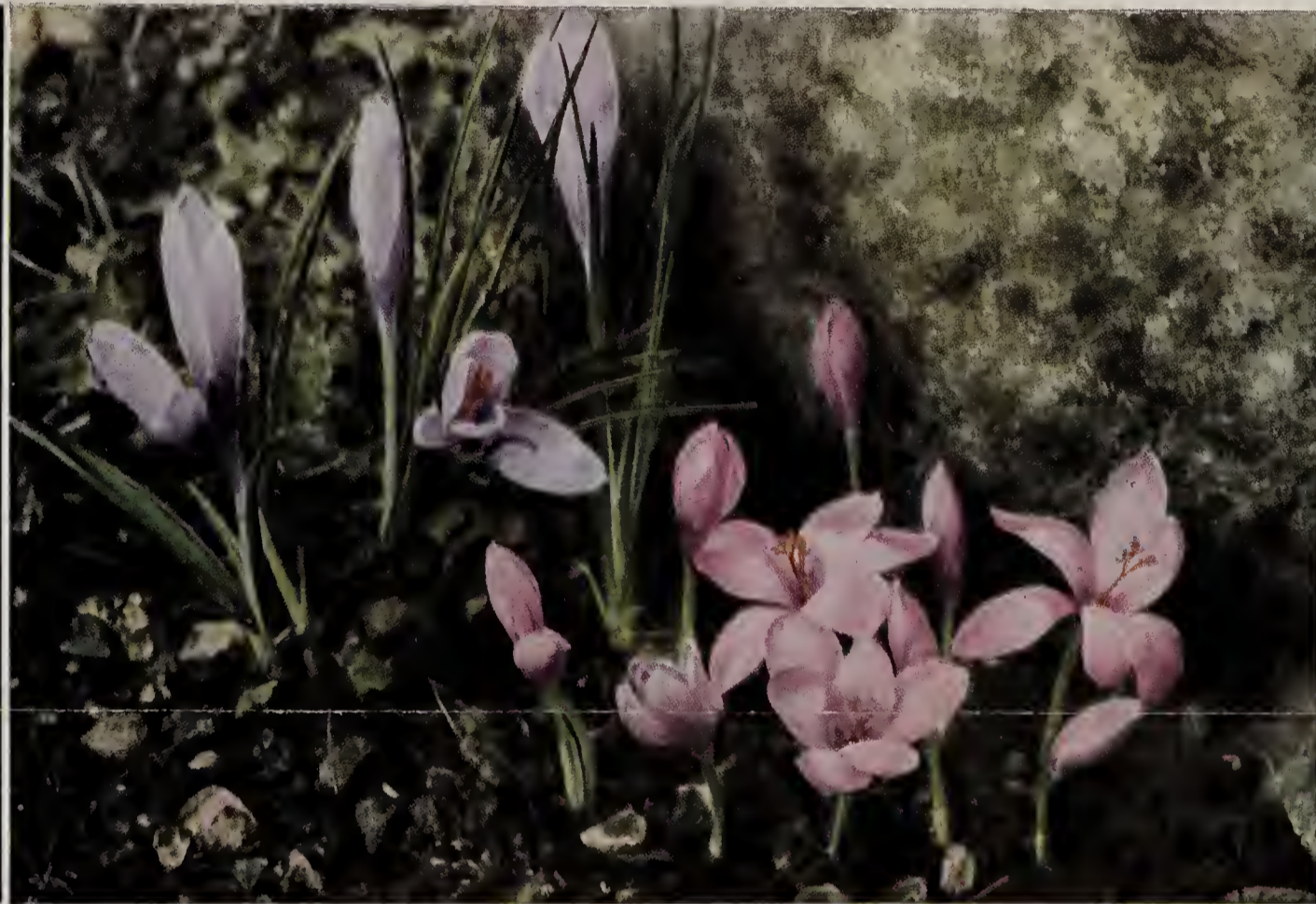
CROCUS SALZMANNI and ZONATUS

PLANT LATE AUGUST-SEPTEMBER FOR SEPTEMBER-OCTOBER FLOWERING