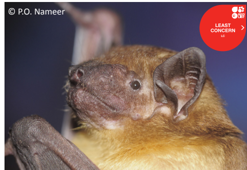
Image 10. Greater Asiatic Yellow House Bat Scotophilus heathii