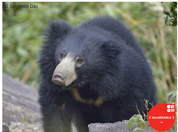
Image 15. Sloth Bear Melursus ursinus