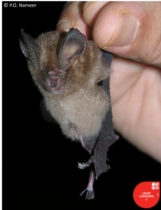
Image 9. Dusky Leaf-nosed Bat Hipposideros ater