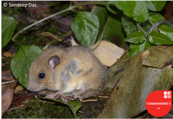
Image 7. Nilgiri Long-tailed Tree Mouse Vandeleuria nilagirica