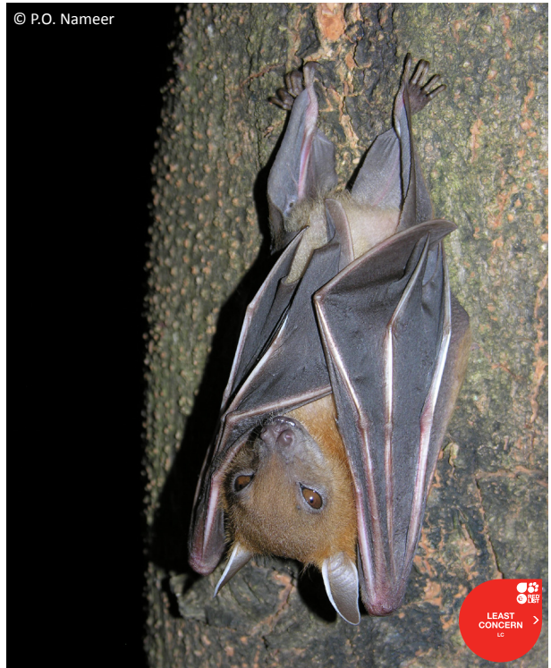
Image 8. Greater-shortnosed Fruit Bat Cynopterus sphinx