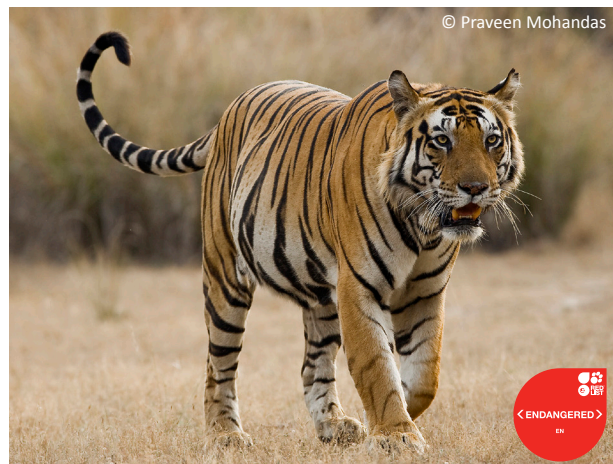
Image 18. Tiger Panthera tigris