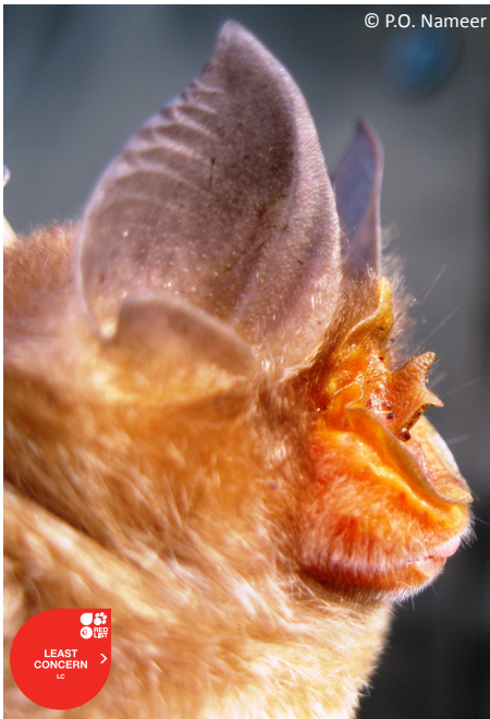
Image 12. Blyth's Horseshoe Bat Rhinolophus lepidus