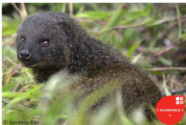
Image 16. Brown Mongoose Herpestes fuscus