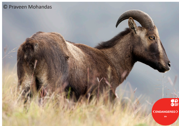
Image 17. Nilgiri Tahr Nilgiritragus hylocrius