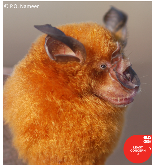
Image 13. Rufous Horseshoe Bat Rhinolophus rouxii