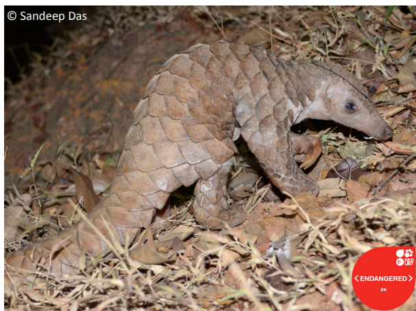
Image 14. Indian Pangolin Manis crassicaudata