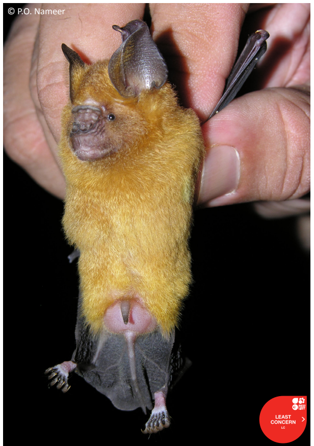
Image 11. Fulvus Leaf-nosed Bat Hipposideros fulvus