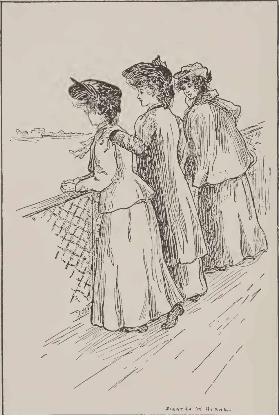
“THREE PRETTY COLLEGE GIRLS LEANLD OVER THE RAILING OF THE UPPER DECK” (See page 1).