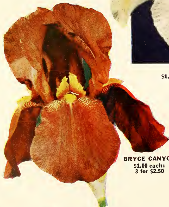
BRYCE CANYON $1.00 each; 3 for $2.50

COLLECTION F55-6 1 each of the FIVE varieties illustrated $3.95