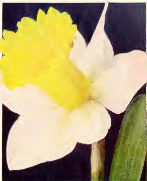
SPRING GLORY 3 for 45c.; $1.65 per doz.; $12.00 per 100

Mrs. R. O. Backhouse. This is the famous "Pink Daffodil." Fine informal perianth of ivory-white, and well-proportioned, long slim trumpet of apricot-pink, changing to shell-pink at the deeply fringed edge. Delicately beautiful but of exceptional substance; long lasting. A must for every garden. (E) 3 for 65c.; $2.40 per doz.; $18.50 per 100.