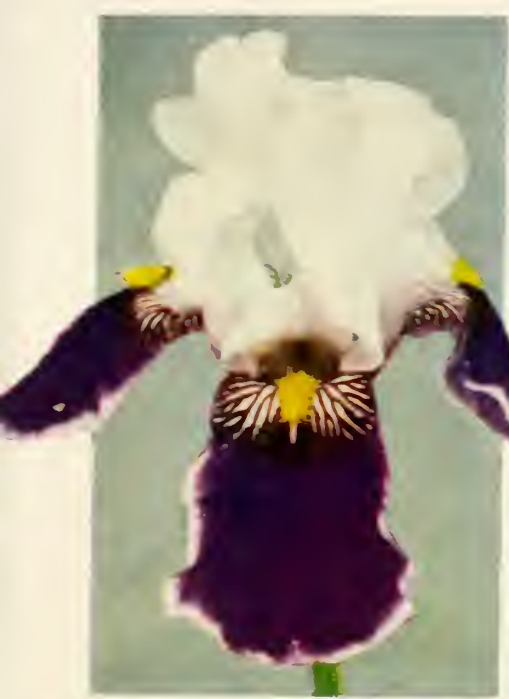
WABASH. 60c. each; 3 for $1.50

We pay postage, east of the Mississippi, on perennial and rose orders amounting to $3.00 or more; west of the Mississippi, please add 10% to the amount of the order.