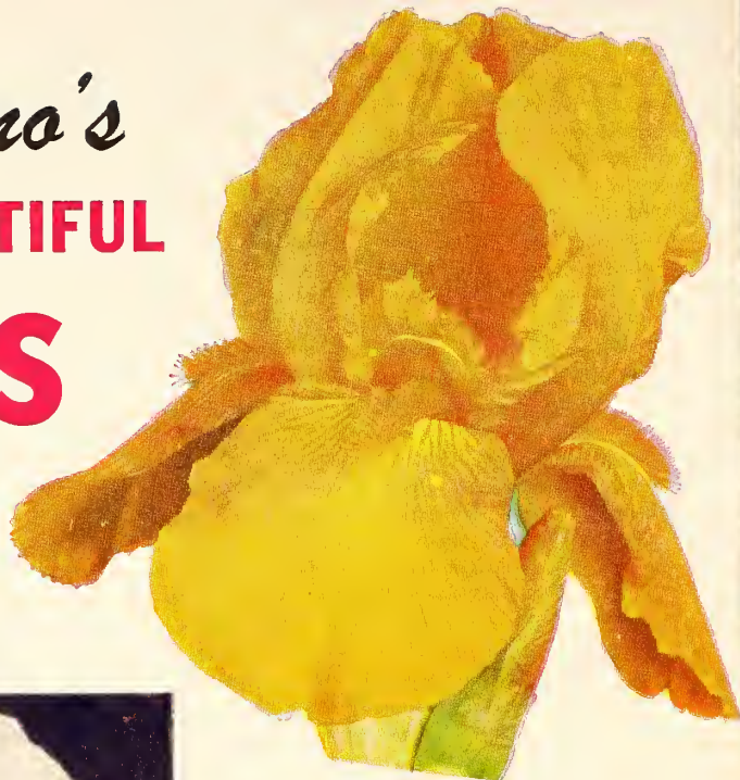
ROCKET $1.00 each; 3 for $2.50

Plant IRIS THIS FALL For Bloom Next Spring