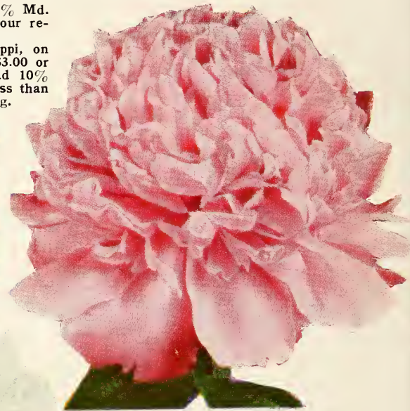
JEANNOT $1.50 each; 3 for $4.00

3 POPULAR PEONIES Festiva Maxima. White. Jeannot. Light lavender-pink. Longfellow. Bright crimson. COLLECTION F55-1 3 roots, 1 of each, for . . $4.00