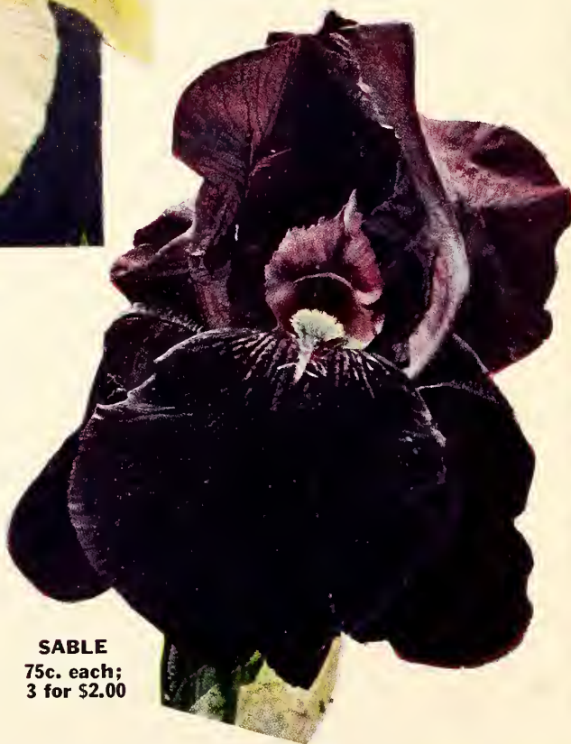
SABLE 75c. each; 3 for $2.00