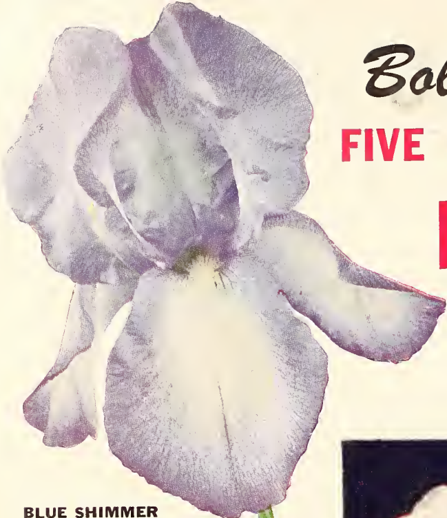
BLUE SHIMMER 75c. each; 3 for $2.00