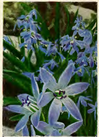
SCILLA SIBIRICA, Spring Beauty