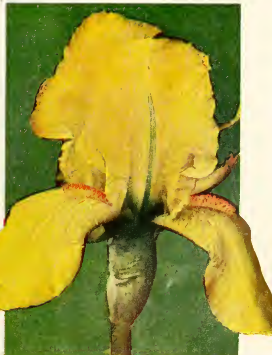
OLA KALA $1.00 each; 3 for $2.50

National Velvet. A hybrid Iris of a rich deep velvety purple color. The falls and standards are uniform in color. The stripe on the falls is rich orange. $1.00 per doz.; $7.00 per 100.