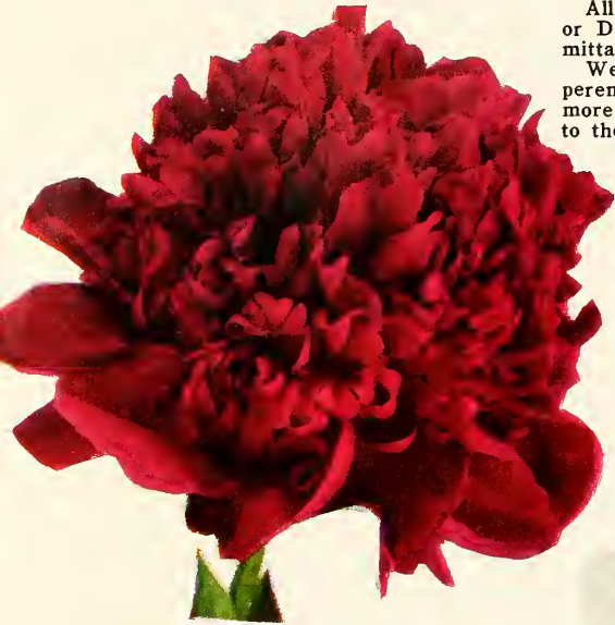
LONGFELLOW $1.75 each; 3 for $4.50

We pay postage, east of the Mississippi, on perennial and rose orders amounting to $3.00 or more; west of the Mississippi, please add 10% to the amount of the order. On orders less than $3.00, add 35c. for postage and packing.