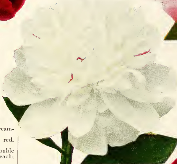
FESTIVA MAXIMA $1.25 each; 3 for $3.25

3 POPULAR PEONIES Festiva Maxima. White. Jeannot. Light lavender-pink. Longfellow. Bright crimson. COLLECTION F55-1 3 roots, 1 of each, for . . $4.00