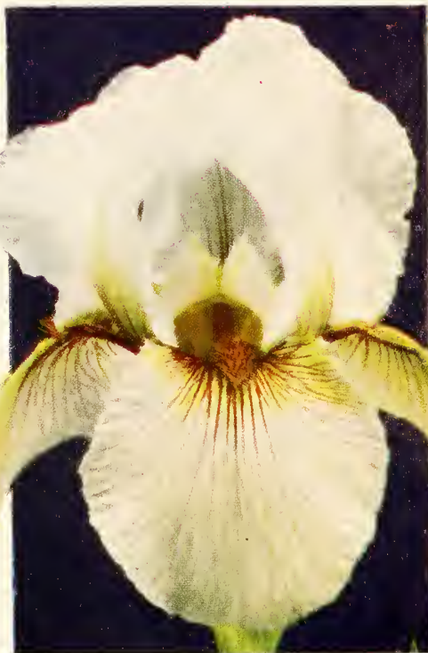
LADY MOHR $1.00 each; 3 for $2.50

Plant IRIS THIS FALL For Bloom Next Spring