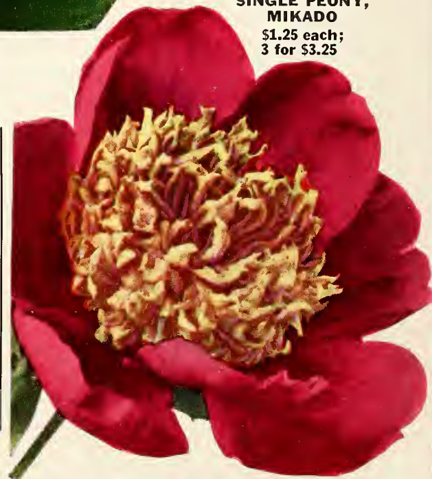
SINGLE PEONY, MIKADO $1.25 each; 3 for $3.25