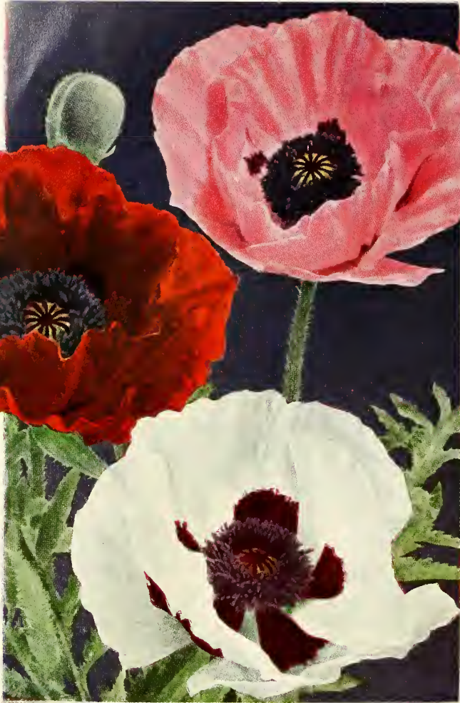
GLOWING EMBERS BARR'S WHITE CURTIS GIANT SALMON-PINK

All Poppies, unless otherwise noted: 3 for $2.00; 6 for $3.50; 12 for $6.50 of any one named variety. Single plants, 75c. each