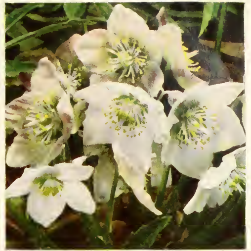
CHRISTMAS ROSE (Helleborus niger) $1.25 each; 3 for $3.25