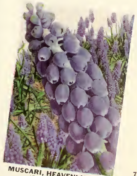
MUSCARI, HEAVENLY BLUE (Grape Hyacinth)