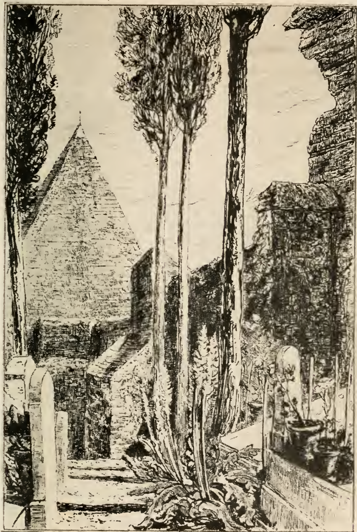
SHELLEY'S GRAVE From an engraving by W. B. Scott