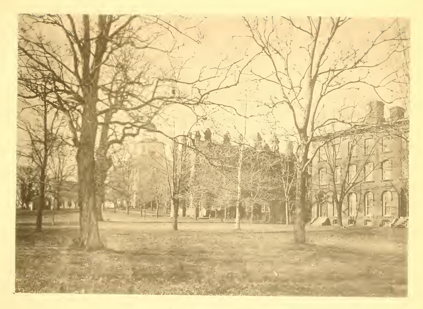
TT. JOHN'S COLLEGE ELILO NGS.