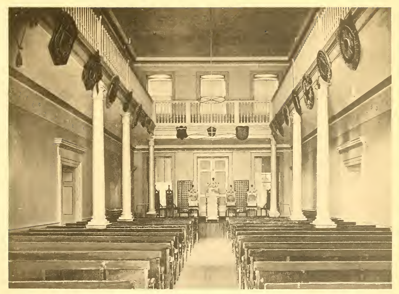
Col - C .p -M Dow. Hall ST JOHN'S COLLEGE.