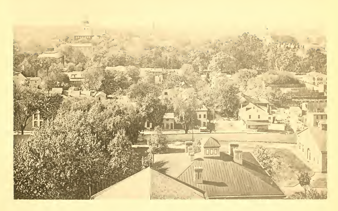
ANNAPOLIS, SEEN FROM NAVAL ACADEMY.