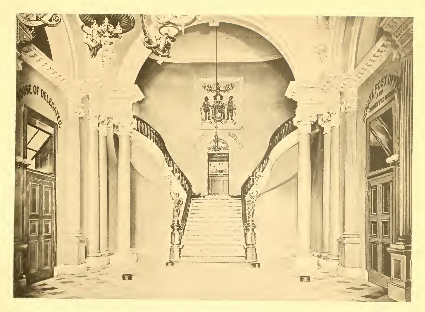
ROTUNDA IN STATE HOUSE.