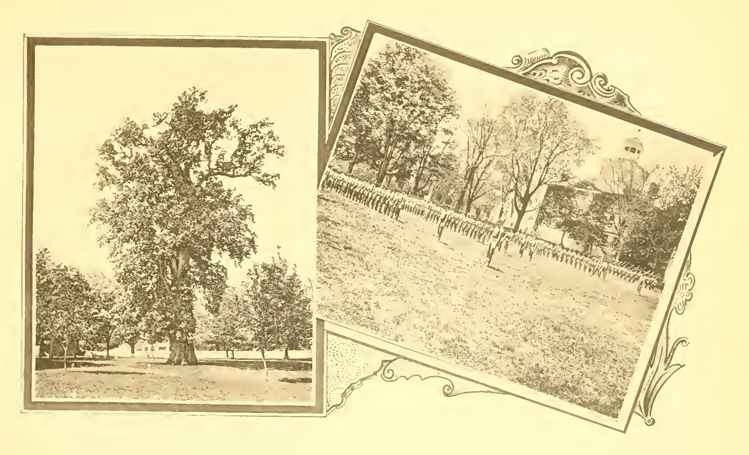
OLD POPLAR TREE COLLEGE GREEN.