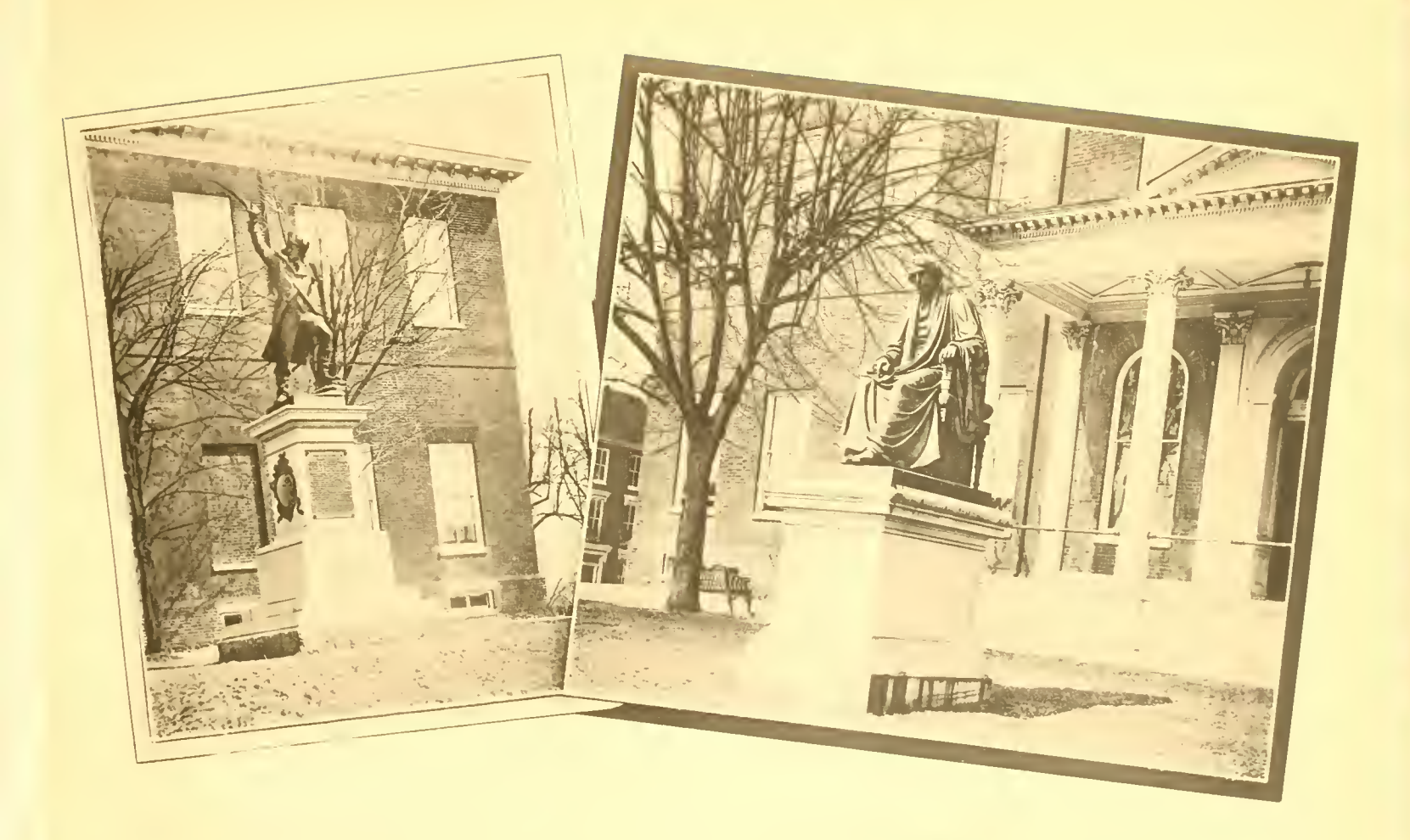
STATUE OF DEKALB