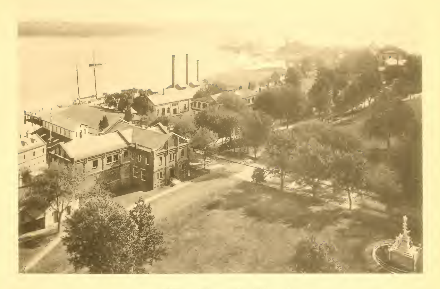
BIND'S EYE VIEW FRO! CADET! JUARTERS