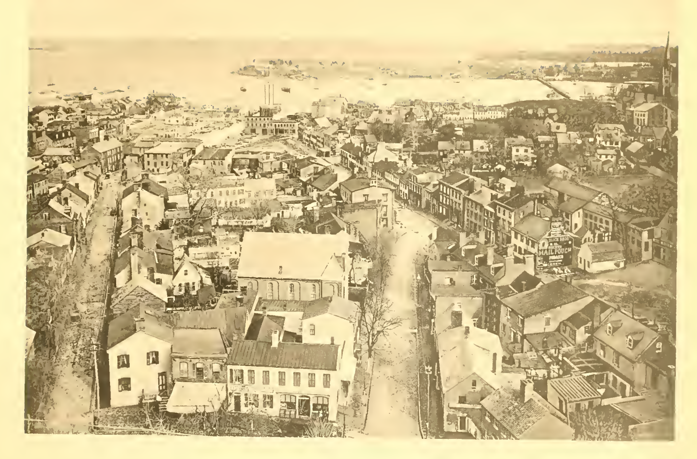
BIRD'S-EYE VIEW OF ANNAPOLIS SHOWING EASTPORT IN THE DISTANCE.