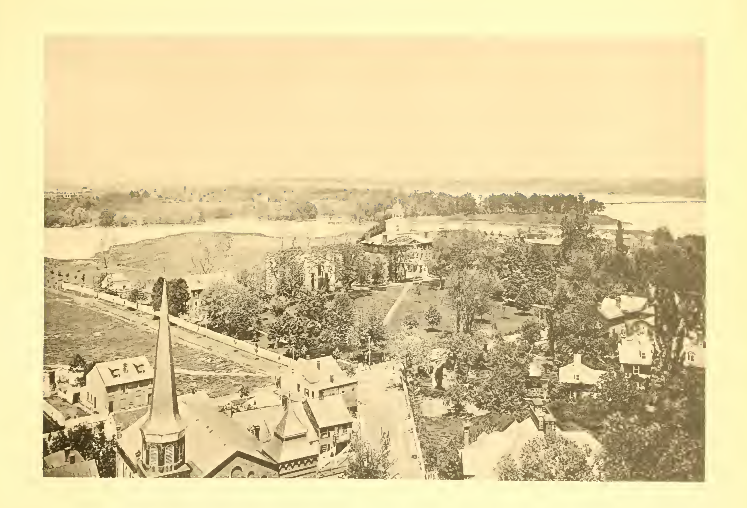
BIRD'S EYE VIEW OF ST JOHN & CHILEGE