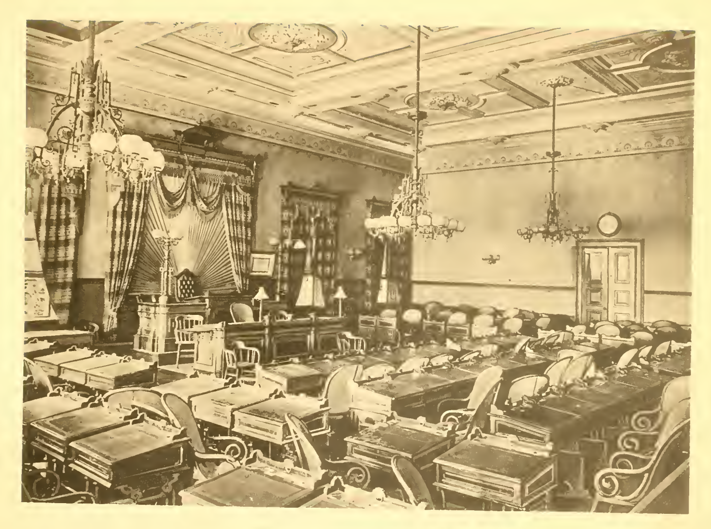
HOUSE OF DELEGATES - TATE HOUSE.