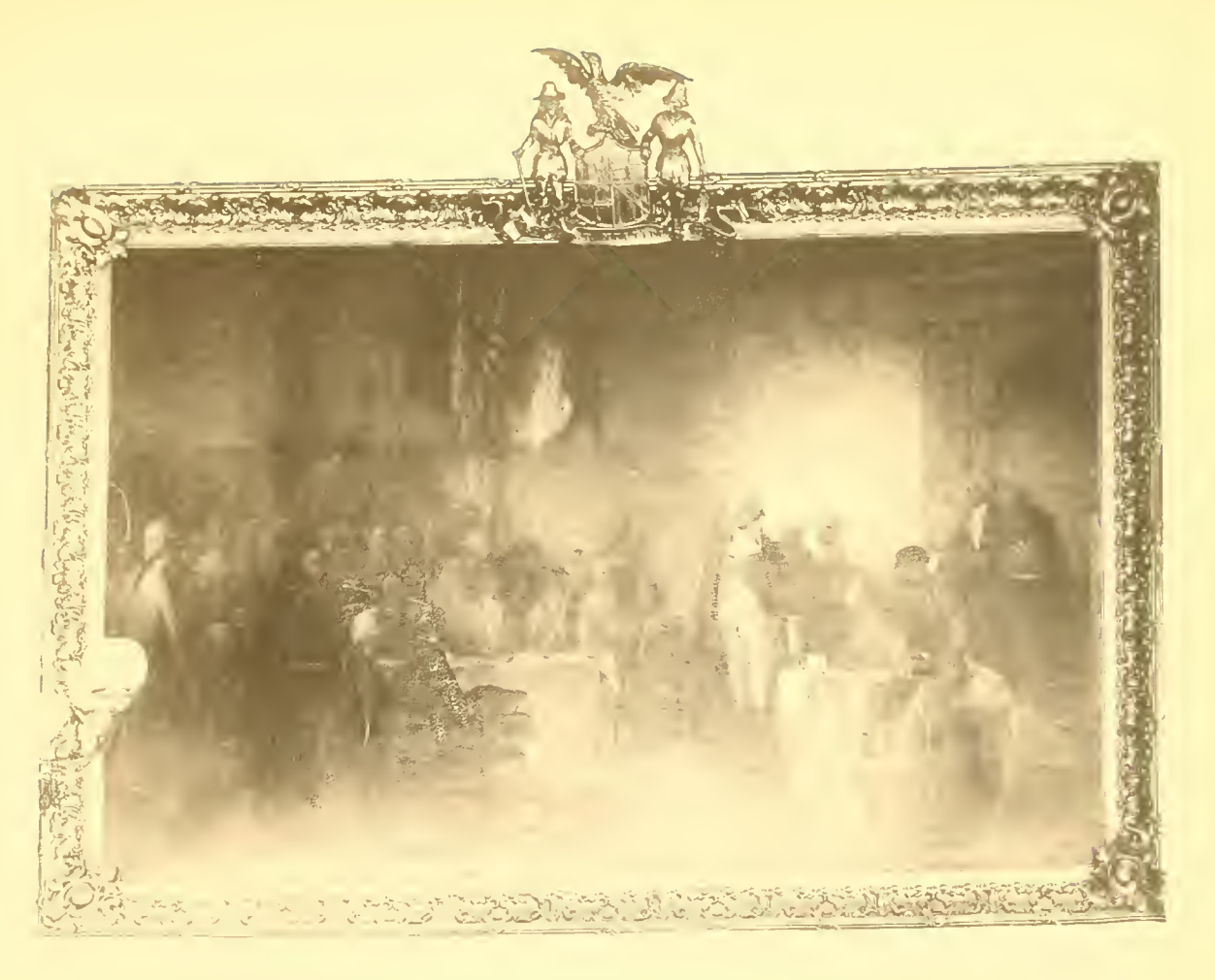
"WASHINGTON SURRENDERS HIS COMMISSION" Painting by Edwin White in the Senate Chamber.