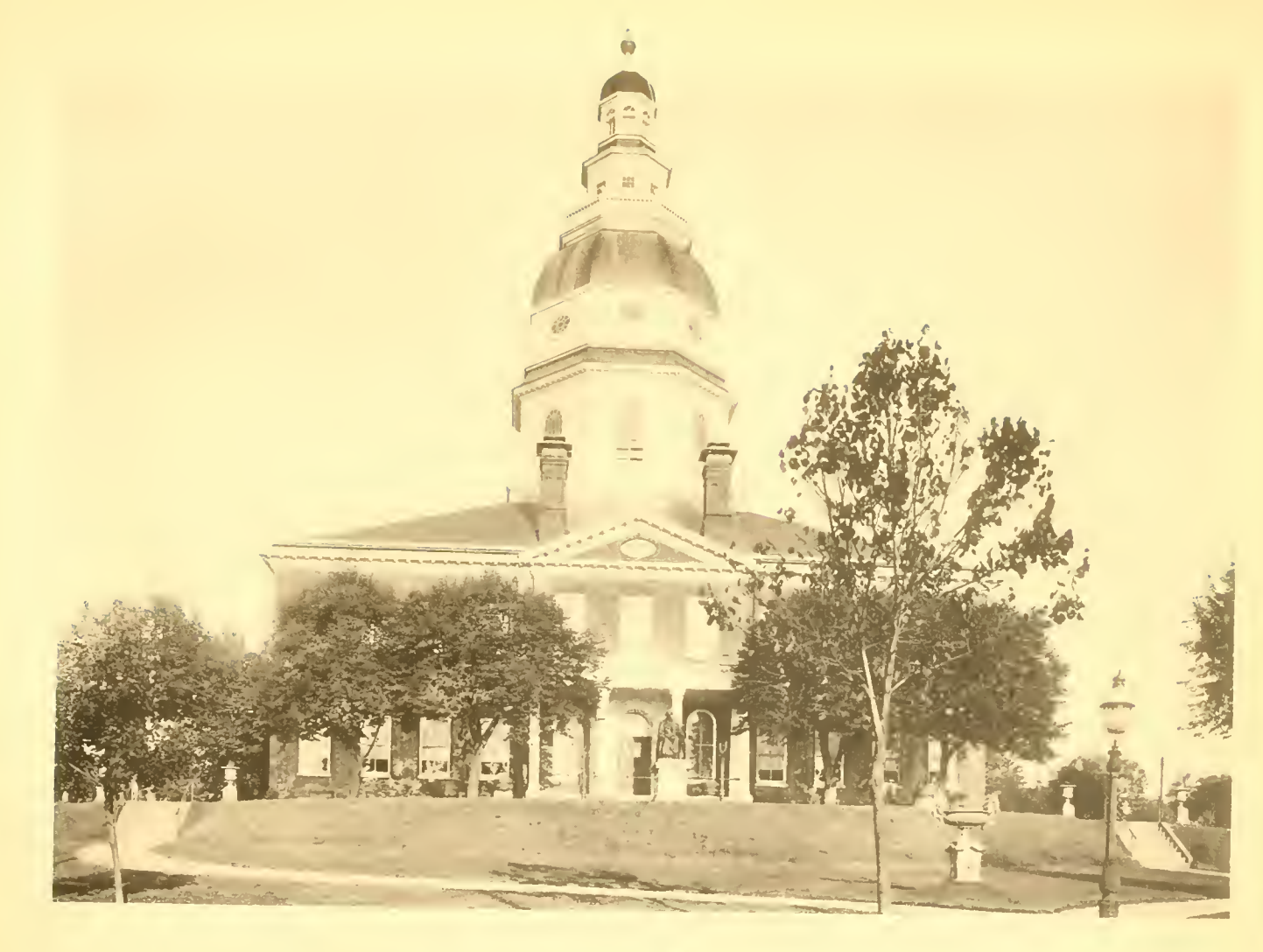
THE STATE HOUSE