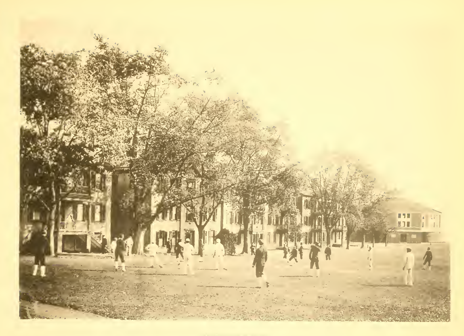
CAUET LELIE' ICH