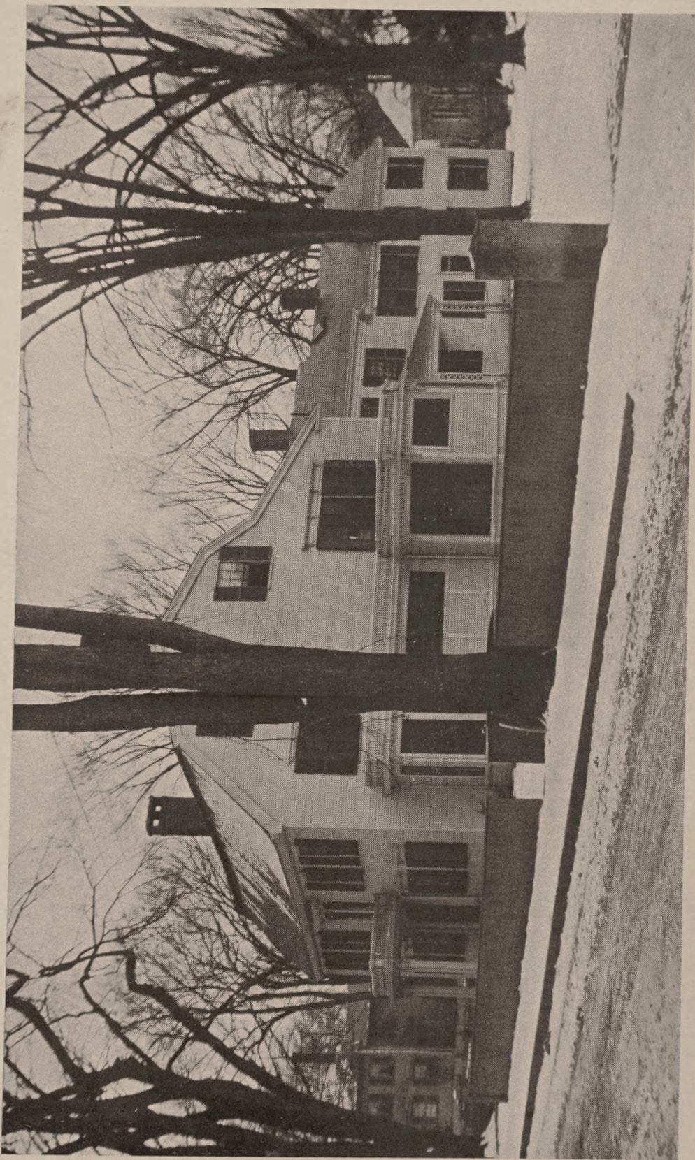
Historic Gilman House Residence of Fatty