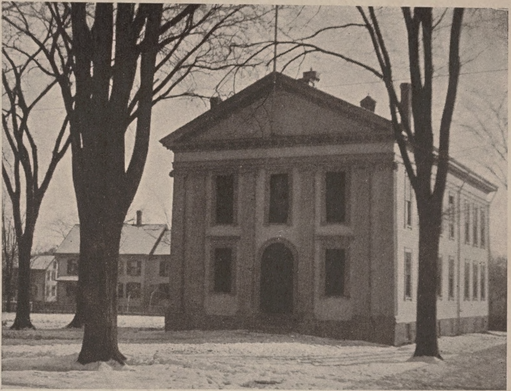
Old High School Building Where "Johny" Gibson taught and fought