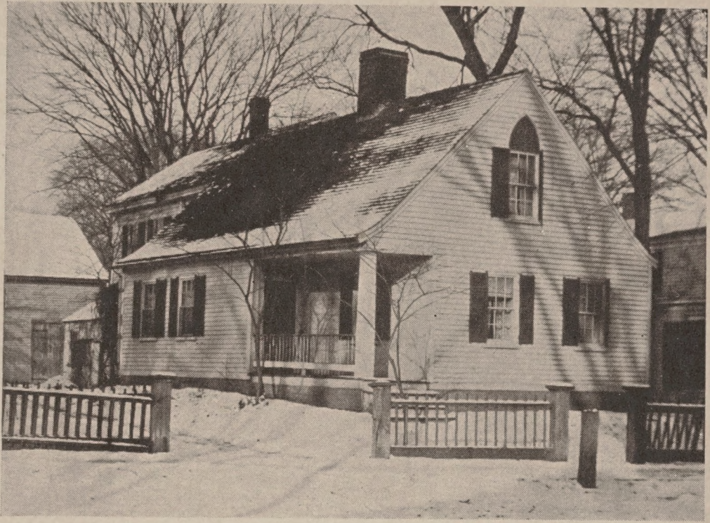
Residence of Beany