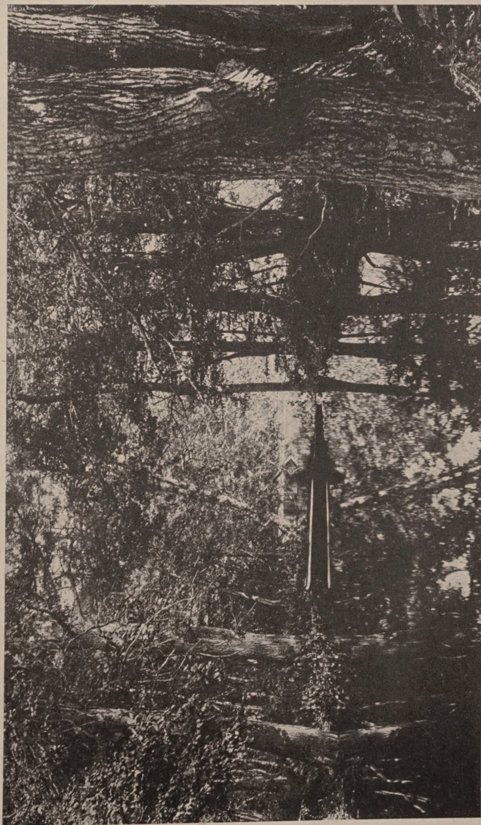
Scene on Squamscott River