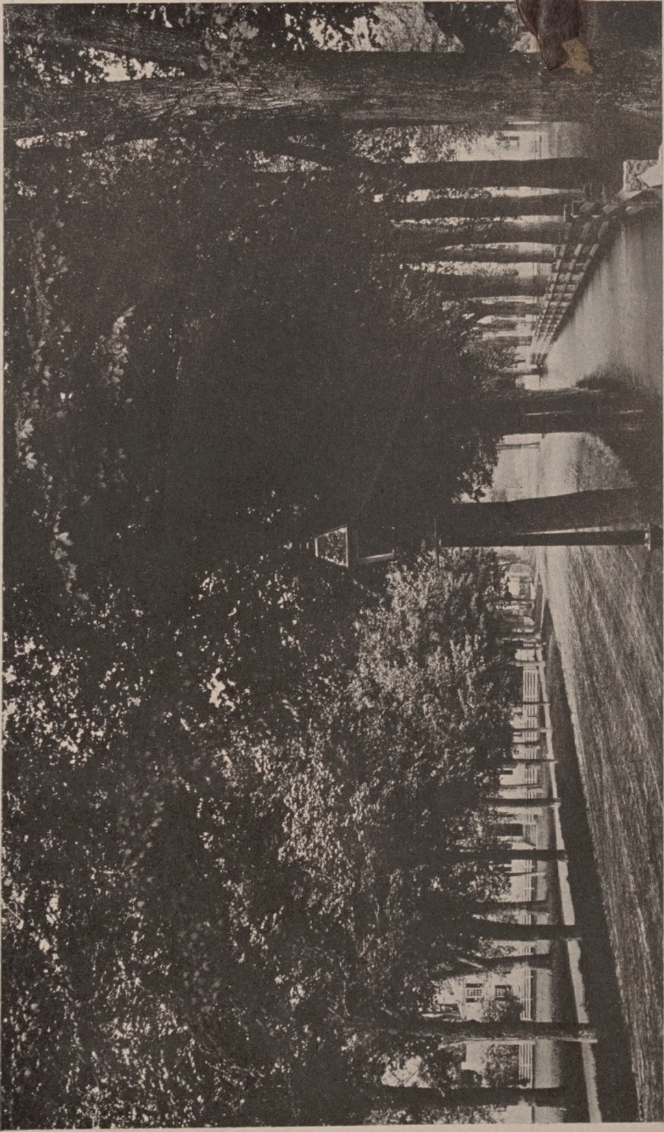
Front Street Phillips Academy on both sides