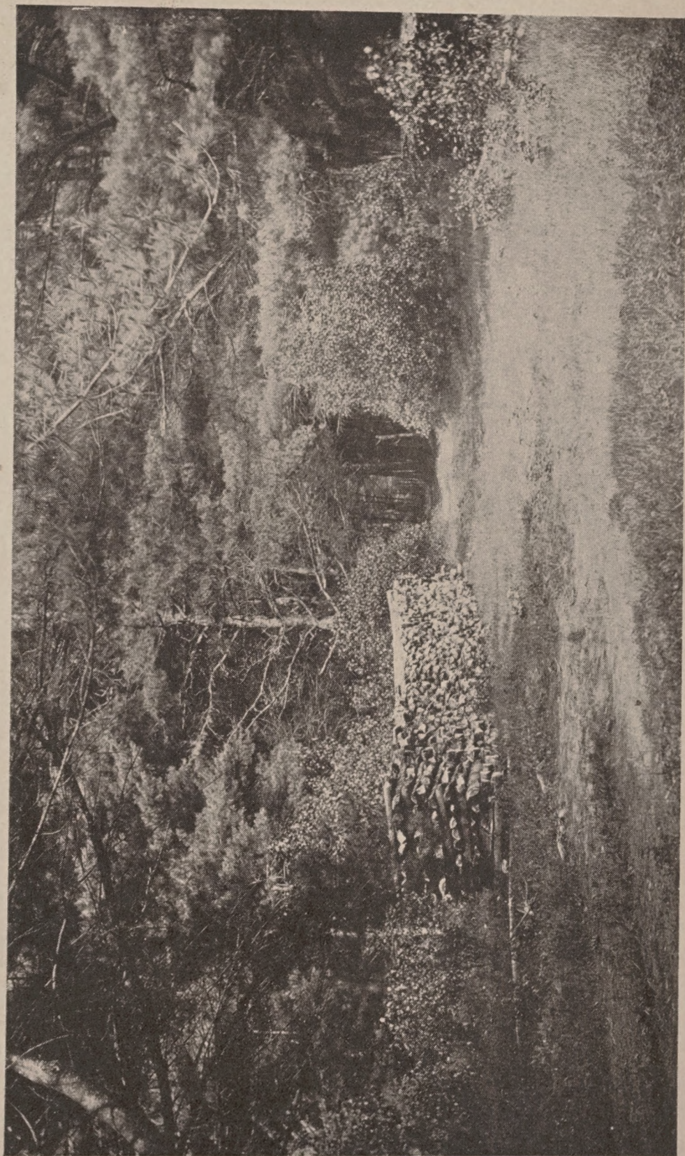
Entrance to Eddy Woods