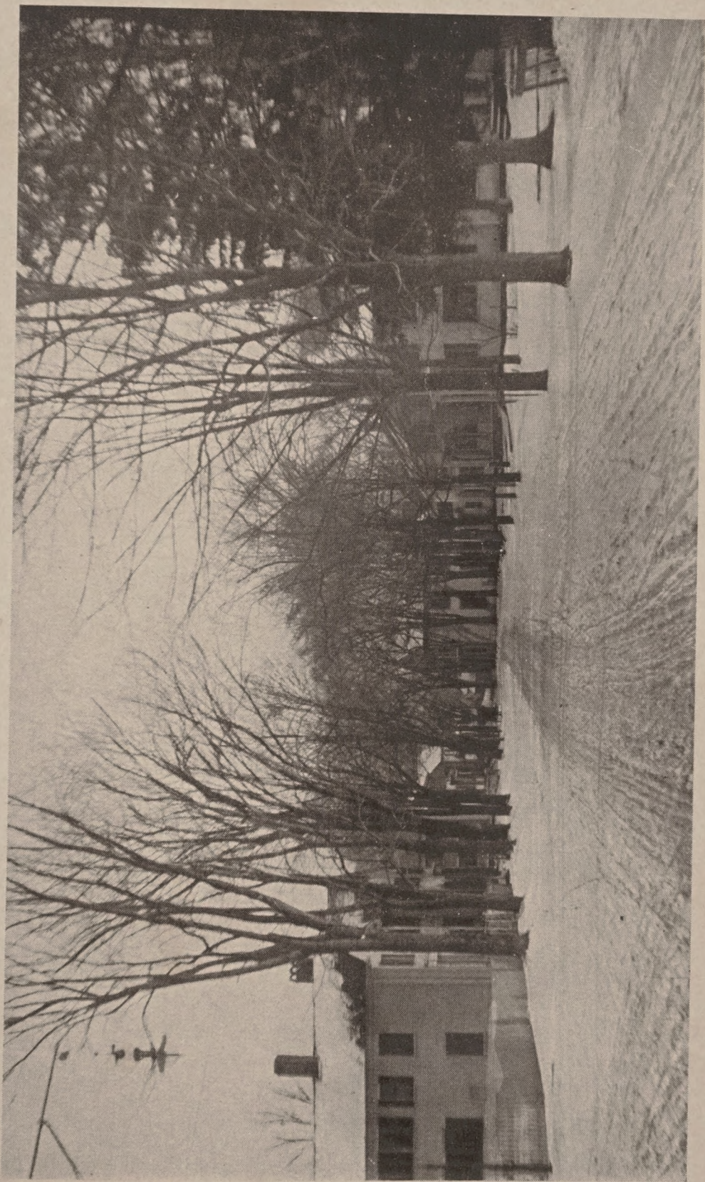
Court Street A favorite stumping-ground