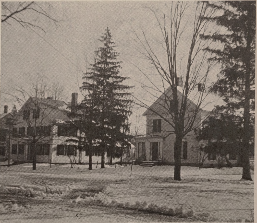
Double House Residence of Pewt and Nipper