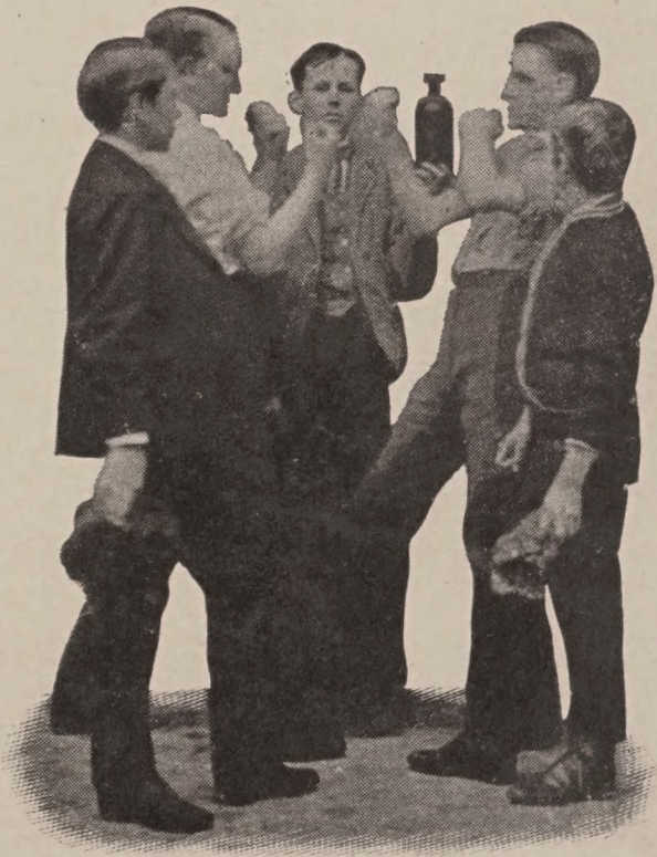
A favorite pastime