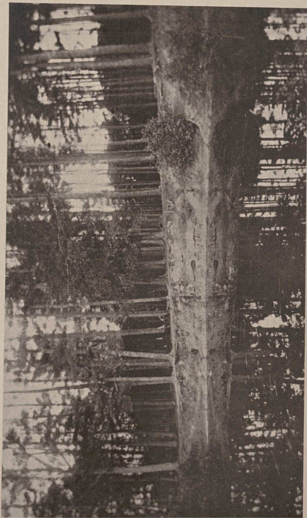
Eddy Woods A picnic party in the middle foreground