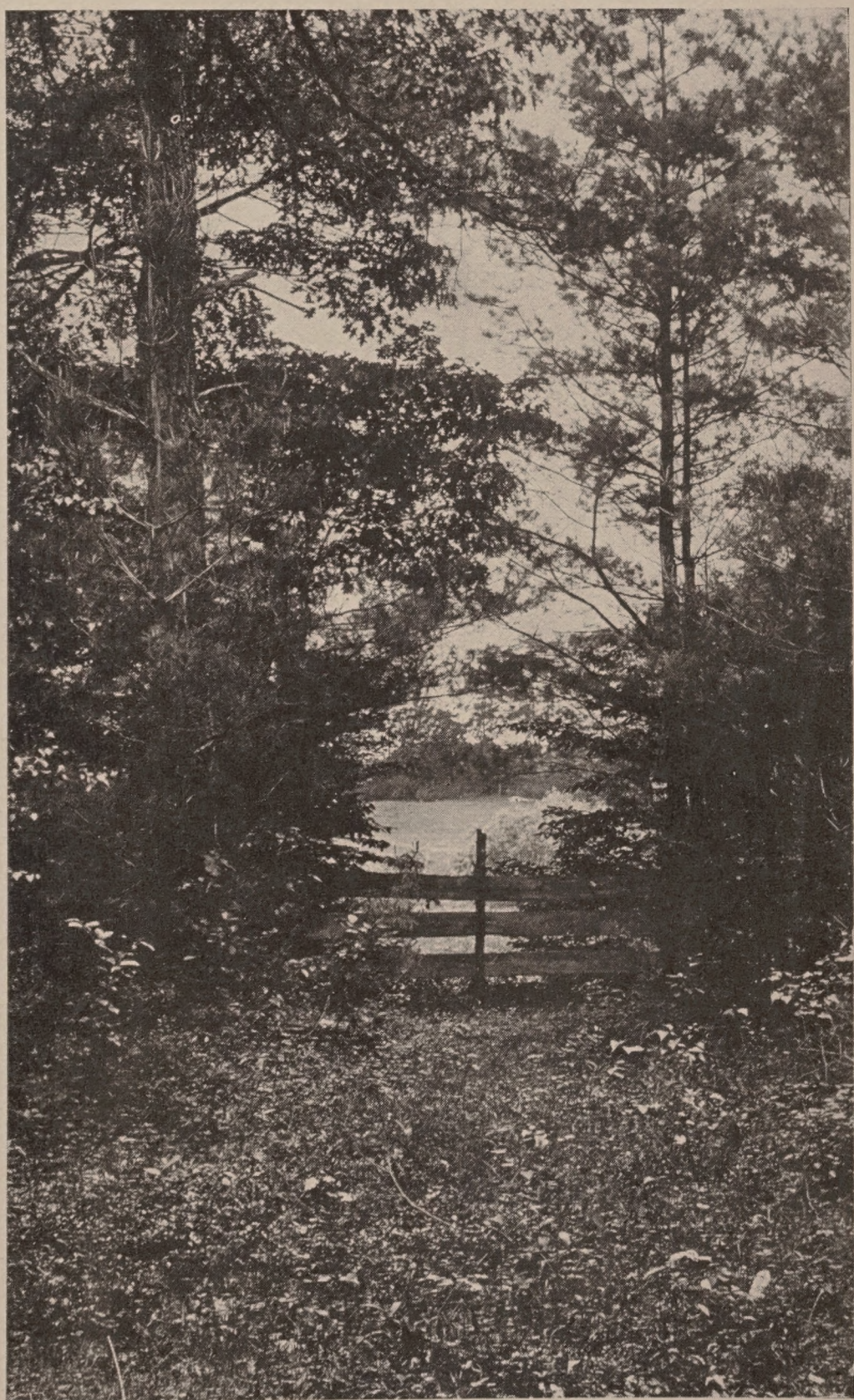
Approach to Squamscott River Through the woods