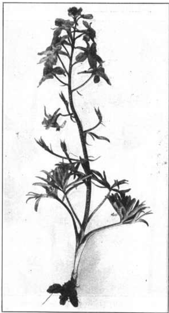
FIG. 5.—Low larkspur ( Delphinium menziesii D. C.).

ing, Colorado, New Mexico, and Utah; and this or a closely allied species is found also in California and Oregon. It is found at altitudes of from 4,000 to 10,000 feet on open hillsides and in parks, sometimes covering large areas. The root is short and tuberous and the plant does not exceed a foot in height. The blossoms, which are