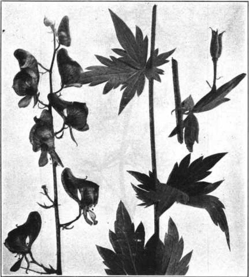
FIG. 4.—Aconite ( Aconitum columbianum Nutt.).

found in the mountain regions. It has a flower easily distinguished by its form from that of the larkspur, as will be seen by comparing figures 2, 4, and 5. The color of the aconite flower is commonly deep blue, but it varies through shades of violet, blue, and purple, and in some varieties is greenish white. The leaves resemble those of the larkspur, although they are more closely attached to the stem. The stem of the tall larkspur is hollow, while that of the aconite is