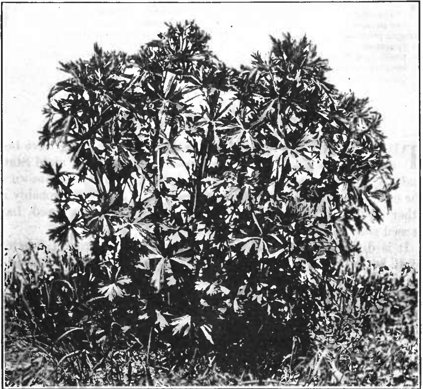
FIG. 1.—Tall larkspur ( Delphinium barbeyi Huth) before blossoming. This is the most dangerous stage of the plant.

In the regions where the plants are abundant they are commonly known as “poison,” “poison weed,” or “cow poison.” In New Mexico the tall larkspurs are known as “peco.”