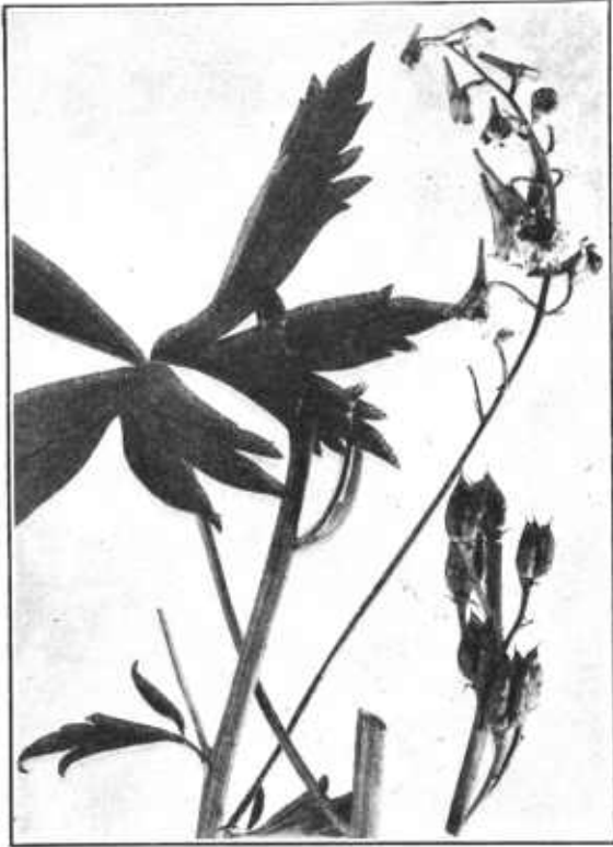
FIG. 2.—Tall larkspur ( Delphinium cucullatum ).

to 2 feet high in May, forming bunches much more prominent than the grass and doubtless attractive to grazing animals. Figure 1 shows the plant as it appears in May before blossoming. It blossoms in July, and the seeds are formed in August, when it commences to dry up, but does not entirely disappear until broken down by the winter snows. This species is found in the mountains of Wyoming, Montana, and Utah, as well as in those of Colorado.