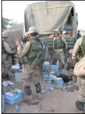
C/3-504 paratroopers quickly conduct hasty water resupply in Sangin, Afghanistan. Operation Resolute Strike, 8 April 2003