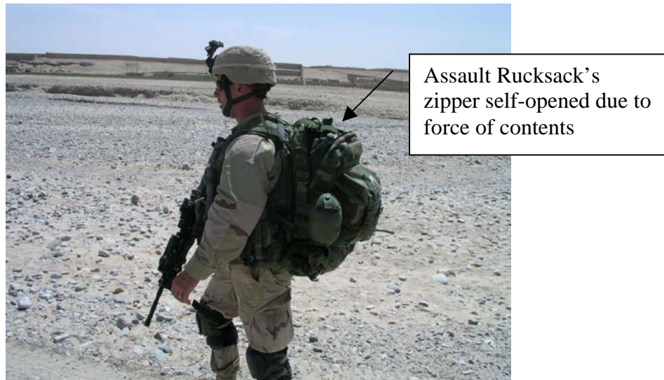
Figure B.2 Soldier's Assault Rucksack Zipper Has Self-Opened

(1) Assault Rucksack volume is too small. The MOLLE Assault Rucksack, even with two accessory pouches is far too small and awkward in design for adequately carrying the Infantryman's Approach March Load. The zippered top to the Assault Rucksack is extremely cumbersome to close when the pack is filled and the zipper tends to self-open when the pack is very full. Soldiers and units much prefer commercial assault rucksacks and the London Bridge rucksack was used by all troopers in 2-504 Parachute Infantry.