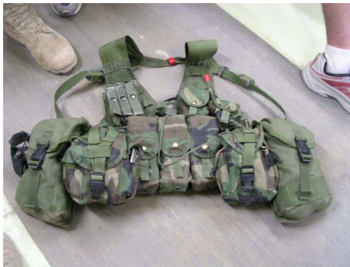
Figure B.1 MOLLE FLC modified as rack system

a. Fighting Load Carrier (FLC). Soldiers in general appreciate the FLC and its versatility. The FLC enables the individual Soldier to tailor his own load bearing equipment so that he has the appropriate MOLLE cargo pouches in areas that are most easily accessible to him. Many Soldiers prefer to wear the FLC's belt backwards so that they can use the reversed FLC belt as a rack system in their front for MOLLE magazine pouches. 2-504 PIR incorporated the backwards FLC belt as a battalion standard operating procedure (SOP). When the FLC is worn in this manner, however, the extraction handle on the FLC is pulled forward due to the weight on the front of the FLC and this nylon handle digs into the back of a Soldier's neck and creates considerable discomfort.