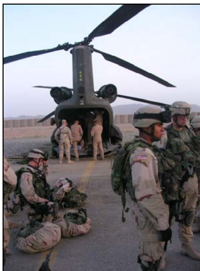
Paratroopers of C/3-504 prepare to load CH-47 Helicopters. Operation Resolute Strike, 8 April 2003