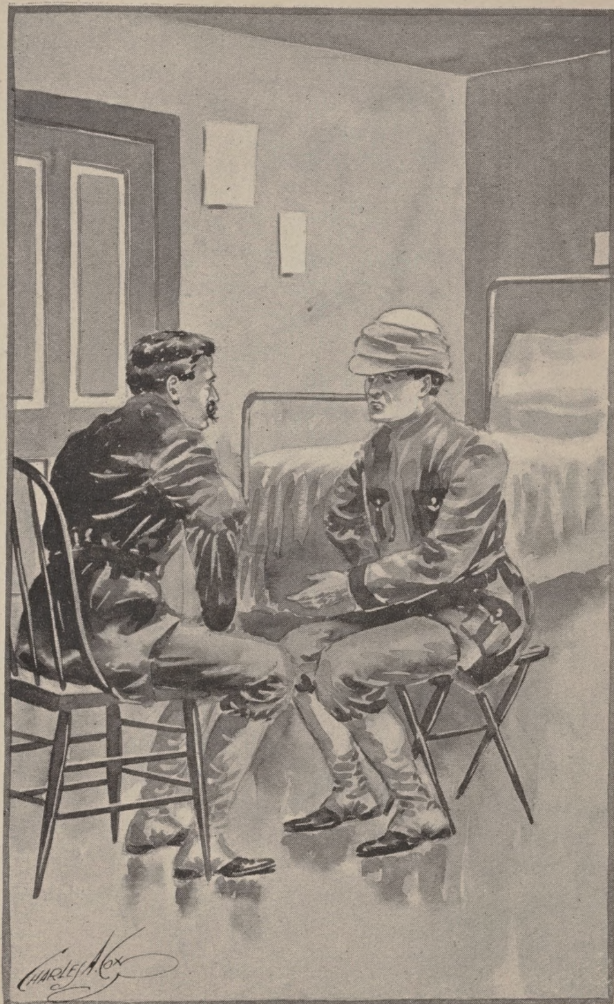
“Yale and Martyn conferred for two hours.”—Page 243. Plain Tales from the Hills.