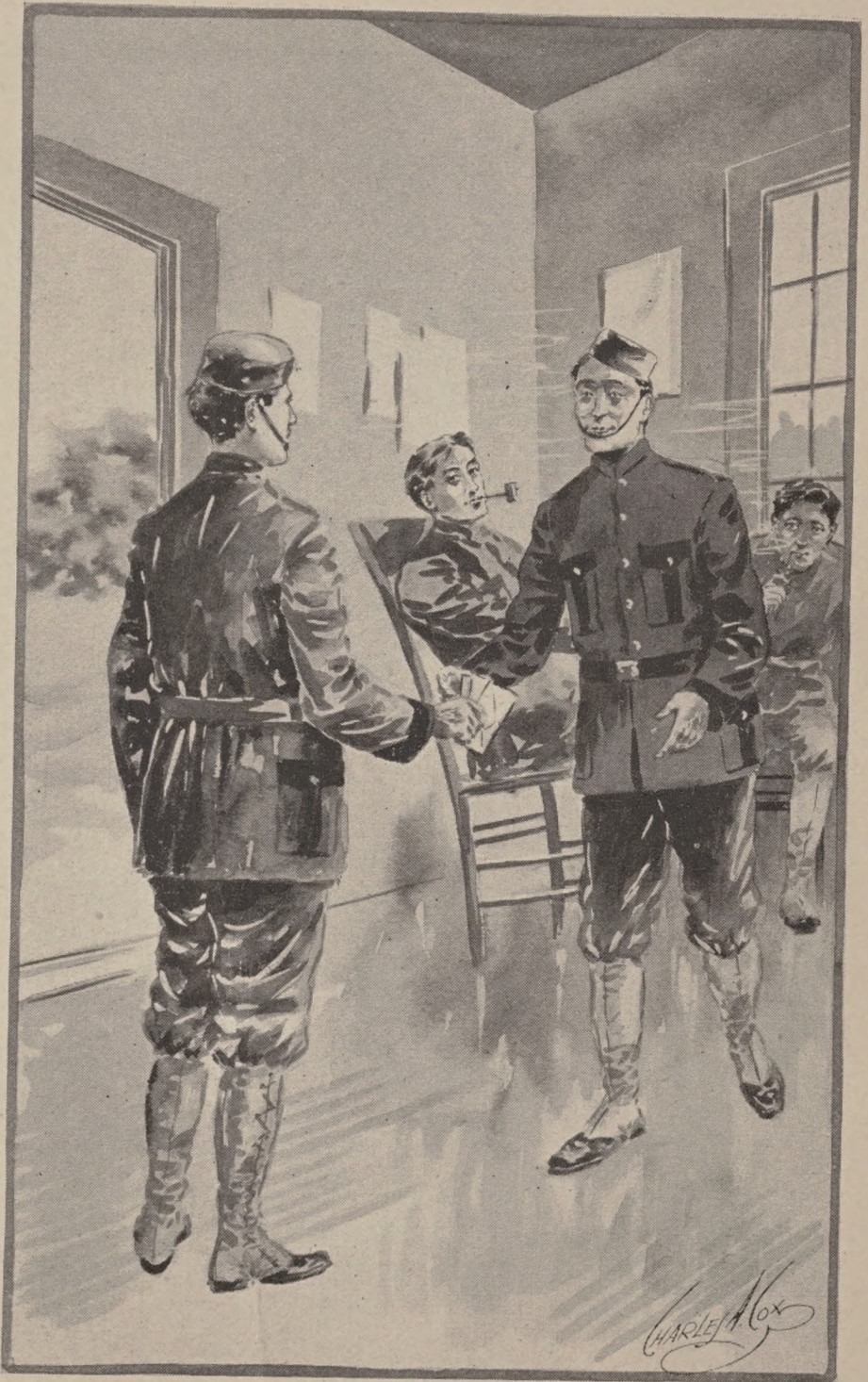
“Come three envelicks, one for each of us.”—Page 82. Plain Tales from the Hills.