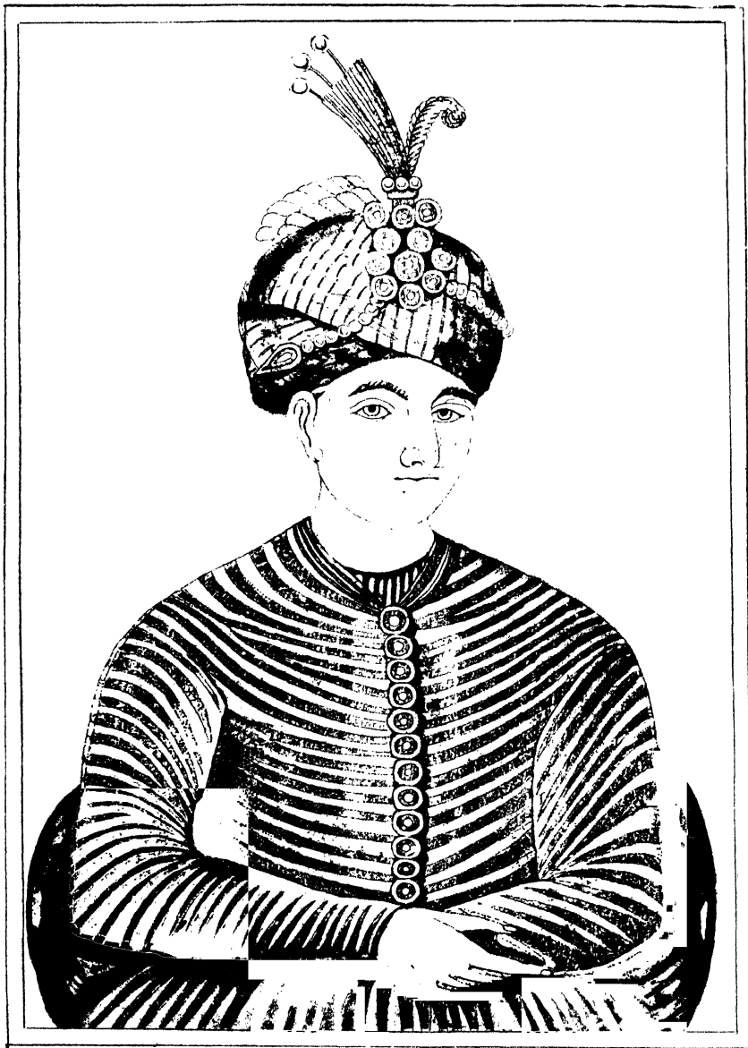
BUYD ER SHAM