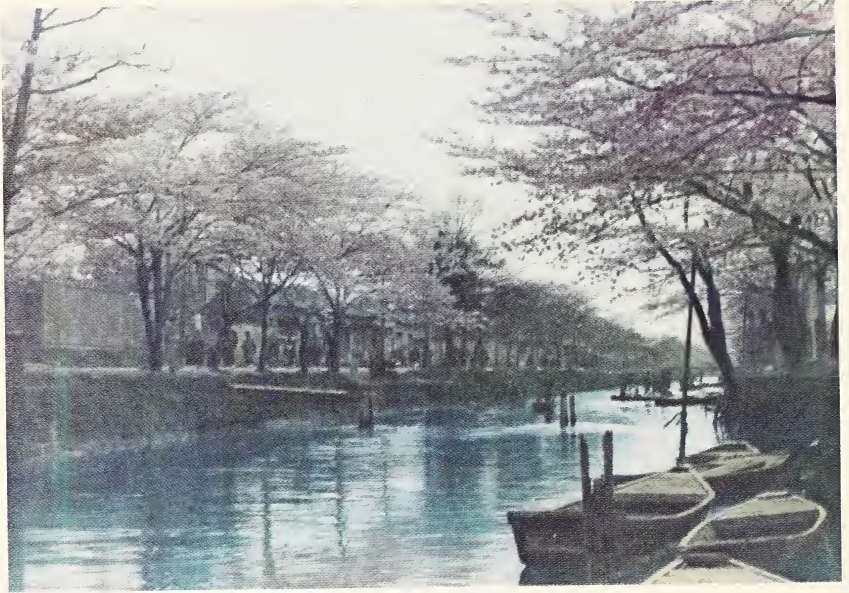
Cherry trees lining waterway in Japan in 1902. Photograph shown to Mrs. Taft by Spencer Cosby.