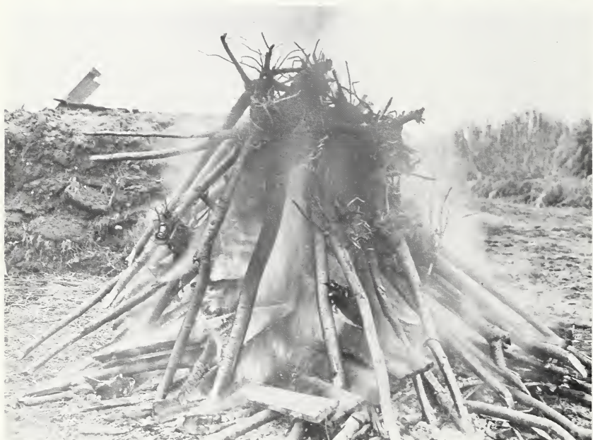
Figure 13.—First shipment of Japanese cherry trees being prepared for burning ( top ) and being burned ( bottom ).