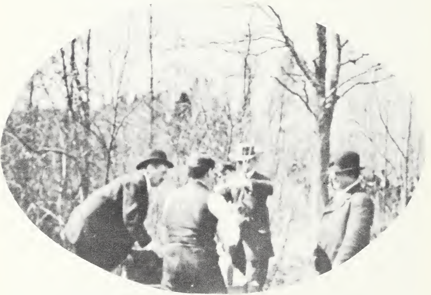
Figure 5.—Schoolboys on Arbor Day at "In the Woods": Top , Entering the grounds; bottom , receiving instructions in planting and caring for the cherry trees.