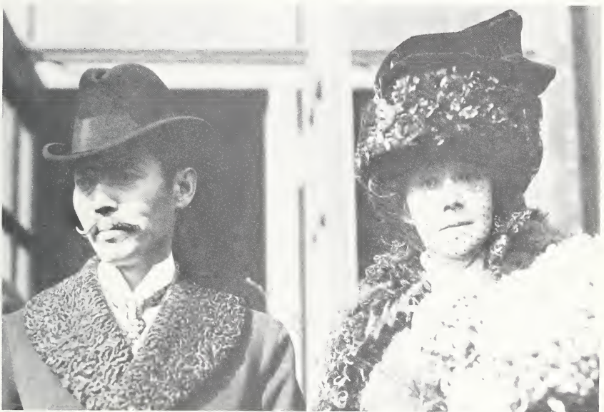
Figure 14.—Mayor and Mrs. Yukio Ozaki of Tokyo, Japan, taken in 1910 around the time of the destruction of the first shipment of Japanese cherry trees.

By mid-March, arrangements were completed for transporting the new shipment of cherry trees across the country after their arrival in Seattle (47). The 3,000 cherry trees arrived safely in Washington, D.C., on March 26 and were delivered to the Propagation Gardens. The Department's scientists immediately prepared to inspect the trees (48). While the inspection process was still in progress, Secretary Wilson informed Col. Cosby that,