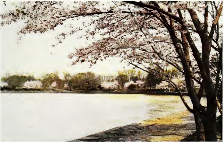
Figure 20.—Selected groups of cherry trees on the Tidal Basin: A , In 1921 and B and C , 1925.