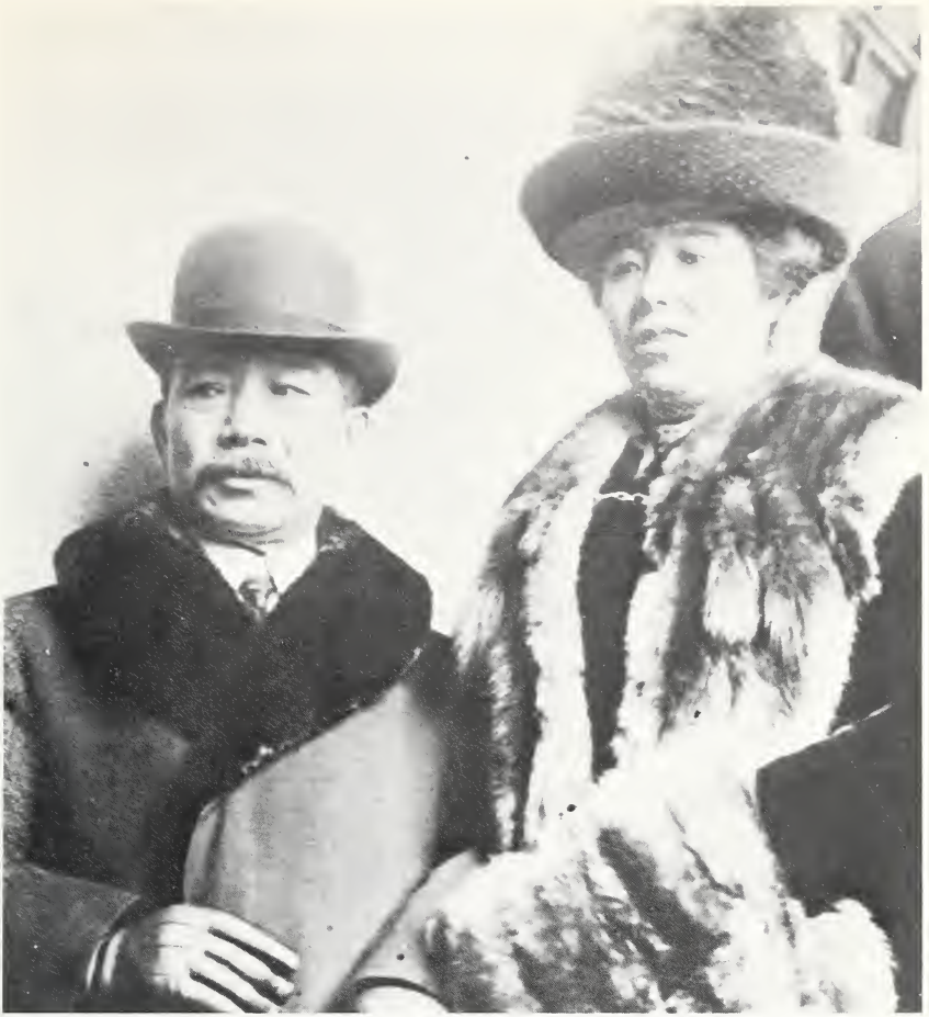
Figure 16.—Count Sutemi Chinda and wife, Viscountess Iwa Chinda.

The successful planting of the second shipment of Japanese flowering cherry trees in the Nation's Capital marked the beginning of a living symbol of friendship between the peoples of Japan and the United States. Four years later, 99 percent of the trees planted around the Tidal Basin were well established, 8 to 12 feet tall, and blooming each spring (56).