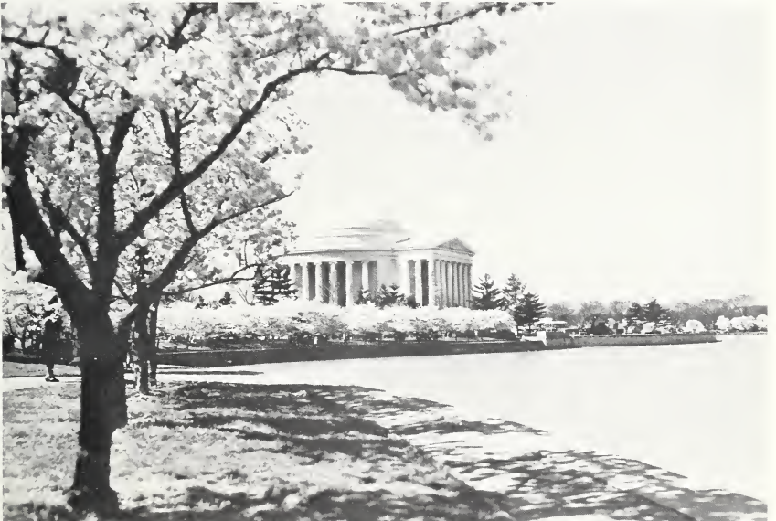
Figure 22.—The Jefferson Memorial at cherry blossom time around the mid-1940's.