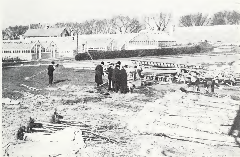
Figure 12.—Department of Agriculture scientists inspecting first shipment of Japanese cherry trees, January 7, 1910.