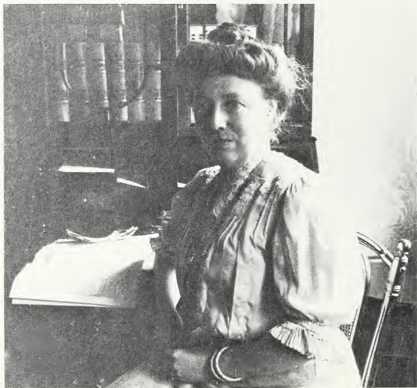
Figure 15.—First Lady, Mrs. William H. Taft, in 1908.

A few days later, on April 4, Col. Cosby wrote Yukio Ozaki, Mayor of Tokyo, that the second shipment had received a “minute and careful examination” (51) by Department scientists and that “[e]very tree was passed by the experts” (52). Most of the trees were planted as planned around the Tidal Basin and along the Riverside Drive in East and West Potomac Park (53). The rest reportedly were planted on the White House grounds, in Rock Creek Park, and in a small nursery area located near the corner of 17th and B Streets (54). In particular, 18 of the greenish-yellow flowered Prunus serrulata Lindl. cv. Gyoiko were planted on the White House grounds (55).