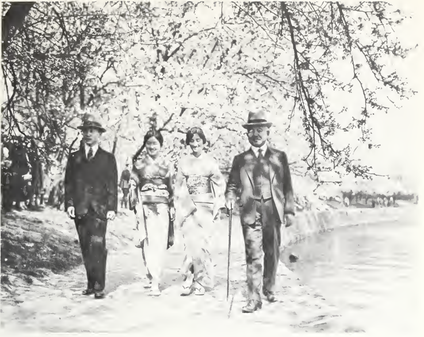
Figure 21.—Japanese visitors on the Tidal Basin among the cherry trees in 1938.