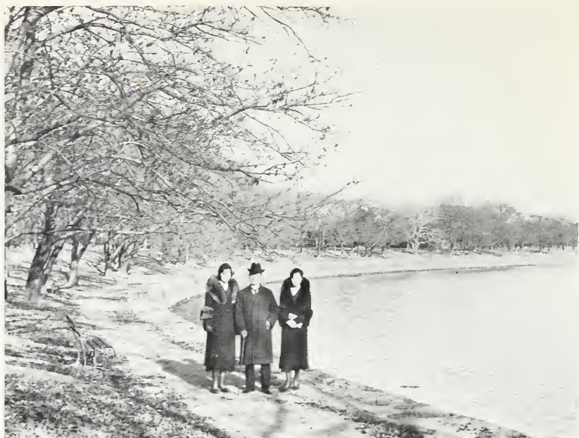
Figure 19.—Mayor Ozaki and daughters among the cherry trees in Potomac Park, 1923.

As time passed, each spring brought forth the rebirth of the beautiful cherry blossoms along the Tidal Basin and in East Potomac Park (figs. 21 and 22). This annual event became a newsworthy occurrence of international significance, a reaffirmation of the bonds of friendship between Japan and the United States. In 1949, the Cherry Blossom Festival included the selection of princesses from all 48 States and the Territories, with a final choice of a festival queen.