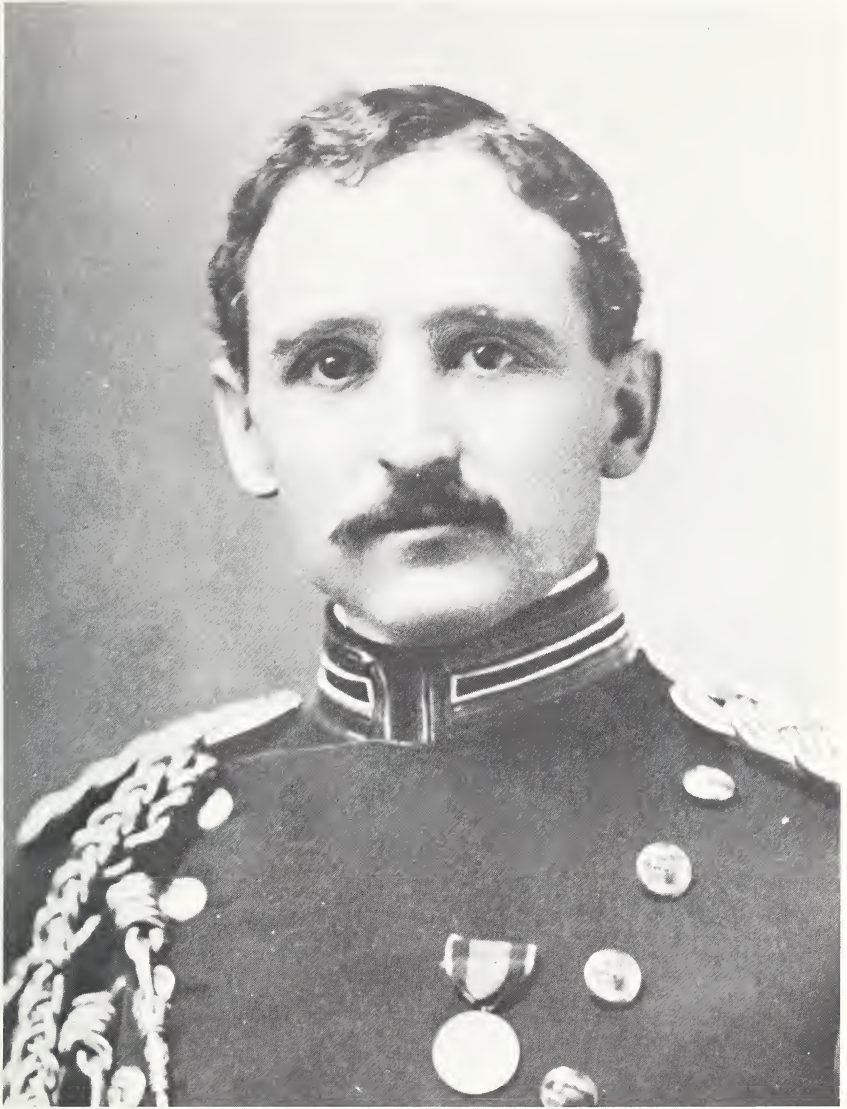
Figure 18.—Colonel Spencer Cosby, Superintendent of Public Buildings and Grounds for the Washington, D.C., area.

The first commemoration of the original planting of Japanese cherry trees in 1912 occurred in 1927 when Washington school children re-enacted the event. A second commemoration took place in 1934 when the District of Columbia's Board of Commissioners sponsored a 3-day celebration. In 1935, a "Cherry Blossom Festival" was jointly sponsored by many civic groups.