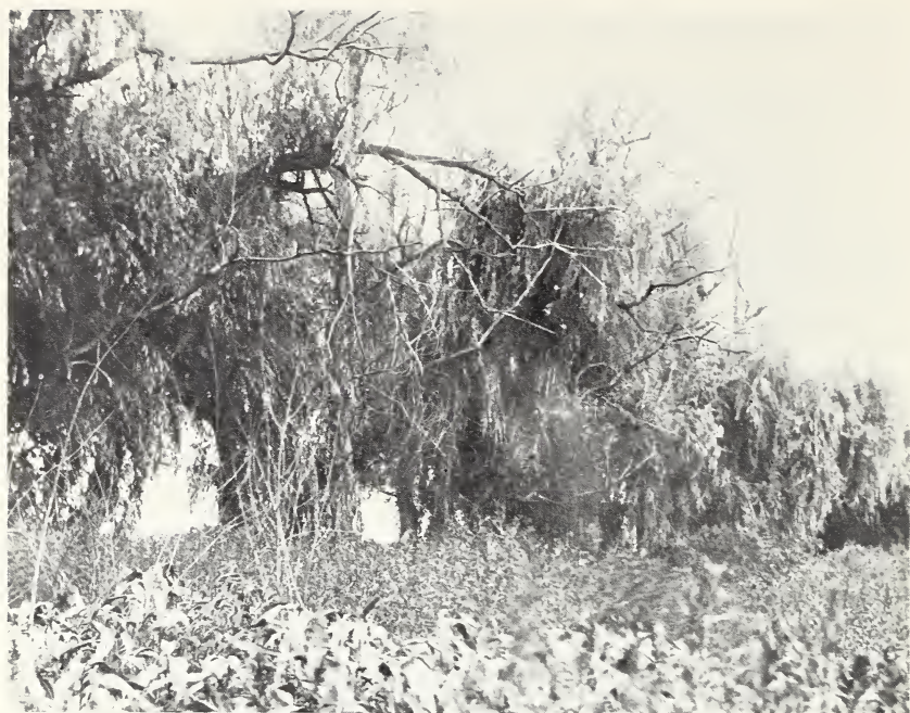
Figure 1.—Potomac Park in the middle and late 19th century.

Through the ages, the Japanese have equated the brief transient beauty of the cherry blossom with that of the human life: