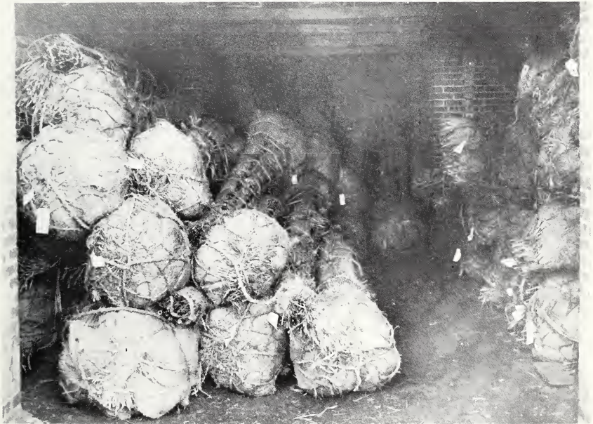
Figure 8.—First shipment of flowering cherry trees at the U.S. Propagating Gardens on January 6, 1910: top , Unloading the trees; bottom , storing the trees.