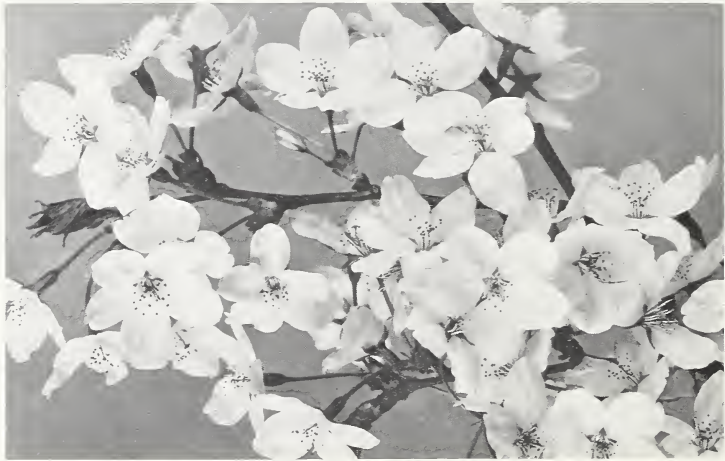
Figure 20.—Selected groups of cherry trees on the Tidal Basin—Continued: D , a specimen of Ichiyo selection in 1929; E , a grouping of Takinioi selection in 1930; and F , closeup of blossoms of Somei-Yoshino selection in 1921.