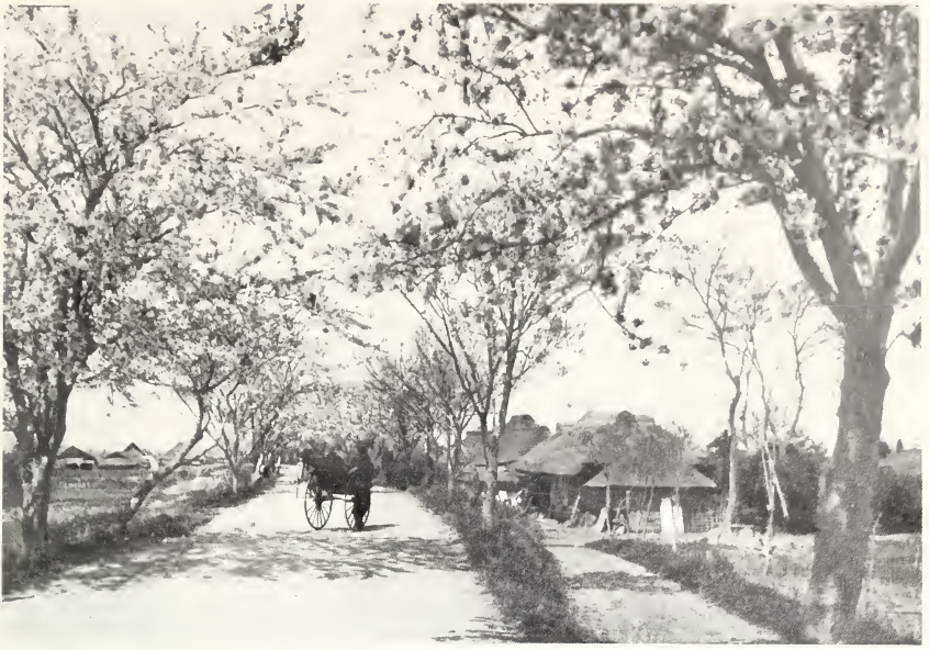
Figure 2.—Roadway in Japan in 1902 lined with flowering cherry trees.