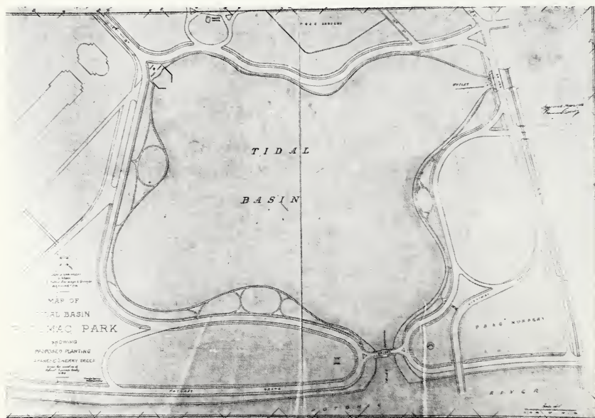
Figure 7.—Map of Tidal Basin showing proposed planting of Japanese cherry trees approved by Mrs. Taft on March 6, 1912.

Informing the Japanese Government of the ill-fated status of the donated flowering cherry trees required the utmost delicacy and diplomatic sensitivity. With the growing interest of the public in the cherry trees generated by the press, a reaction of dismay and regret best described the official mood of the individuals involved with this project. On January 21, 1910, Secretary Wilson informed J. M. Dickinson, the Secretary of War, of the need to destroy the trees (36). The Department of State took the necessary steps of communicating with the various Japanese officials concerning the deep regret felt by the Americans in this regard. This effort included an explanation regarding the responsibility of the Department of Agriculture in the area of foreign plant introduction