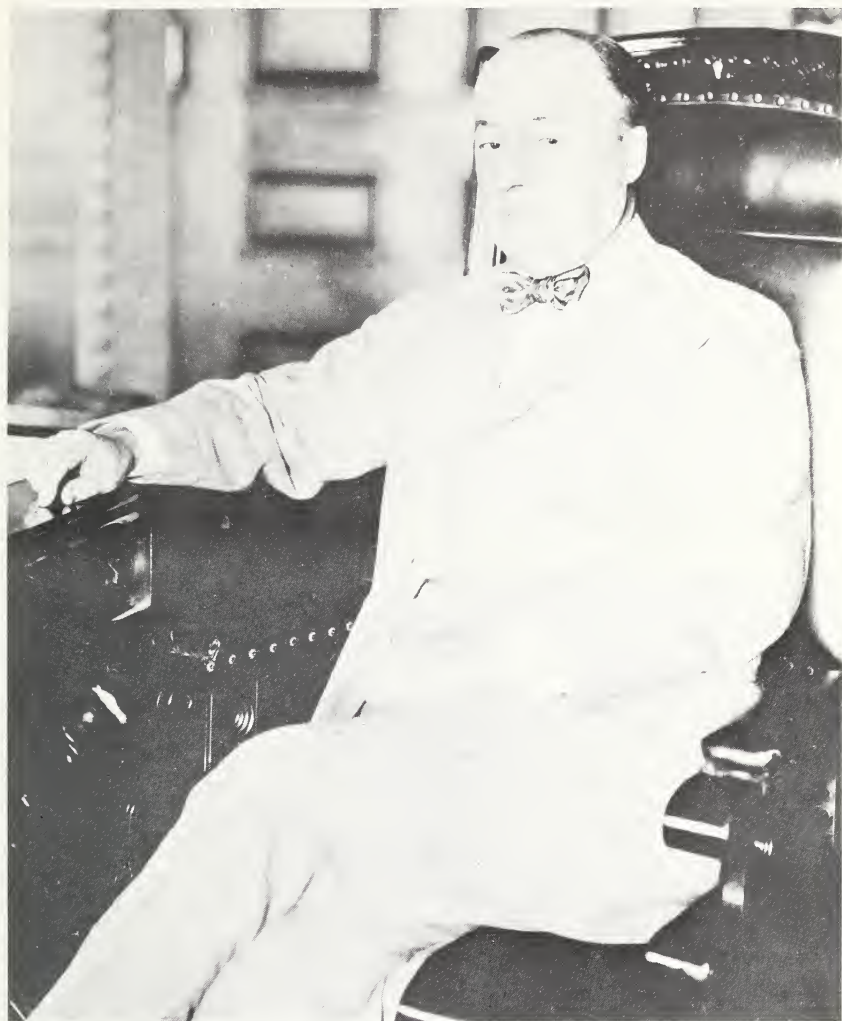
Figure 6.—Philander C. Knox, Secretary of State, 1909-1913.

the worse infestation by insects and root galls that he had ever encountered. He also stated that he believed younger stock would have arrived healthier (34). Neither the Japanese nor the American officials anticipated this unfortunate and potentially embarrassing situation. Yet, it clearly showed the need for an effective monitoring system of plant introduction into this country.