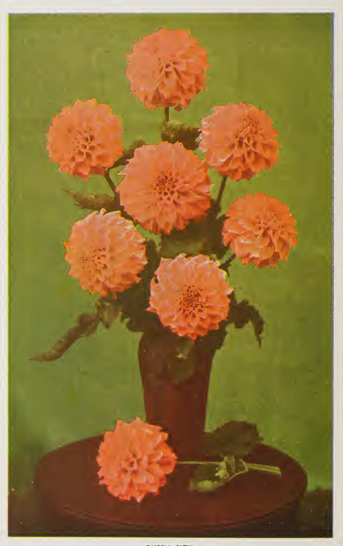
QUEEN CITY Ace of all cut flawer Dahlias, shawing exquisite New calor.