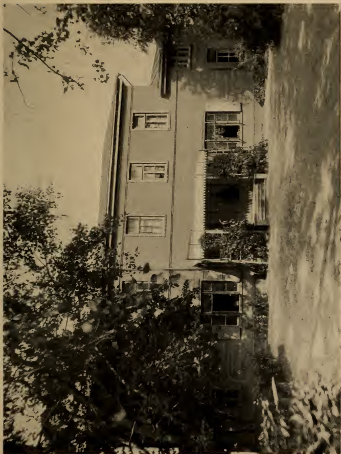
TOLSTOY'S HOME IN MOSCOW