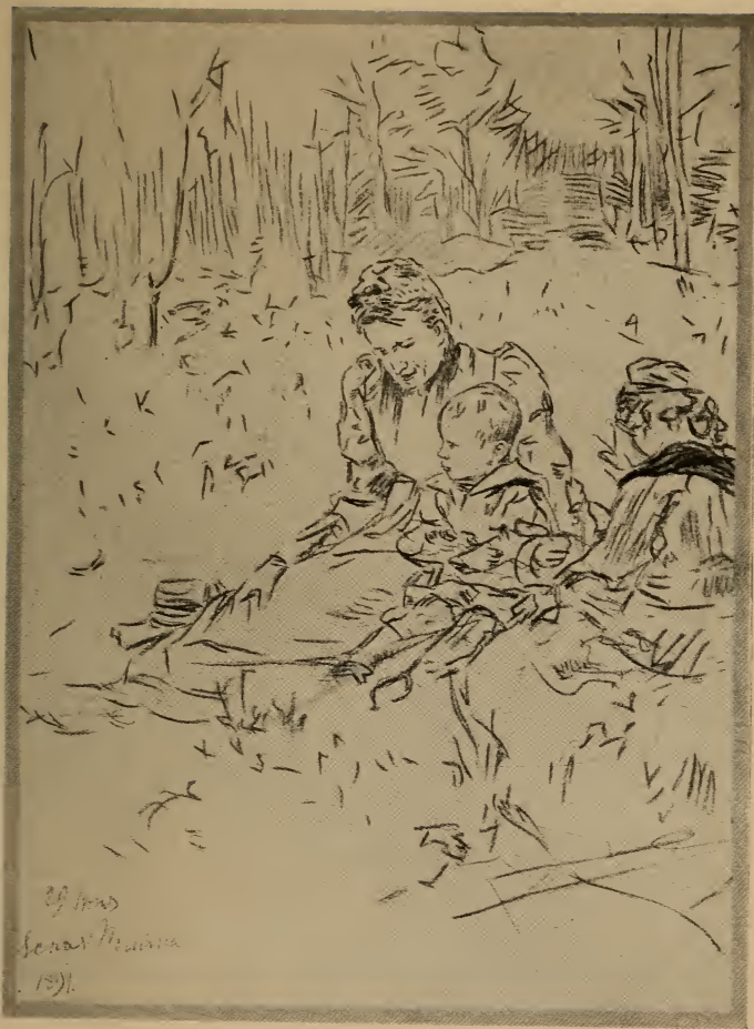
COUNTESS TOLSTOY AND THE YOUNGER CHILDREN