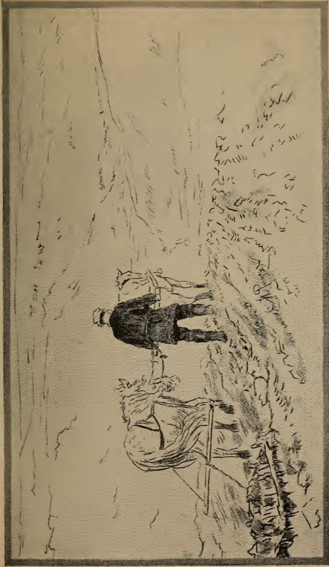
TOLSTOY PLOWING ON HIS FARM