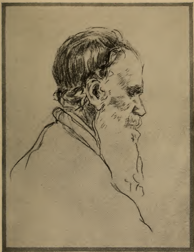
A RECENT PORTRAIT OF TOLSTOY