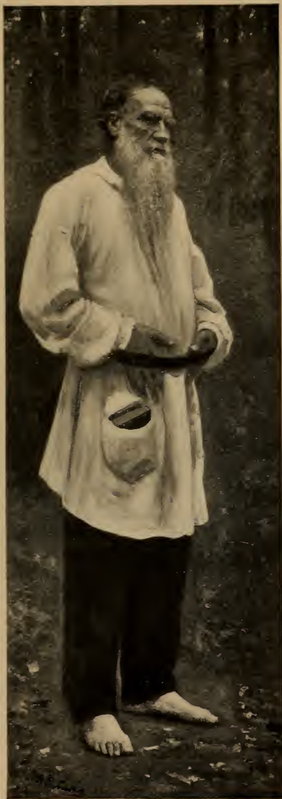
Drawn by J. Repin