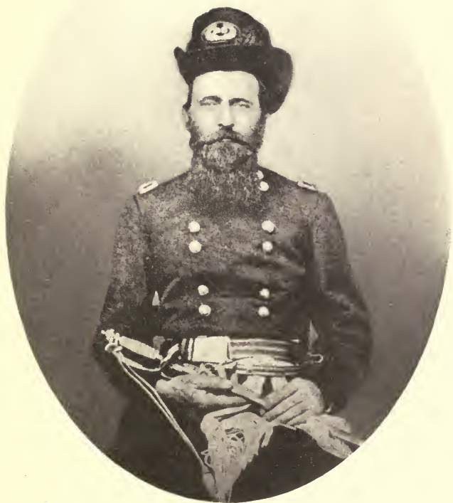
GRANT AS A BRIGADIER-GENERAL November, 1861