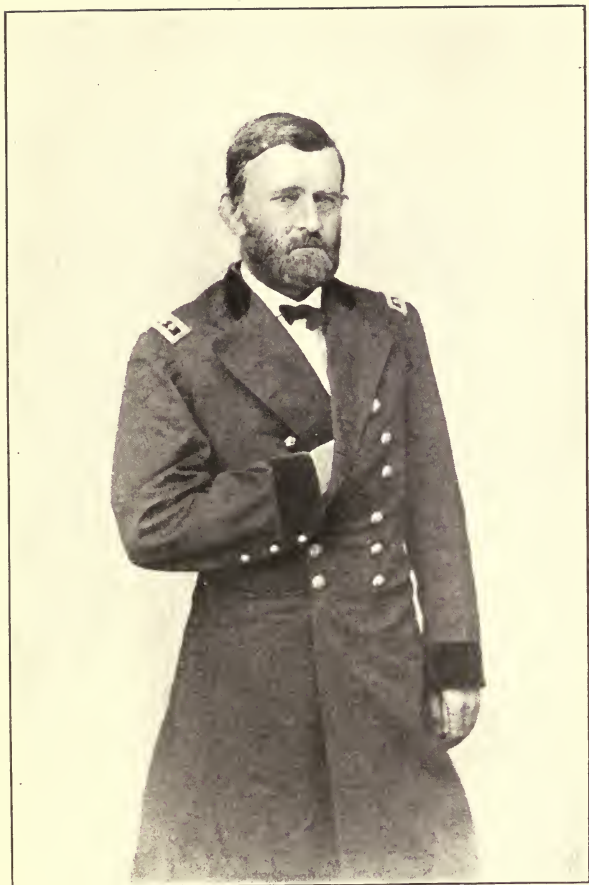
GRANT AS LIEUTENANT-GENERAL