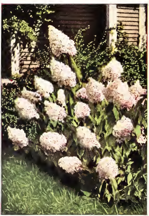
Hydrangea Paniculata Grandiflora.

Hydrangea PANICULATA GRANDIFLORA. One of the finest flowering shrubs. In bloom during August and September when very few shrubs are in flower. Perfectly hardy. White, Blue and Pink. 3 plants for $1.10.