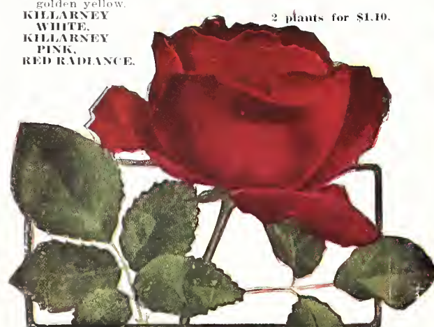
Red Radiance Rose.

SUNBURST. The color is orange-copper or golden orange and golden yellow. KILLARNEY 2 plants for $1.10.