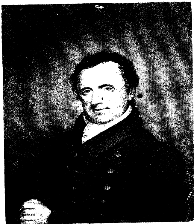
JAMES FENIMORE COOPER