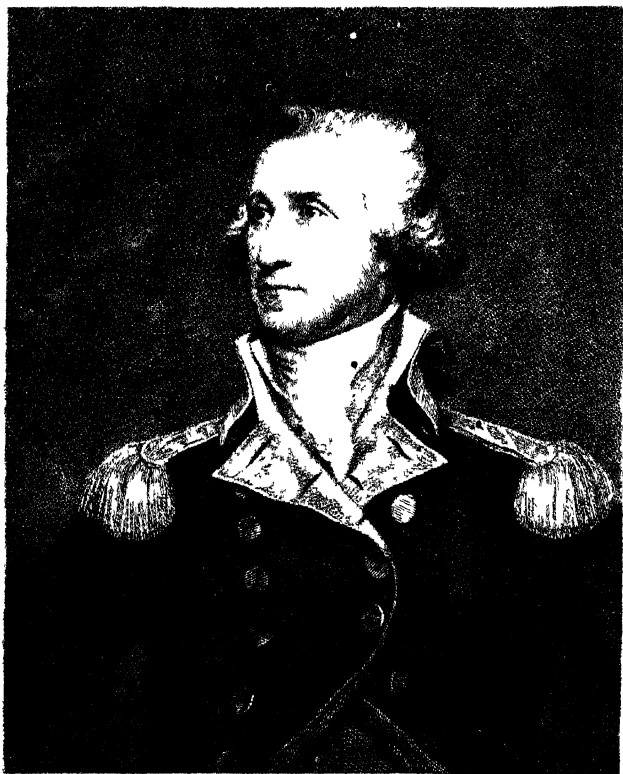
Painted by A. Howard in 1781, and by the French artist in 1783. The original is in the collection of the Library of Congress.