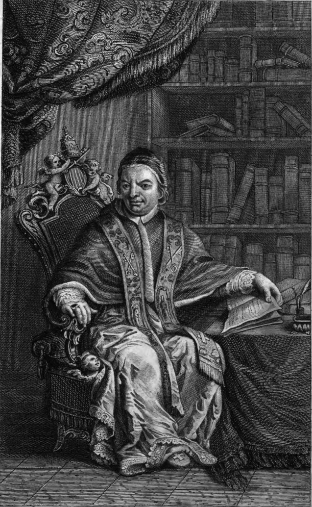
POPE BENEDICT XIV.