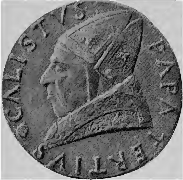
POPE CALIXTUS III (ALFONSO BORGIA).