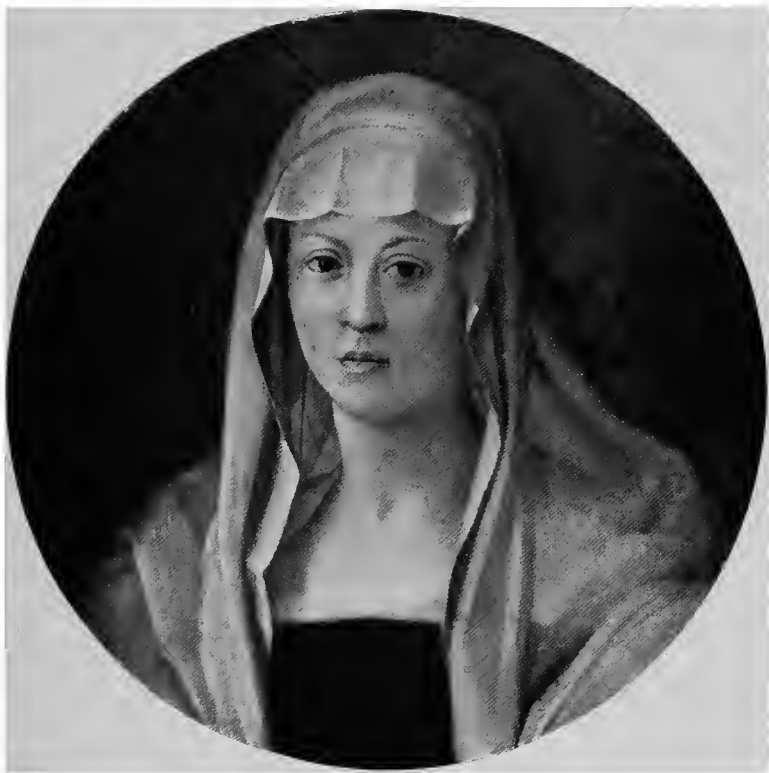
CATERINA SFORZA-RIARIO. (From the fresco by Gustavo Vasari.)