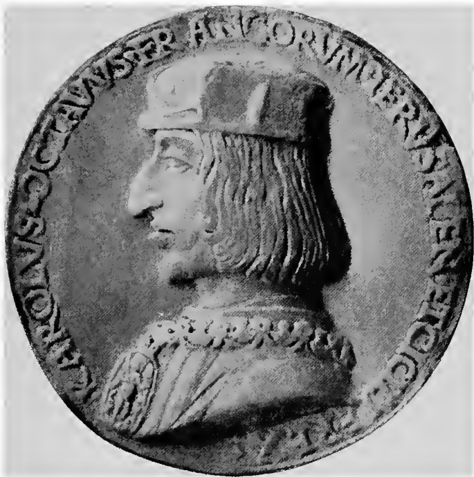
MEDAL OF CHARLES VIII OF FRANCE.