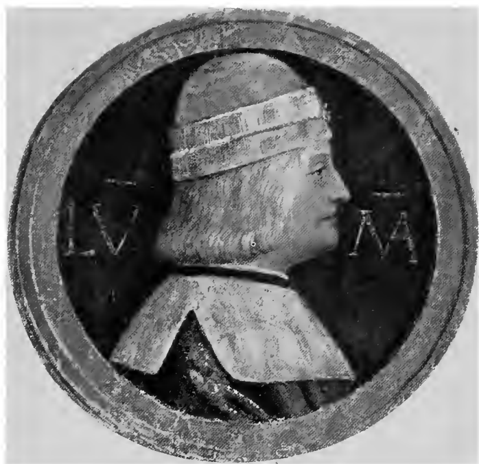
DUKE LODOVICO MARIA SFORZA. (From the fresco by Bernardino Luini.)