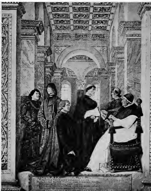
POPE SIXTUS IV (FRANCESCO DELLA ROVERE) GIVING AUDIENCE TO THE HISTORIAN PLATINA (KNEELING), PRESENTED BY CARDINAL GIULIANO DELLA ROVERE.