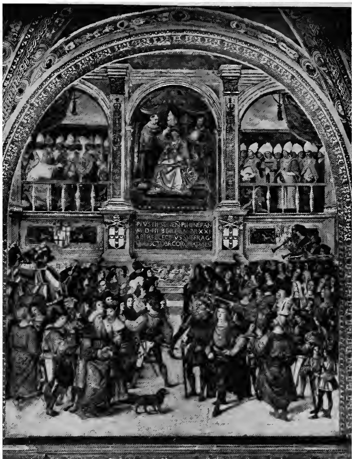
CORONATION OF POPE PIUS II (ENEA SILVIO PICCOLOMINI).