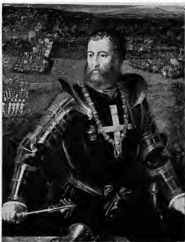
ALFONSO D'ESTE, DUKE OF FERRARA.