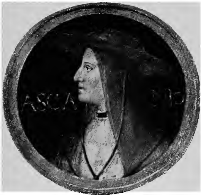
CARDINAL ASCANIO SFORZA. (From the fresco by Bernardino Luini.)