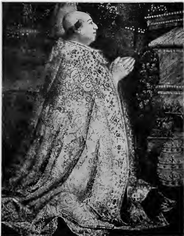
POPE ALEXANDER VI (RODERIGO BORGIA).