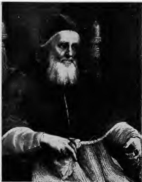
POPE JULIUS II (GIULIANO DELLA ROVERE).