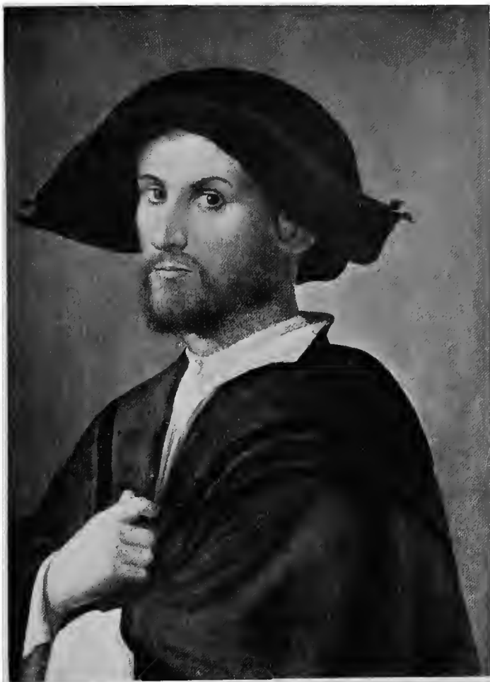
ALLEGED PORTRAIT OF CESARE BORGIA, BY GIORGIONE.