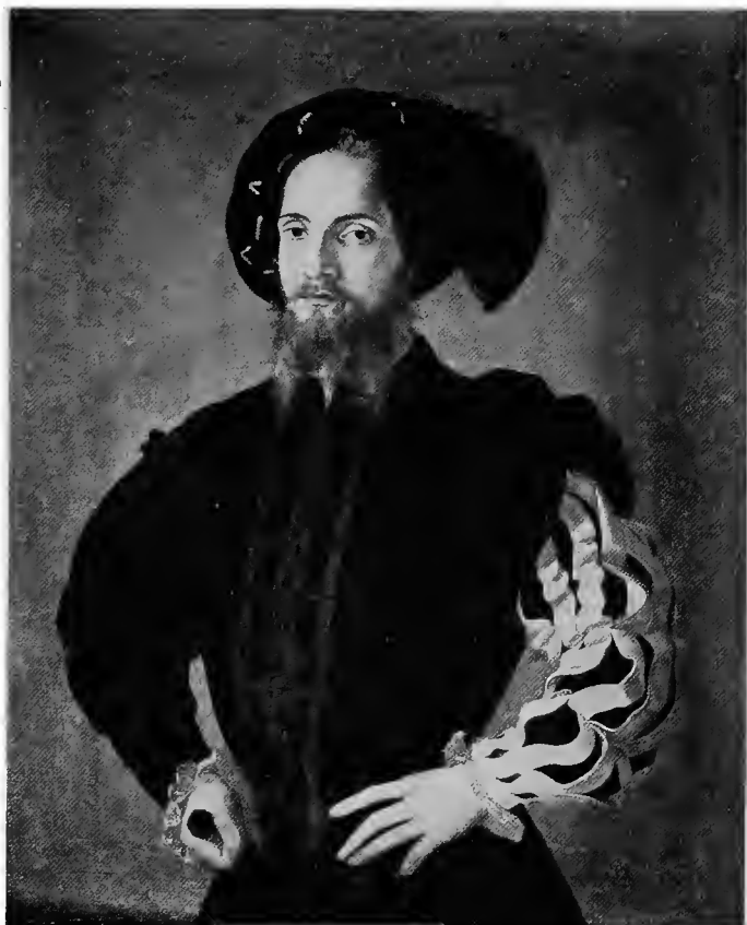
ALLEGED PORTRAIT OF CESARE BORGIA, ATTRIBUTED TO RAFFAELE SANZIO.