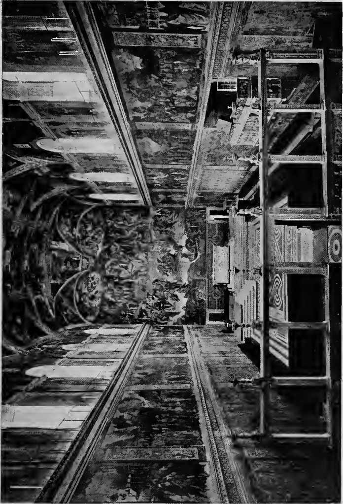
THE INTERIOR OF THE SISTINE CHAPEL.