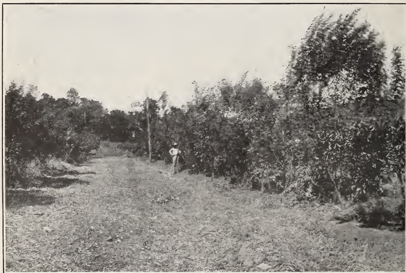
FIG. 2.—PIGEON PEAS AS TEMPORARY WINDBREAK FOR YOUNG CITRUS ORCHARDS.

1, Stizolobium velutinum , S. P. I. No. 24424; 2, S. aterrimum ; 3, S. cinereum ; 4, S. velutinum , S. P. I. No. 24357; 5, S. niveum ; 6, S. decringianum .