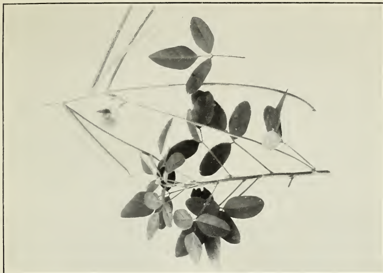
FIG. 2.—HABICHUELA PARADA ( PHASEOLUS SEMIERECTUS ).