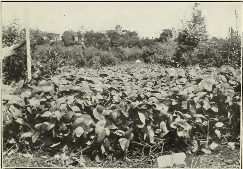
FIG. 2.— STIZOLOBIUM VELUTINUM , S. P. I. No. 24657, ON HEAVY SOIL.