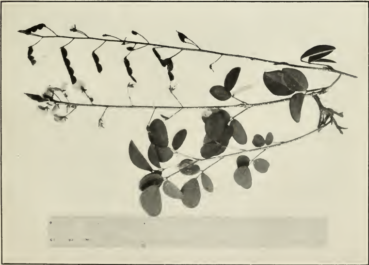
FIG. 1.—ZARZABACOA GALANA ( DESMODIUM ADSCENDENS ).