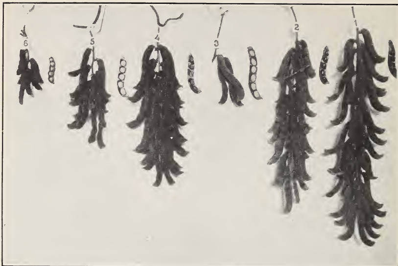
FIG. 1.—TYPICAL CLUSTERS, PODS, AND BEANS OF SIX VARIETIES OF STIZOLOBIUM.

1, Stizolobium velutinum , S. P. I. No. 24424; 2, S. aterrimum ; 3, S. cinereum ; 4, S. velutinum , S. P. I. No. 24357; 5, S. niveum ; 6, S. decringianum .