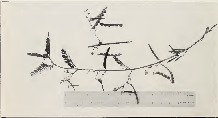
FIG. 1.—YERBA ROSARIO ( ESCHYNOMENE AMERICANA ).