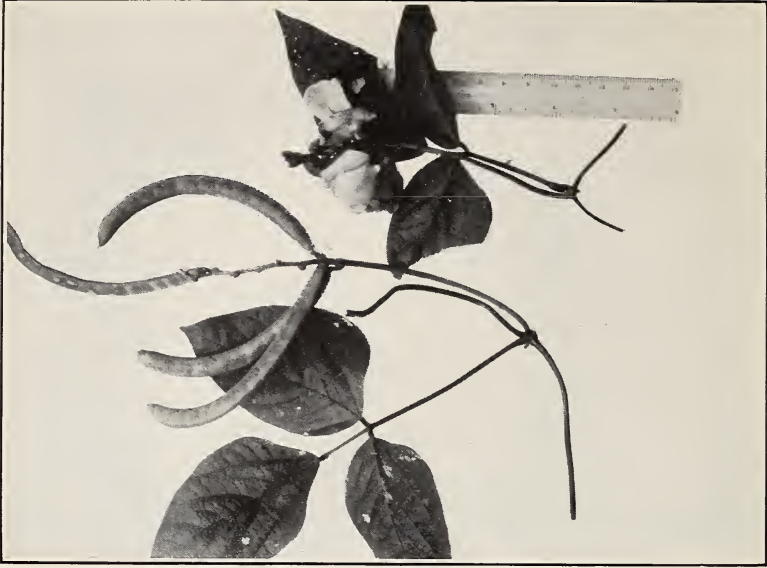
FIG. 2.—HABICHUELA CIMARRONA ( PHASEOLUS ADENANTHUS ).