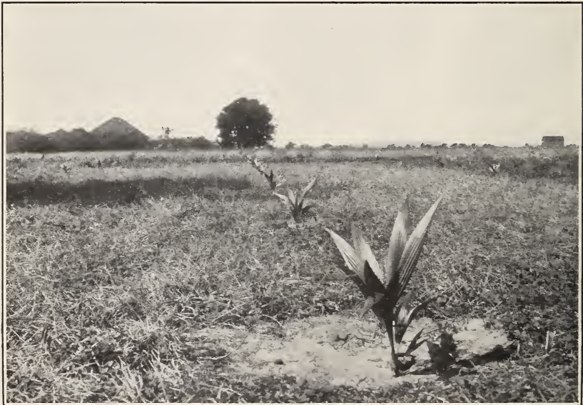
FIG. 2.—SAME FIELD AS ABOVE AFTER DRYING OF VINES. NO WEED GROWTH.