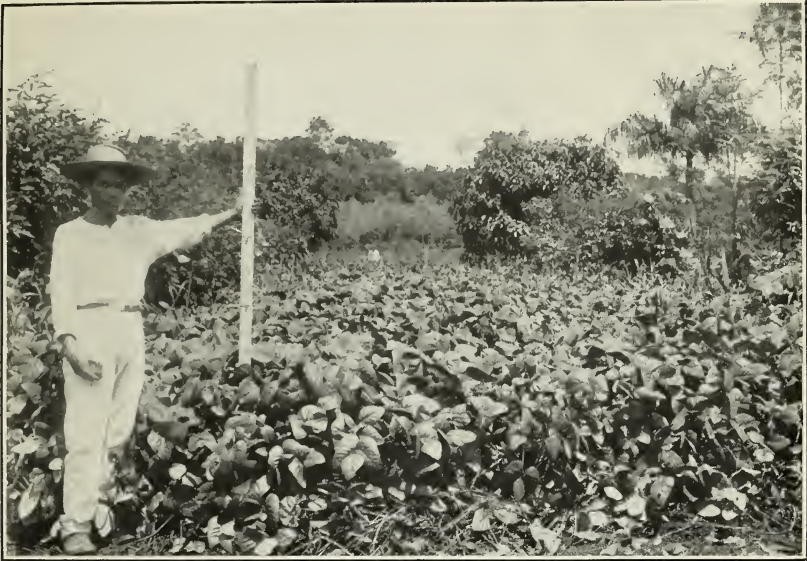
FIG. 1.—LYON BEAN ( STIZOLOBIUM NIVEUM ) ON HEAVY SOIL.