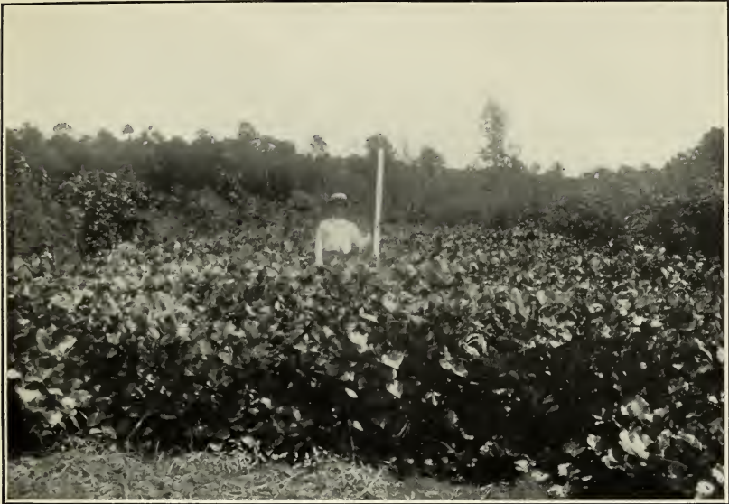
FIG. 1.—JACK BEAN ( CANAVALI ENSIFORMIS ).