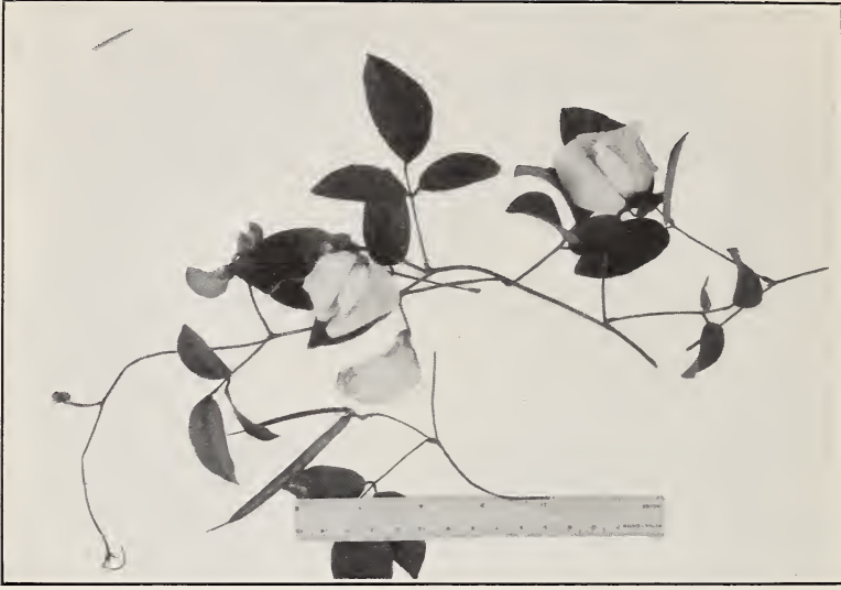
FIG. 2.—CONCHITA PELUDA ( CENTROSEMA PUBESCENS ).