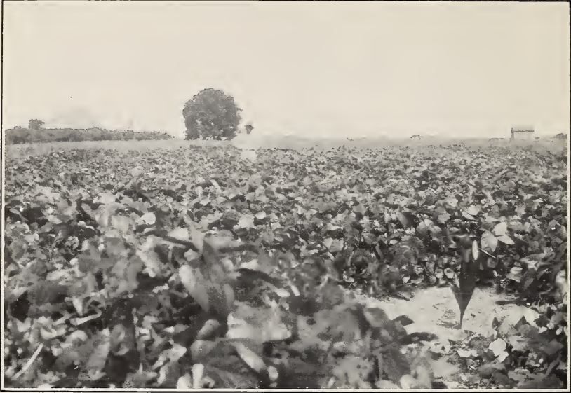
FIG. 1.—STIZOLOBIUMS AS COVER CROPS IN COCONUT PLANTATION. TYPICAL GROWTH IN SANDY SOIL.