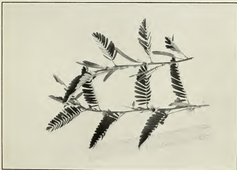
FIG. 1.—TAMARINDILLO ( CASSIA CHAMAECRISTA ).