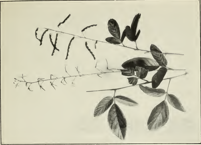
FIG. 2.—ZARZABACOA COMÚN ( DESMODIUM INCANUM ).