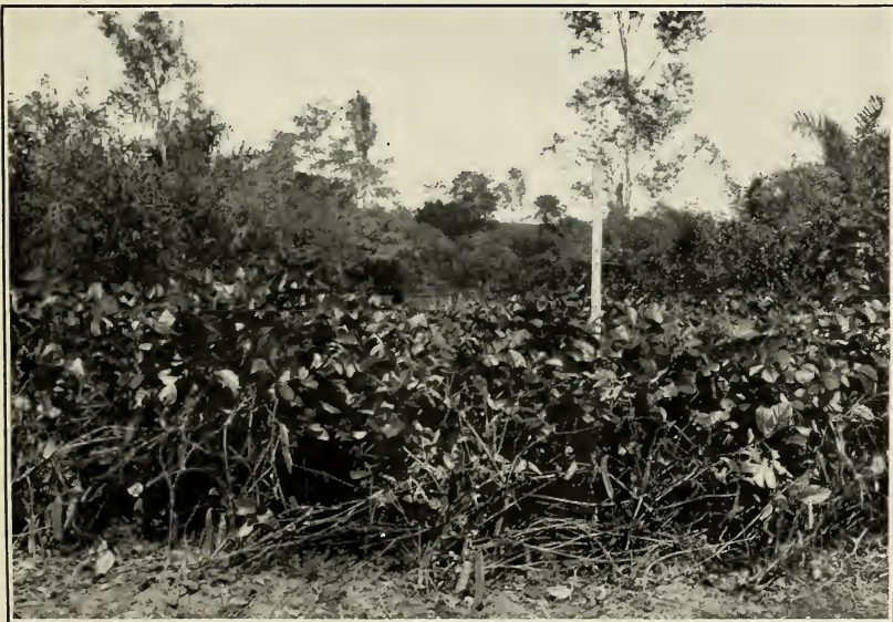
FIG. 2.—SWORD BEAN ( CANAVALI GLADIATA ).