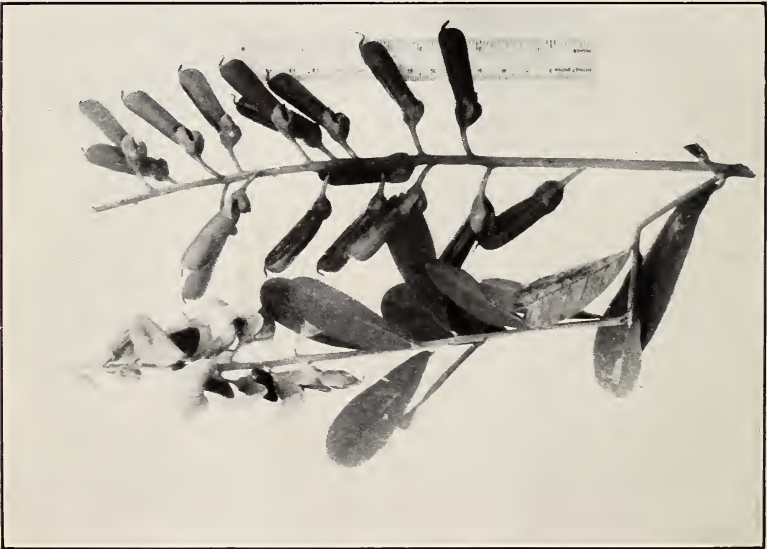
FIG. 1.—MATRACA ( CROTALARIA RETUSA ).