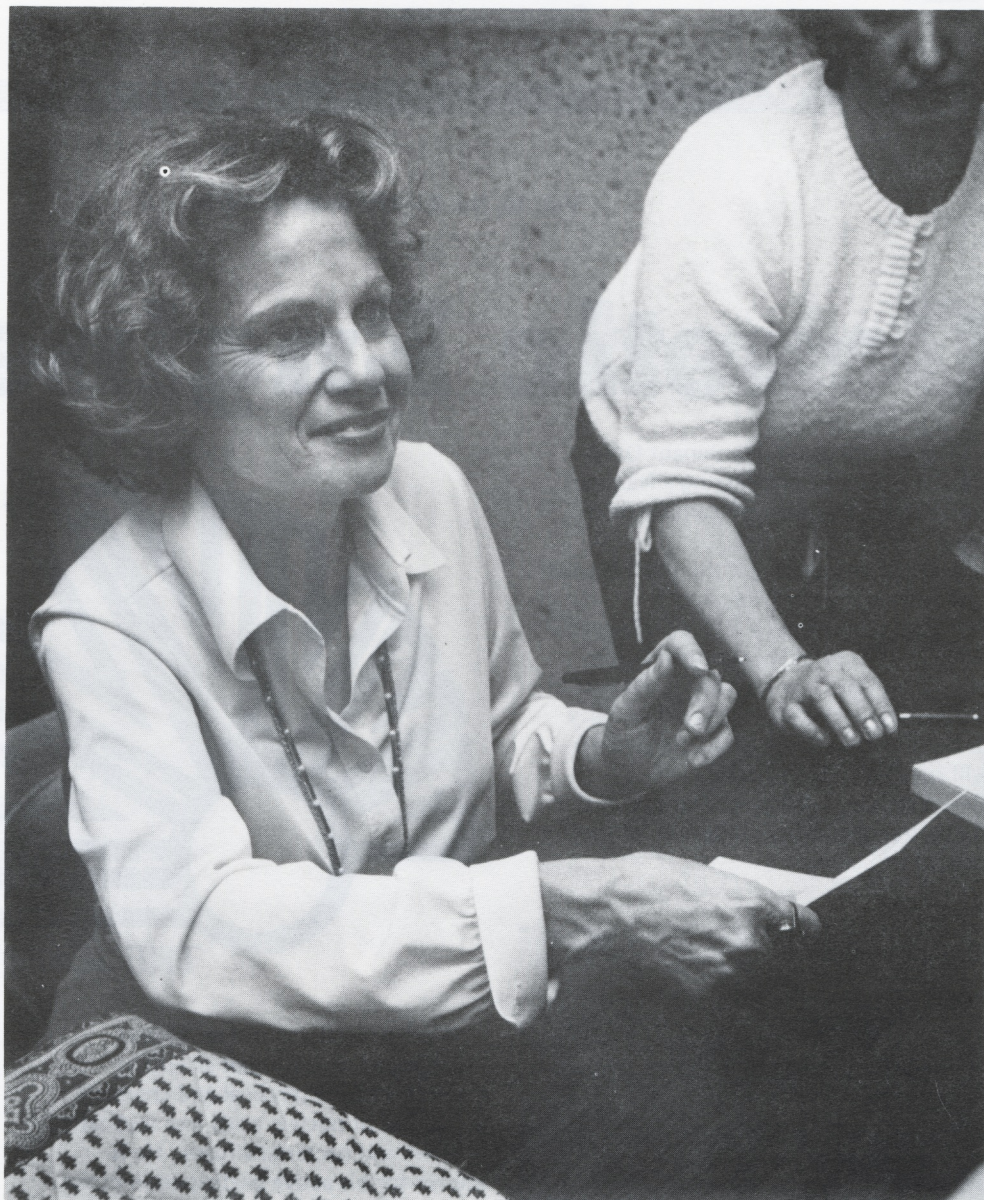
Shana Alexander of "60 Minutes" fame, autographs copies of her book, Talking Woman , in the lounge of the College/Alumni Union during her visit here to address Institute Forum on Oct. 25.