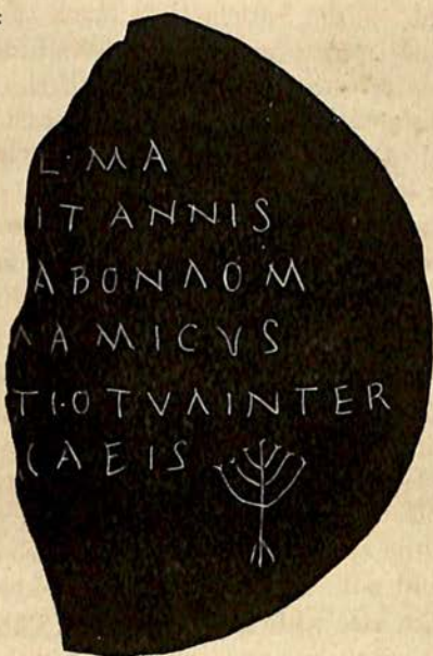
* JEWISH INSCRIPTIONS FROM THE CATACOMBS.

k Later excavations have brought to light other curious circumstances concerning this Jewish catacomb. See Cimitero degli Antiche Ebrei , per Raffaelli Garrucci, Romæ, 1862. I. Before the entrance of the actual cemetery, there appears to have been a synagogue or proseucha (p. 5), closely resembling the mortuary chapels or places of worship of the early Christians. II. Of forty-three inscriptions, twelve only were in Latin (p. 63), thirty-one Greek, a singular illustration of the prevalence of Greek among the early Christians. But "the Latin proper names are double the number of the Greek; the Greek, again, twice as many as the