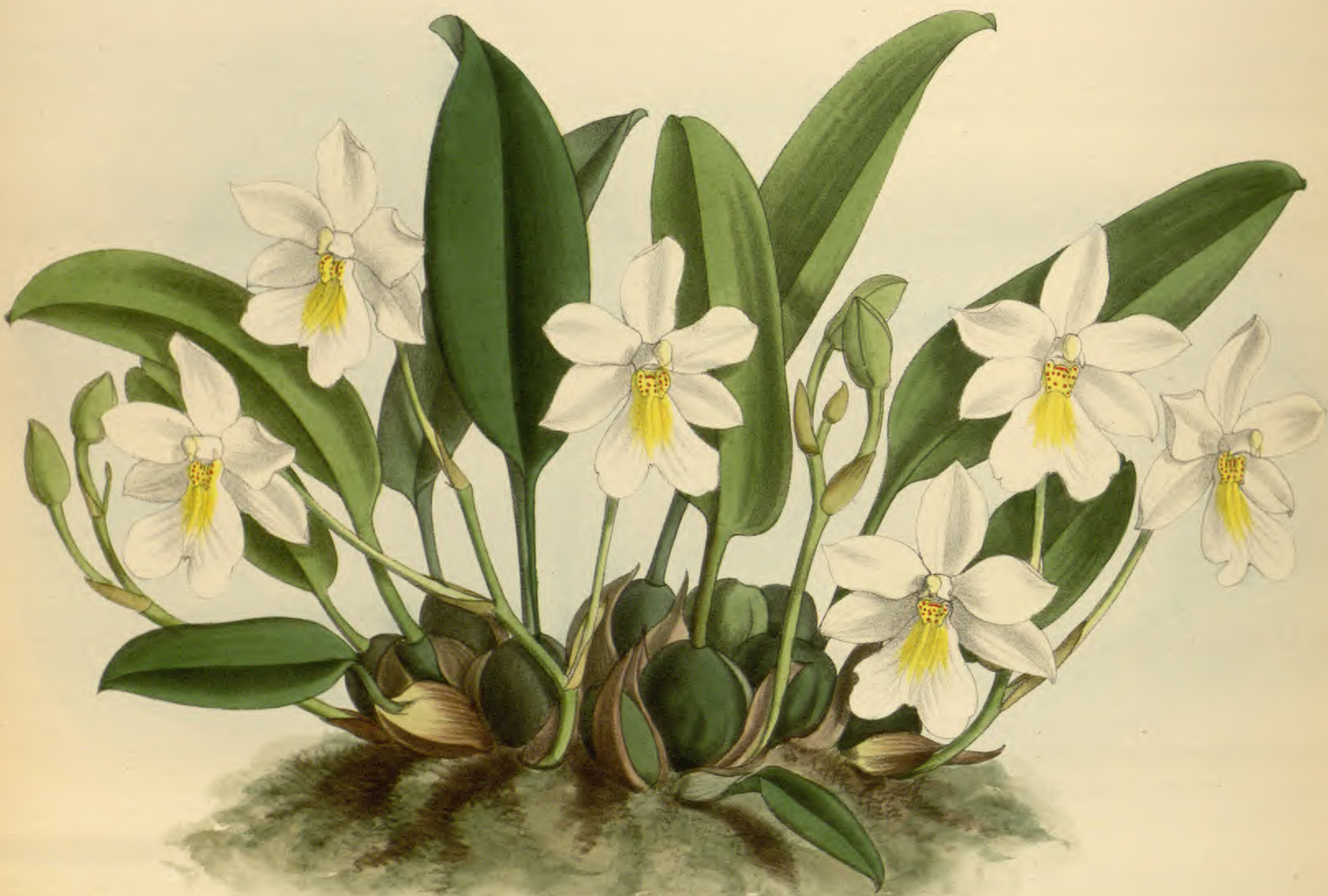
ODONTOGLOSSUM OERSTEDII MAJUS.