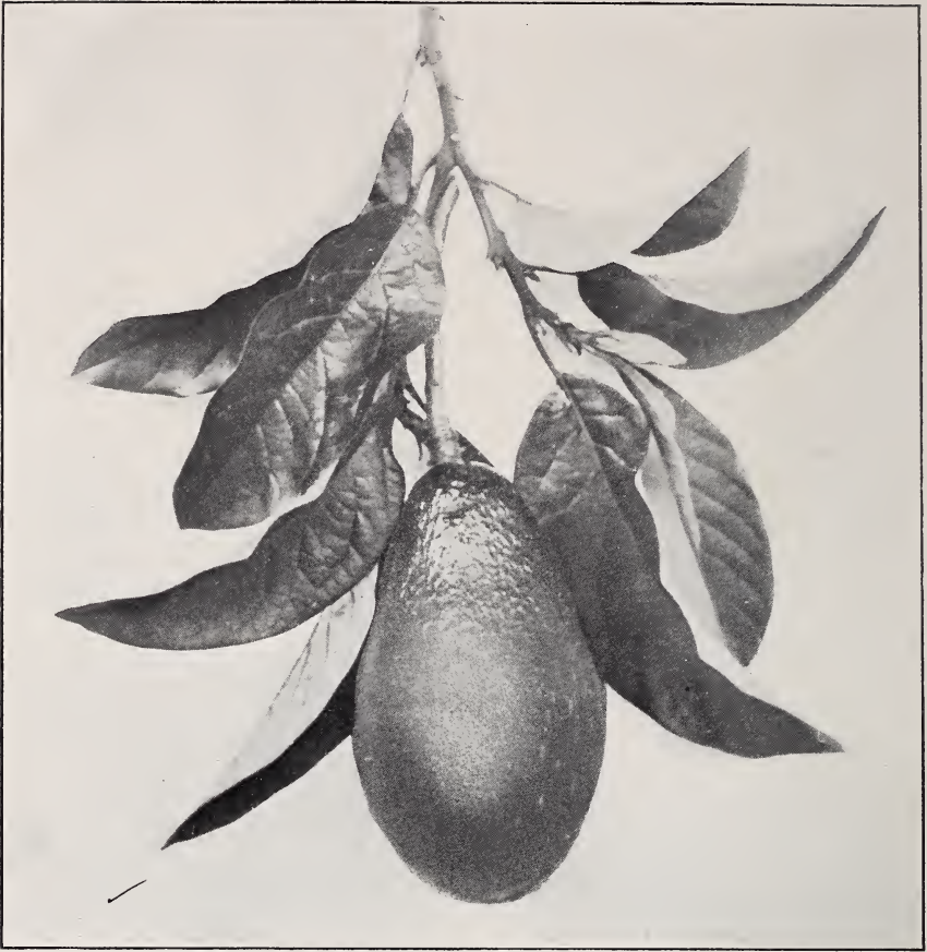
The Dickey Avocado, grown at Hollywood,—an ideal fruit.

Our stock was not sufficient to fill the orders received, and we have now no trees ready for delivery, but will have for delivery during the fall of 1913 a fine stock of budded trees of the following varieties:—