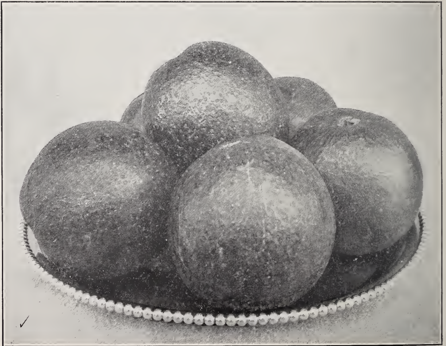
The Redondo Avocado. A hardy variety of first quality. Being as round as an orange it packs particularly well. The fruits average from one to one and a fourth pounds in weight.