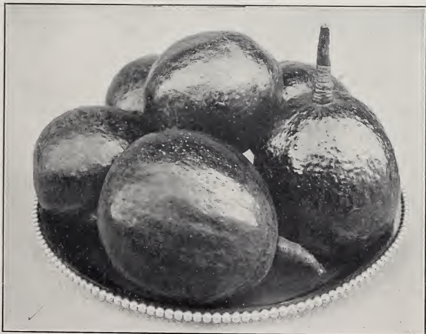
The California Trapp, one of the finest Avocados of Mexico, found after much search by a West India Garden Explorer.