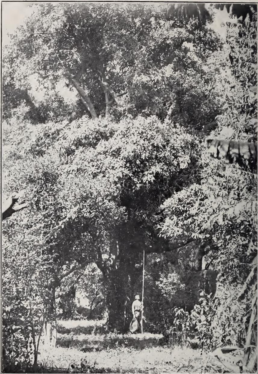
The famous Montezuma Avocado Tree, in Mexico. Said to be 200 years old. Measures 4 feet across at the base, and yields an annual crop of 3000 delicious fruits weighing one pound each.