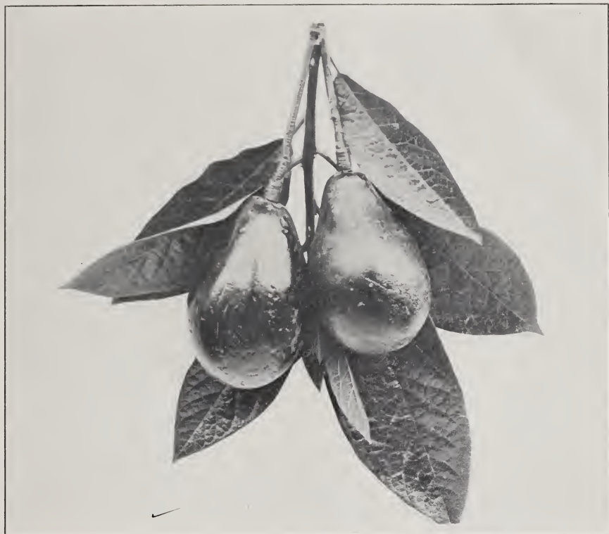
The Northrop, a good variety of the smaller, thin-skinned, purple Ahuacate.