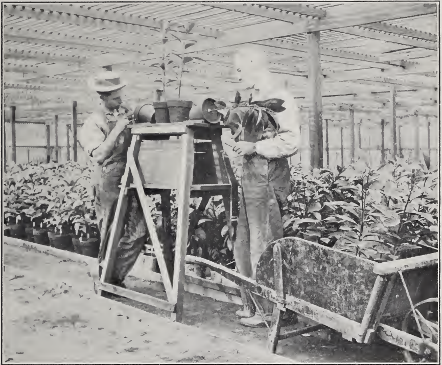
Budding Avocados in the lath house, West India Gardens.

sible to have fruits of good quality maturing the year round.