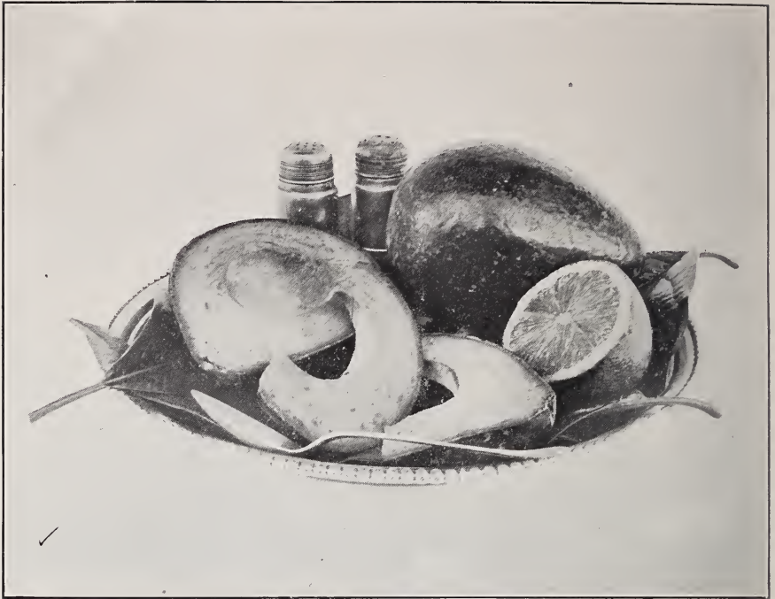
Fruit from the Montezuma Avocado Tree shown on the preceding page. Weighs about one pound. Is of good form and flavor, has a small seed tight in the cavity, and a thick, green skin.