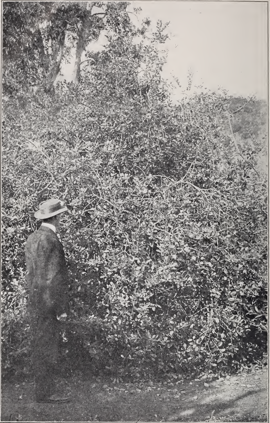
The first Feijoa planted in Europe. Parent of the majority of Feijoas in both Europe and North America.