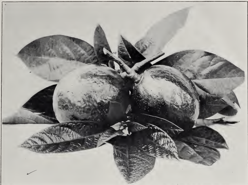
The Meserve, a variety originated near Long Beach, Cal., a fruit of unusually rich flavor.