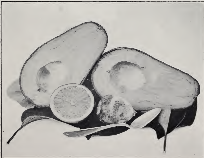
W. I. G.'s "Nineteen", an exceptionally fine pear-shaped fruit weighing one and one-half pounds. The strong, thick skin can easily be seen. This fruit has an unusually large proportion of meat to seed.