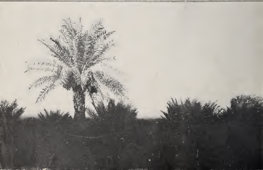
Evening in the Date Garden, Coachella Valley, California