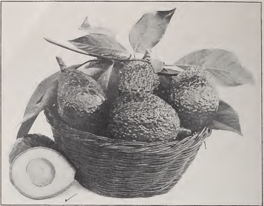
The Dickinson Ahuacate, a true Guatemalan type.