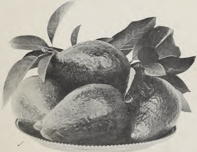
The Taft Avocado