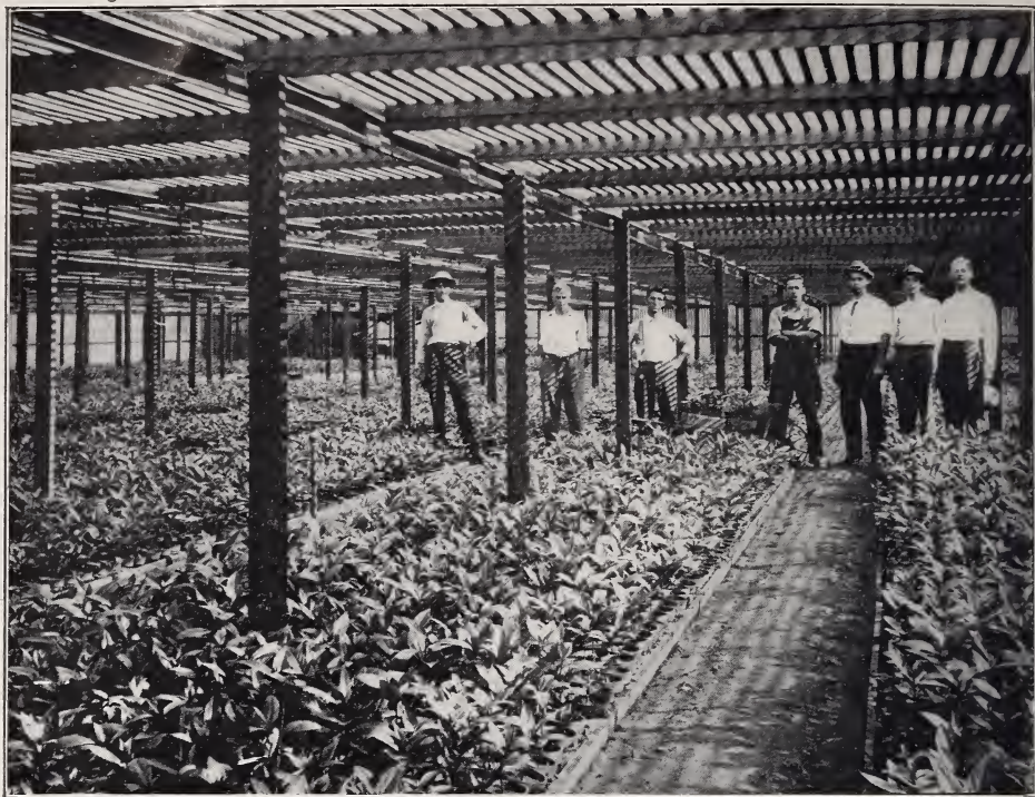
Lath House, containing 40,000 Avocado Trees in four-inch pots, at our Nurseries, Altadena.