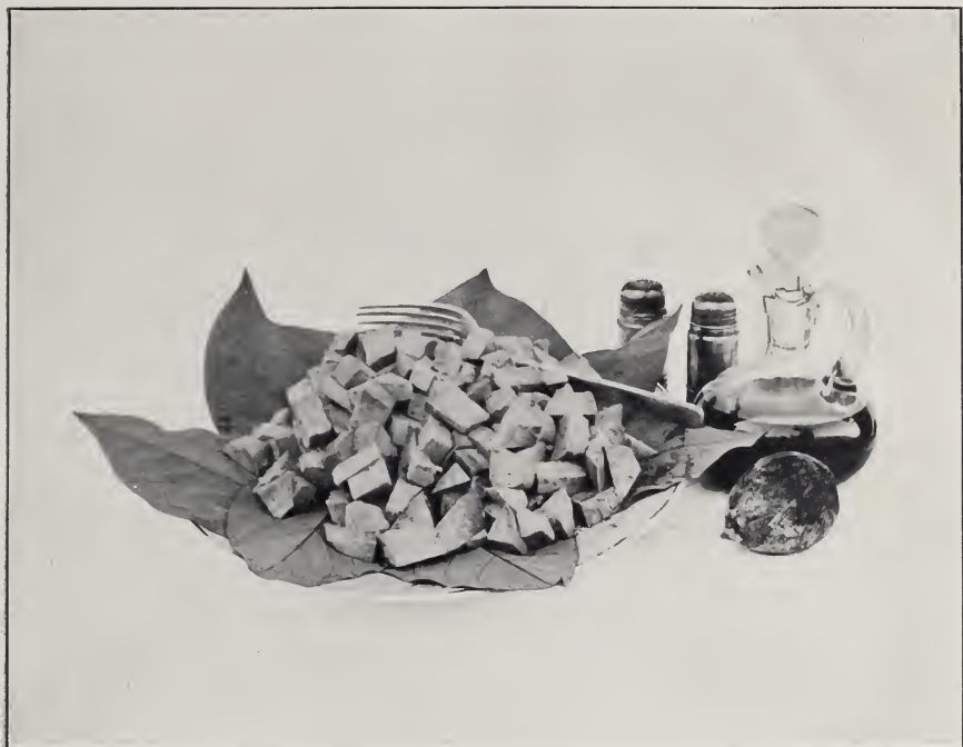
An Avocado Salad, made from a single fruit (the fruit shown below) enough for from four to six persons.