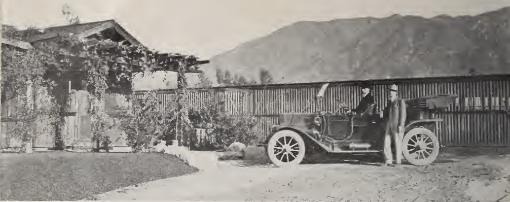
At the Office of the West India Gardens

A cordial invitation is extended to you to visit our nurseries on any day of the week but Sunday. Take the Altadena car, going north on Fair Oaks Avenue, in Pasadena, get off at Calaveras Street, Altadena, and walk one block and a half east.