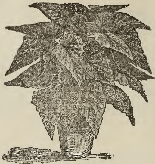
Begonia Argenta Gutatta