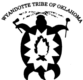
Wyandotte Tribal Shield