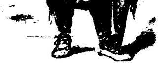
Huron after European contact, 1700s

of Quebec. Other Wendat, later known as Wyandotte, journeyed westward. For more than two centuries they were compelled by Native American enemies and non-Indian settlers to move first to the western Great Lakes region, then back to the east, eventually to Upper Sandusky, Ohio. In 1858 the Wyandotte finally were settled in what is now Oklahoma.