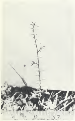
Figure 4.--A white-cedar seedling produced by direct seeding. This started in a spot on which some of the forest floor from a white-cedar stand had been spread. Photo taken at end of first growing season.

Favorable moisture conditions are highly important for the germination of white-cedar seed and establishment of seedlings. In one experiment involving artificial seeding of white-cedar, 49 percent of the seed germinated in clear-cut plots in a constantly moist swamp, whereas in similar plots on a drier but still poorly drained site, only 16 percent germinated on exposed soil (8). Probably because of the small amount of reserve food in the seed, white-cedar seedlings develop a very short taproot. Hence, the successful establishment of seedlings requires not only adequate surface moisture for seed germination, but also continued moisture within reach of the comparatively shallow roots.