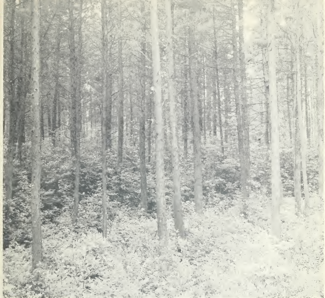
Figure 6.--A stand of white-cedar that had been thinned 18 years ago. Note the understory of hardwoods and shrubs that has developed. Compare this understory with that of the dense stand in Figure 2.

Reaction to competition. --White-cedar is more tolerant than such associated species as gray birch and pitch pine, but much less tolerant than red maple, blackgum, sweetbay, and other hardwoods that form the climax on swamp sites in its range (1, 8). White-cedar reproduction can grow through and eventually overtop scattered to moderately dense shrubs such as highbush blueberry, though in the process the cedar shoots may become extremely slender--almost like grass. However, the cedar is not sufficiently tolerant to grow through the denser shrub thickets or through a hardwood overstory.