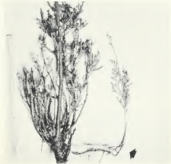
Figure 3.--A white-cedar seedling that has layered after repeated browsing by deer. Note the branch on the right that has developed roots.

White-cedar sometimes develops shoots from lateral branches or from dormant buds on the stem when seedlings or saplings are severely browsed or otherwise injured. One white-cedar seedling girdled by meadow mice produced 26 sprouts 1 to 4 inches long at its base. White-cedar seedlings that have been repeatedly browsed by deer may develop multiple stems through layering (fig. 3). From one such