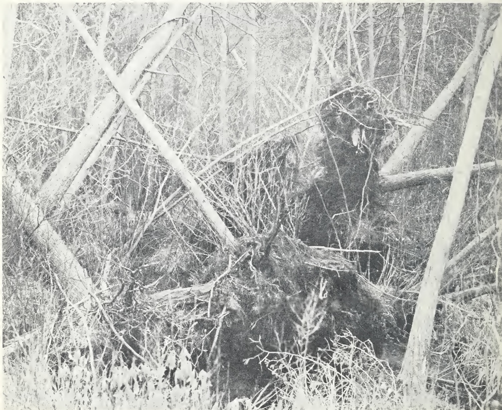
Figure 5.--An example of gradual windthrow in a white-cedar swamp, favoring the development of understory hardwoods and shrubs. Note the shallow root systems of the white-cedars in this wet peat soil.

Potentially white-cedar is a relatively long-lived species: according to one source, some trees have reached 1,000 years in age (3). But, as stands, 200 years may have been the usual maximum (8).