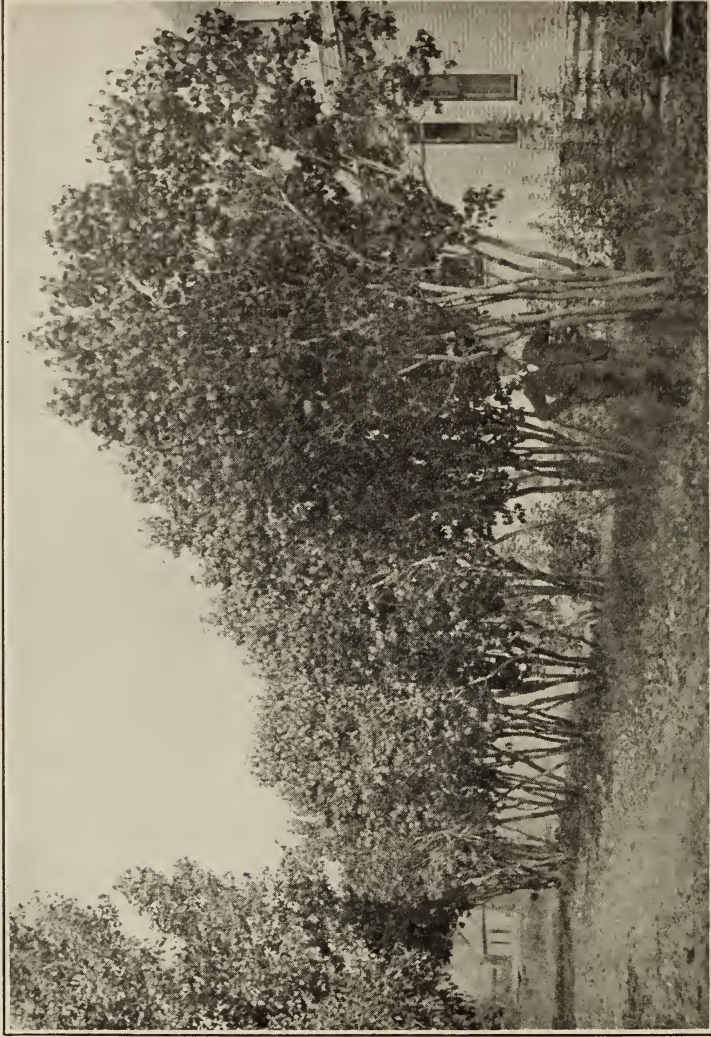
Ludwig-Spaeth Lilac is unexcelled for low wind breaks or hedges. You can grow them 12 to 14 feet high if you wish, or keep them low for hedges. A most beautiful sight when in bloom. We have choice plants at low prices. This cut shows Lilac, 14 feet high, on grounds of O. D. Shields, at Loveland.