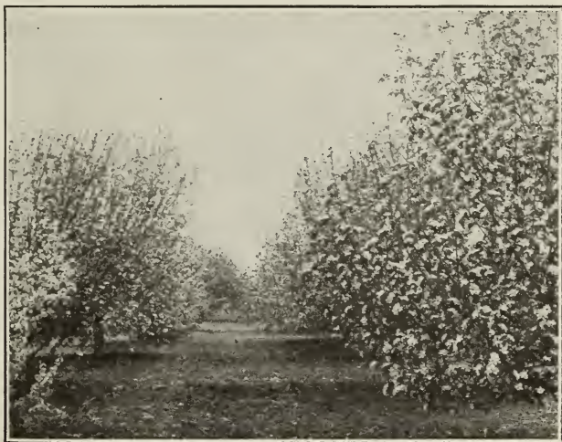
Apple Orchard, Note Low Headed Trees.

Gano—Fruit yellow, almost covered with dark red; large and hand-