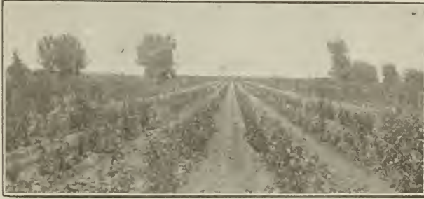
Block of Our Budded Cherries.

✓ *Early Richmond—The old favorite; a good market variety, good grower, hardy, healthy; medium size, bright red, acid; first of July.