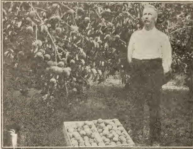
Colorado Peaches, Picking Time.

✓Triumph—Blooms late; ripens about July 1st. Fruit very large