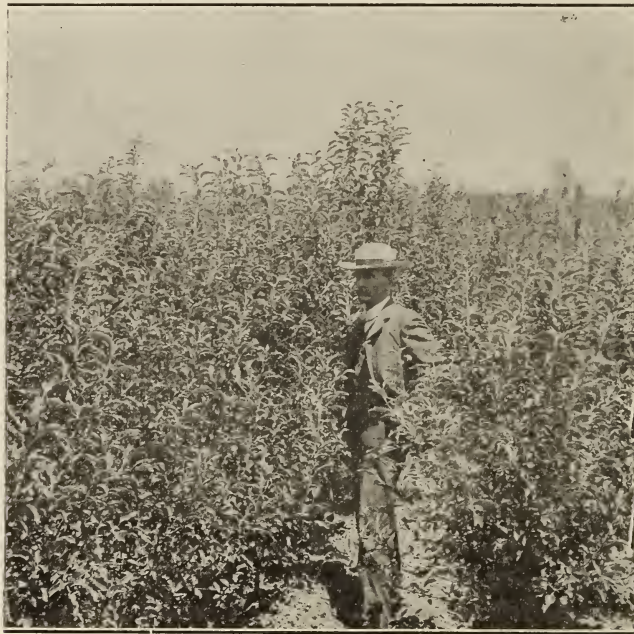
Field of Two-Year-Old Apple Trees.

✓ Price Sweet—Medium size, yellow, striped with red; very sweet. Not a long keeper.