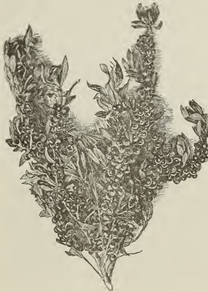
Rocky Mountain Dwarf Cherry.

✓ Montmorency Ordinaire—Recommended especially as a canning