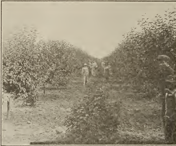
Cherry Orchard—Picking time.

ger plantings are being made each year. The cherry is not hard to transplant if good stock is used and reasonable care is taken in planting, and we believe the cherry orchard will show a larger return on the