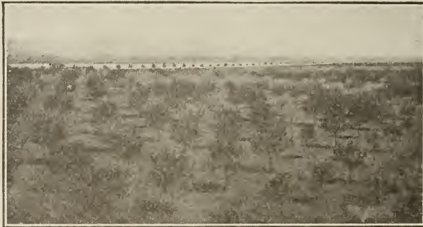
Two-Year-Old Cherry Orchard North of Loveland.

We can show you a young cherry orchard near Loveland of ten acres that netted over all expenses $360.00 per acre, and can show you