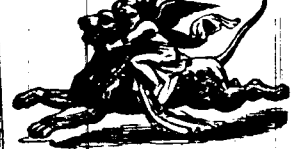
Advertisement for a medical product or service.

AUCTION SALES. Advertisement for auction houses and sales.