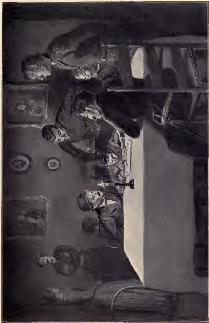
He drew them plans of the roads and hills and big woods.