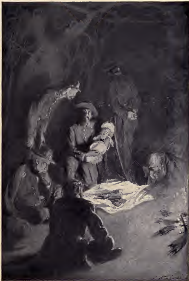
Colonel Stafford unwrapped the bundle and disclosed a large doll, a tiny blue uniform and sword.