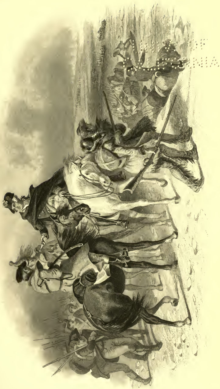
WASHINGTON CROSSING THE DELAWARE