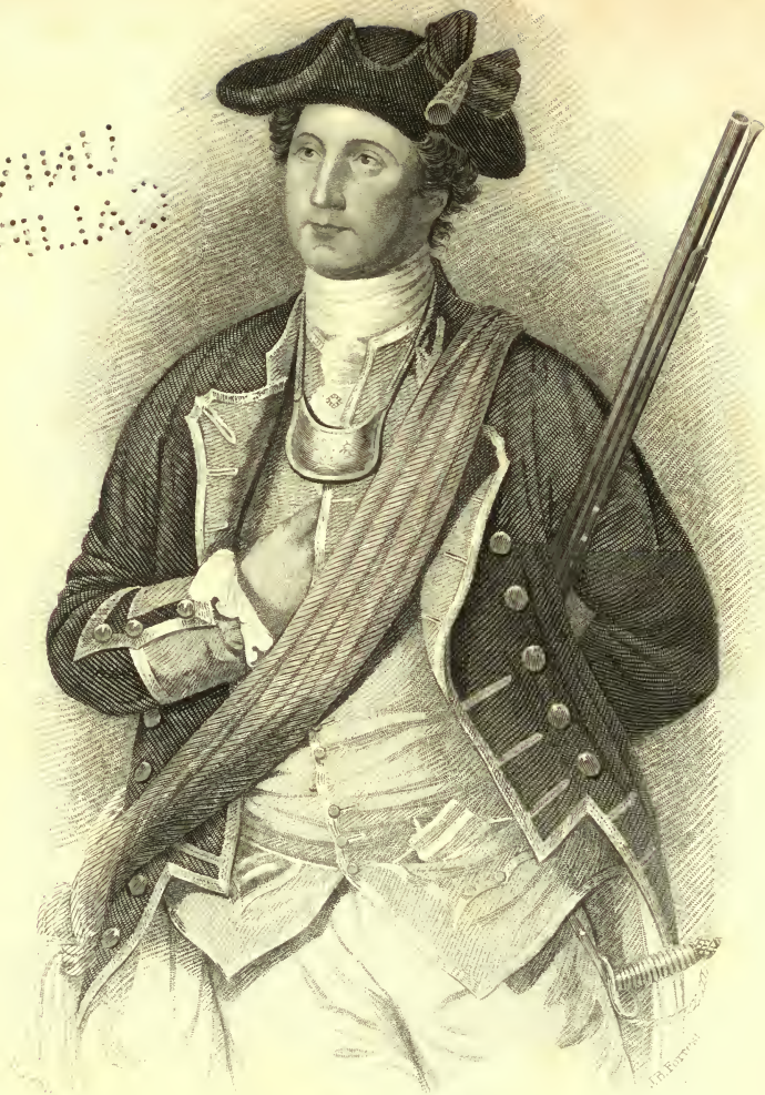
Gen. Washington in the uniform of GWI Captain Regt