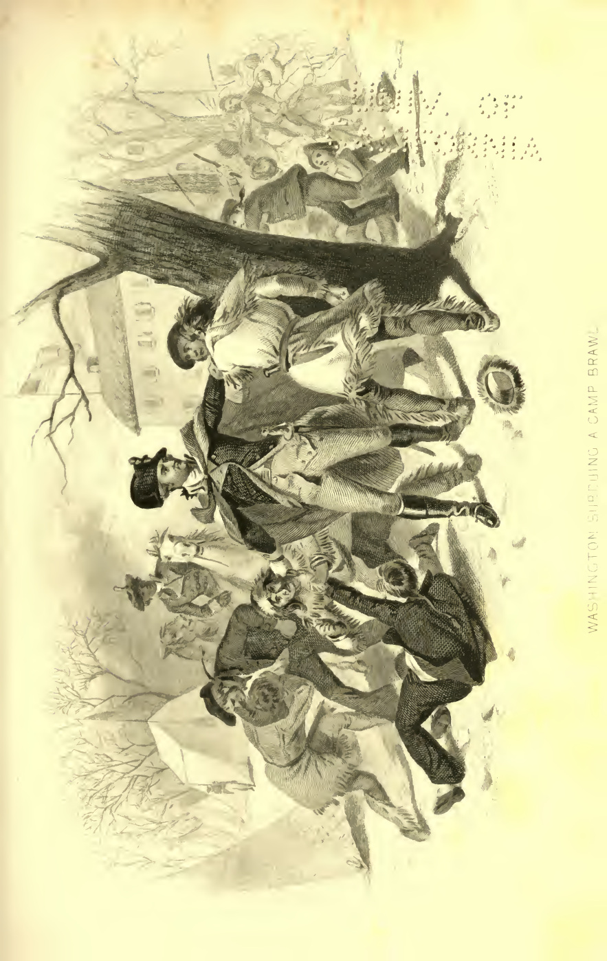
WASHINGTON: SURVIVING A CAMP BRAWL